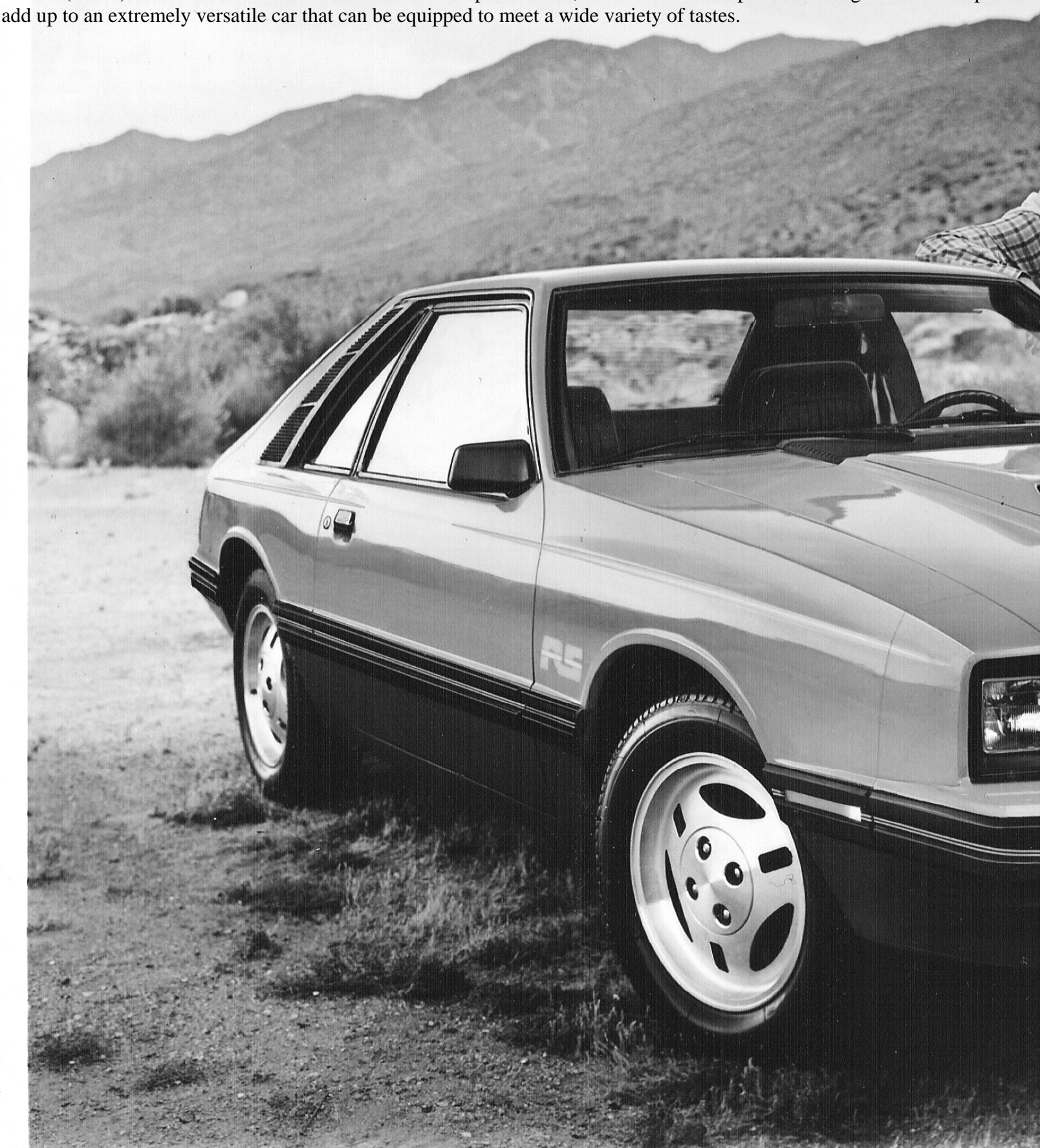
1979 MERCURY CAPRI RS

The 1979 Mercury Capri is available in four versions - the well-equipped base Capri, the sporty Capri RS (above), the performance oriented Turbo RS and the luxurious Capri Ghia. The Capri's standard powertrain is a 2.3-liter overhead cam four-cylinder engled with a four-speed manual transmission. Optional powerplants include a 2.8-liter V-6, a 5.0-liter V-8 and a turbocharged of the four-cylinder engine. Three levels of suspension - base, Radial Sport and one based on Michelin's revolutionary TRX wheels (above) - are also available. The broad choice of powertrains, standard rack-and-pinion steering and three suspension add up to an extremely versetile cap that cap be equipped to meet a wide veriety of testes.