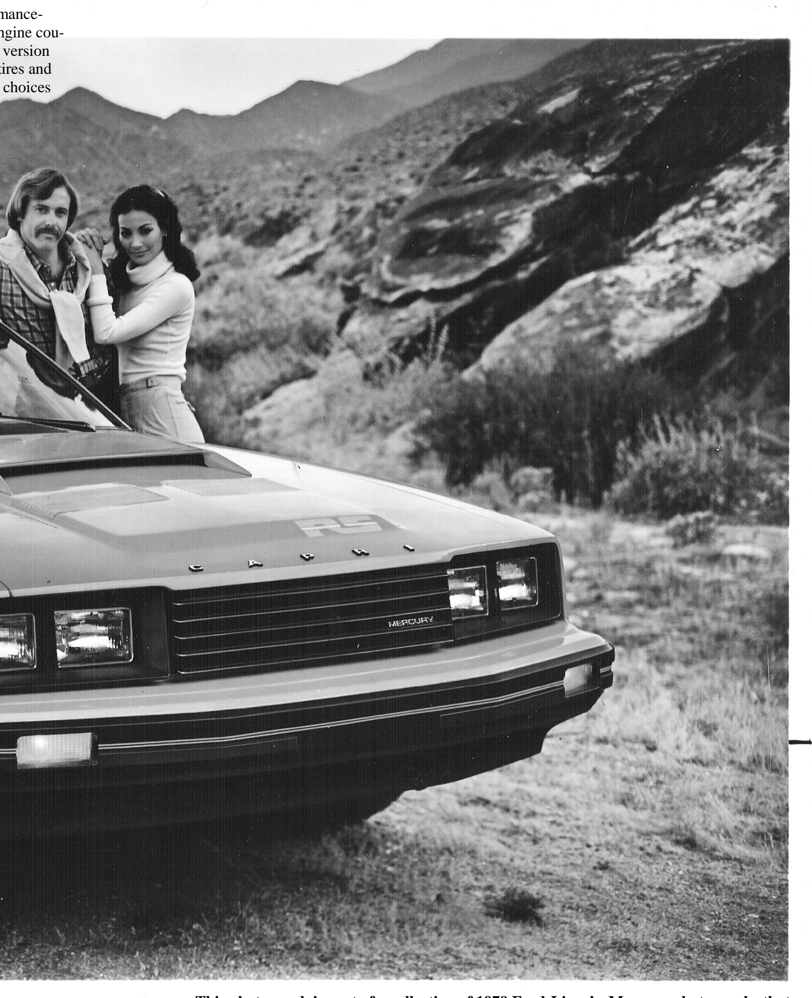
This photograph is part of a collection of 1979 Ford-Lincoln-Mercury photographs that is going online in the next few weeks. More to come in the next issue of Tail Lights!