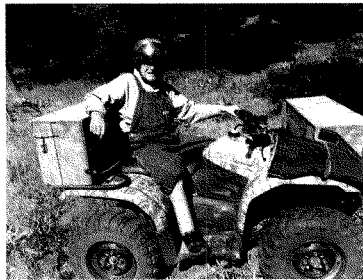
1 Prosthetic Leg Holder Over Right Front Wheel

CORVA and Sierra Access Coalition have developed common sense resolutions that could help correct many of the access issues caused by faulty Forest Service policy: