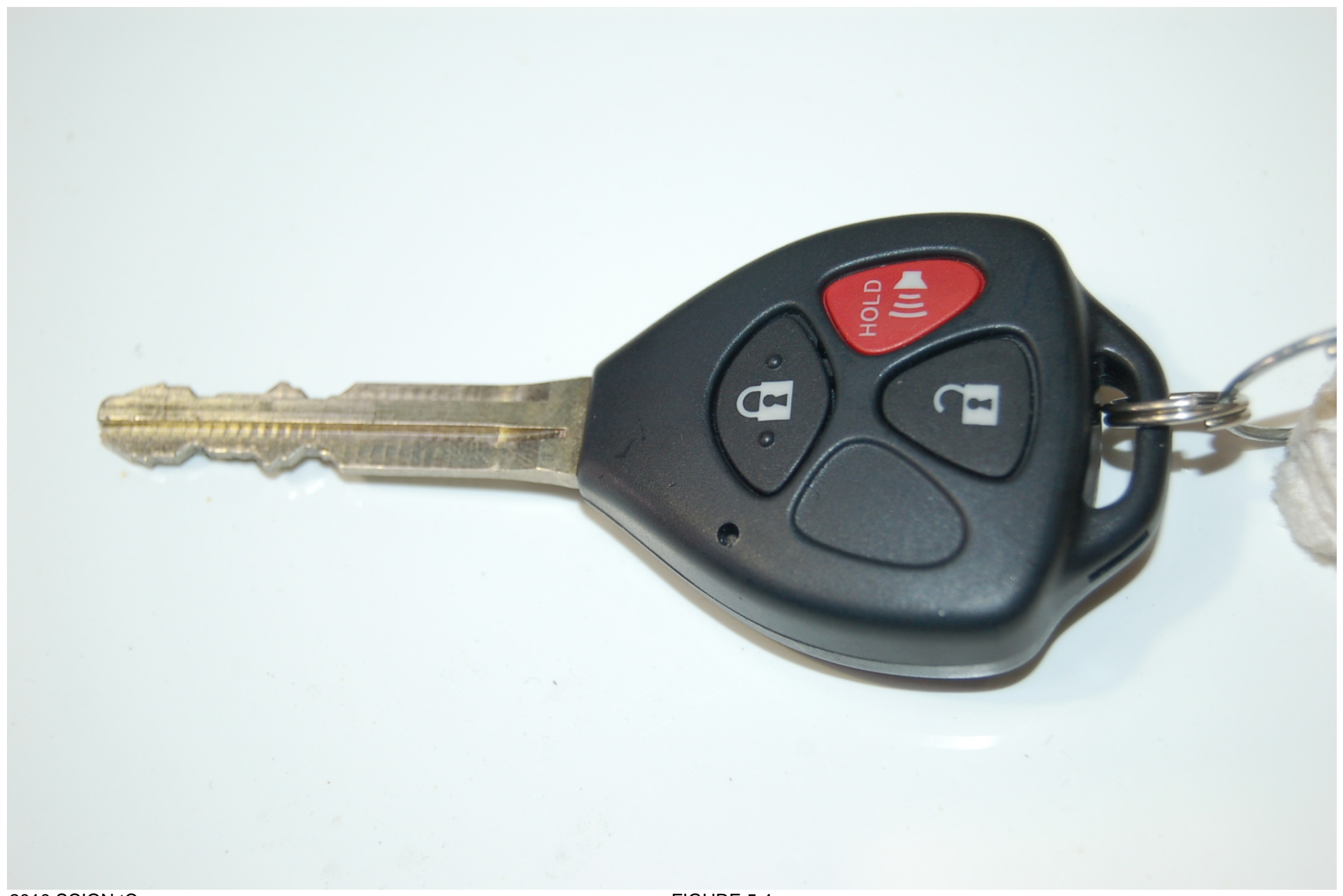
FIGURE 5.4 CLOSE-UP VIEW OF IGNITION KEY