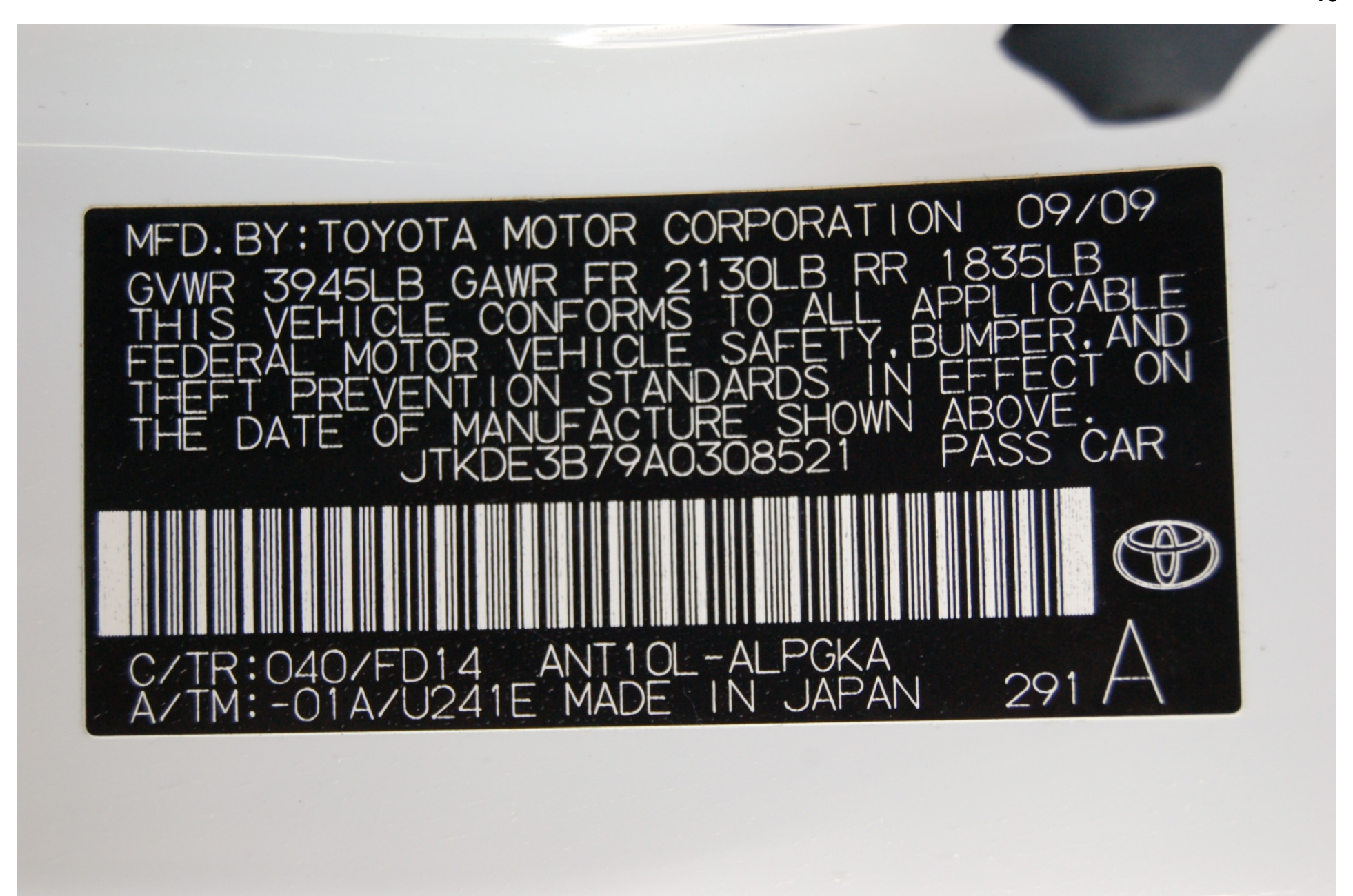
FIGURE 5.2 VEHICLE CERTIFICATION LABEL