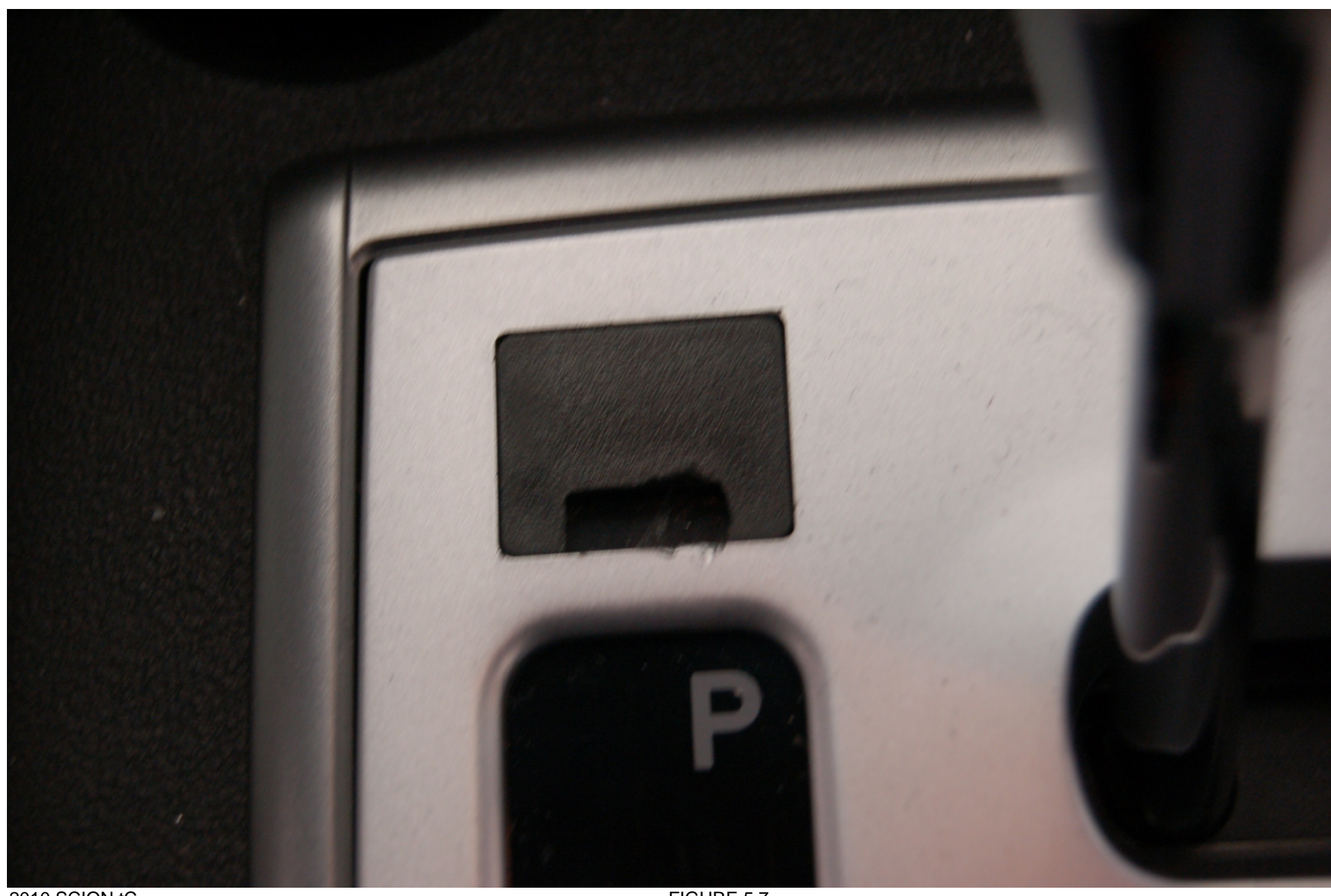
FIGURE 5.7 COVER OVER GEAR SELECTOR RELEASE