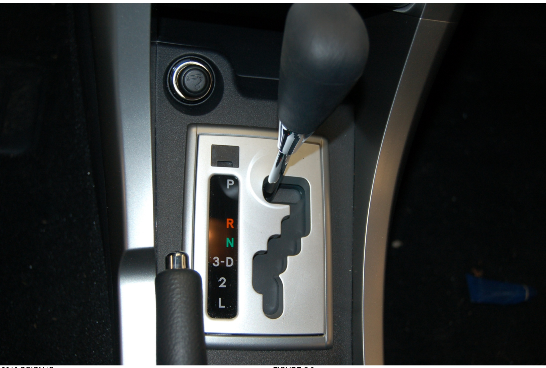
FIGURE 5.6 TRANSMISSION GEAR SELECTION CONTROL