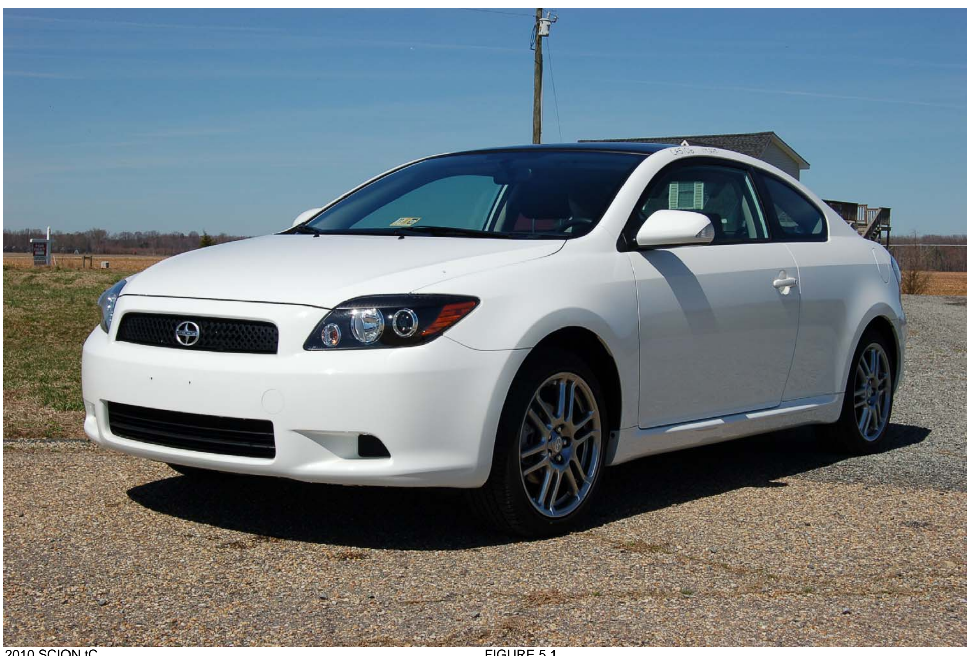
2010 SCION tC NHTSA NO. CA5106 FMVSS NO. 114