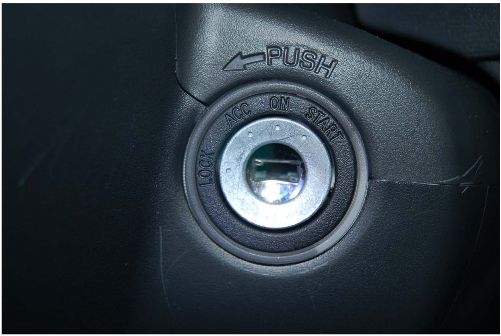
FIGURE 5.5 STARTING SYSTEM CONTROL