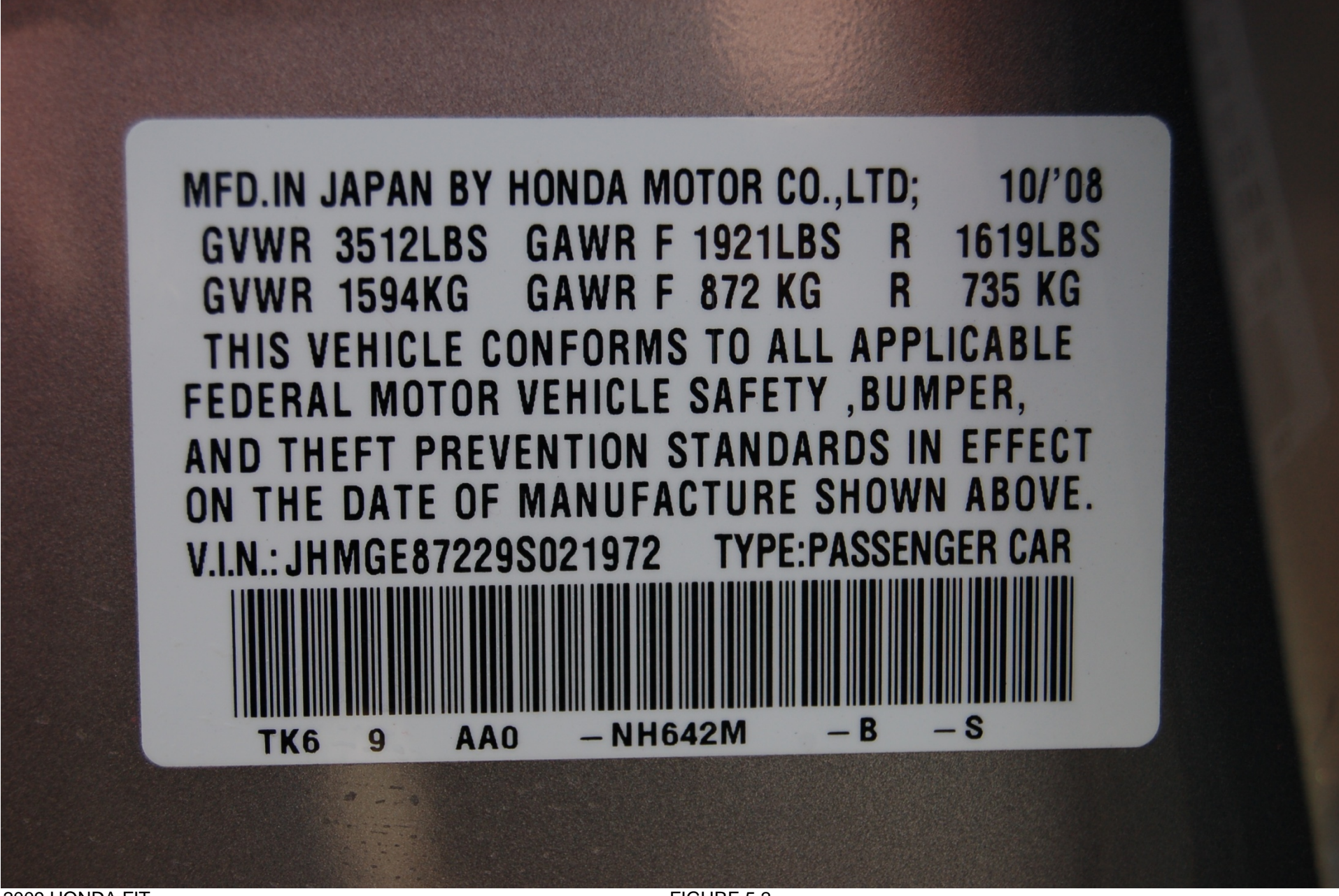
FIGURE 5.2 VEHICLE CERTIFICATION LABEL