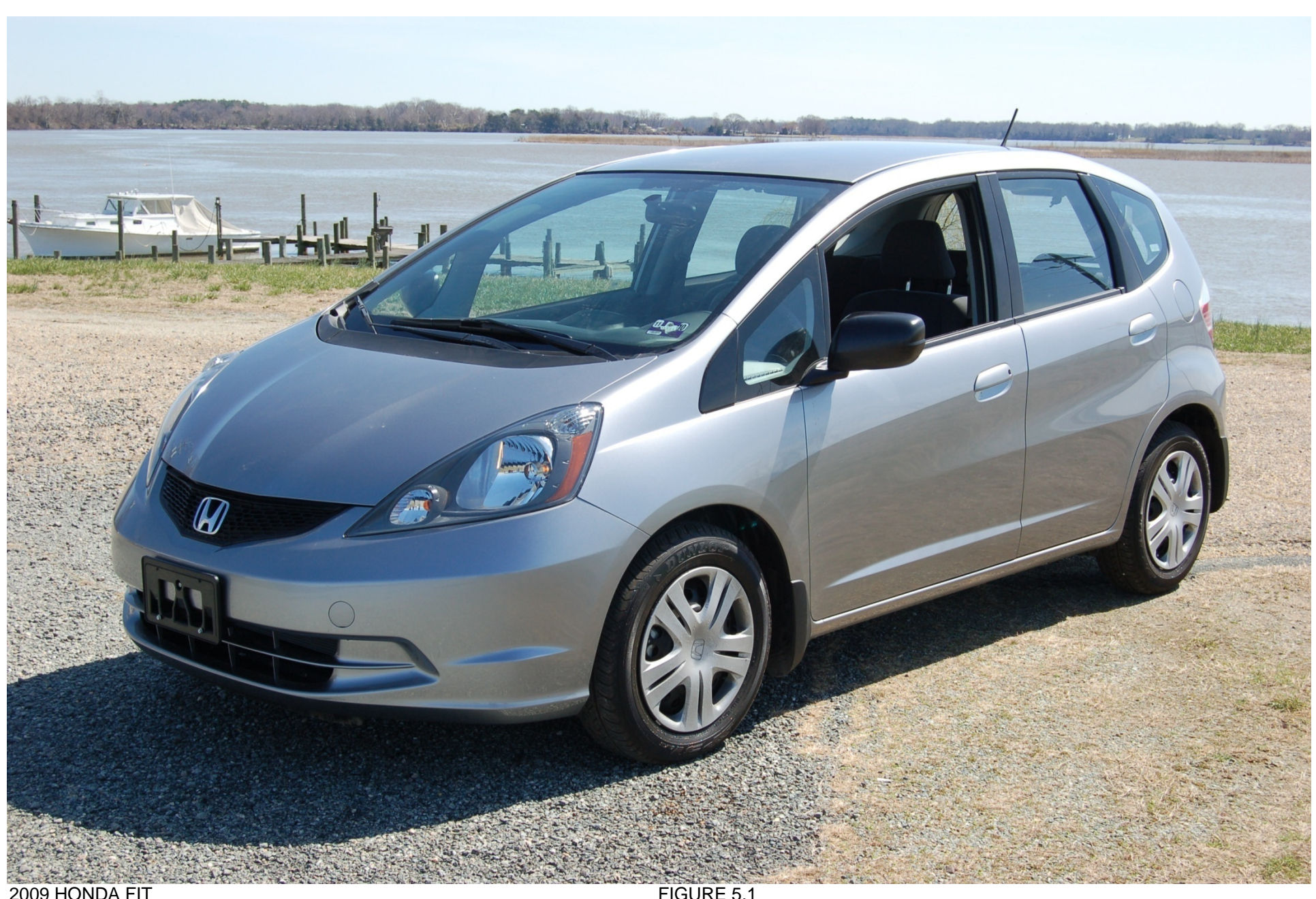
2009 HONDA FIT NHTSA NO. C95302 FMVSS NO. 114