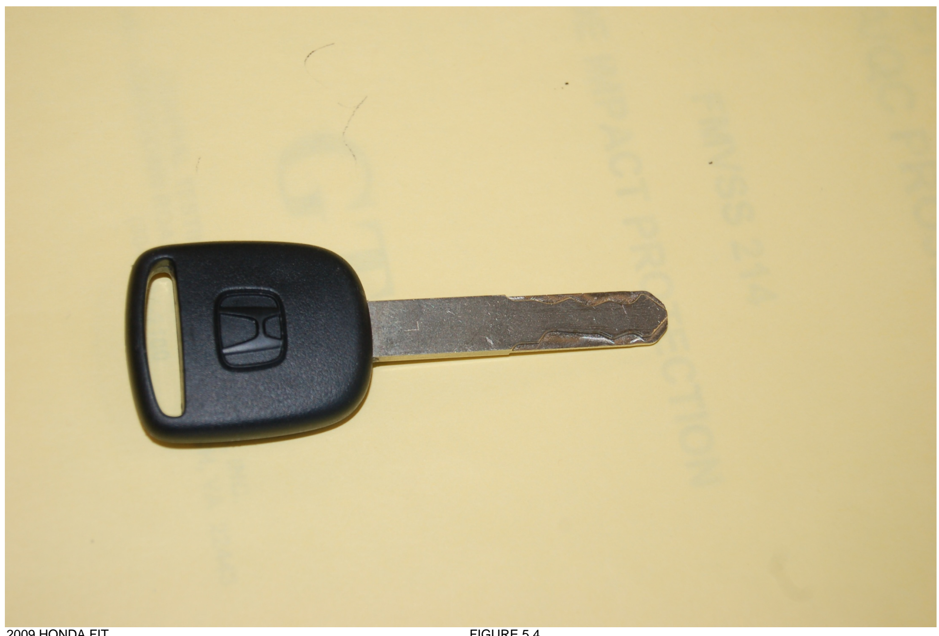
FIGURE 5.4 CLOSE-UP VIEW OF IGNITION KEY