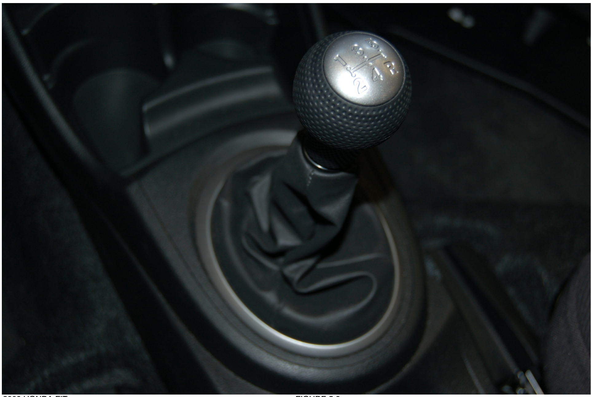
FIGURE 5.6 TRANSMISSION GEAR SELECTION CONTROL