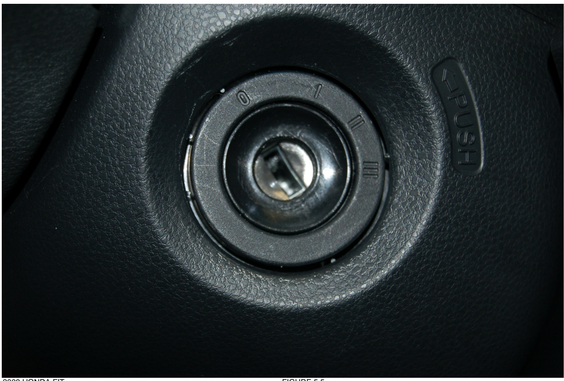
FIGURE 5.5 STARTING SYSTEM CONTROL