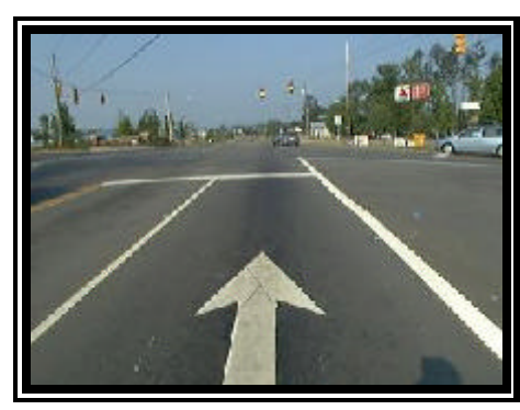
Figure 2. Westbound approach for the 1998 Jeep Cherokee Limited.