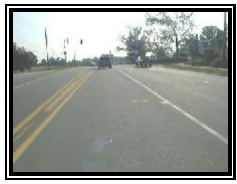
Figure 1. Eastbound approach for the 1998 Toyota Corolla VE.

The 47 year old male driver of the 1998 Jeep Cherokee Limited was operating the vehicle westbound at a (driver reported speed) of 64 km/h (40 mph) when he proceeded straight through the 4-leg intersection ( Figure 2 ) and observed the eastbound Toyota cross his path of travel. Upon recognition of the impending harmful event, the driver steered right and braked in avoidance.