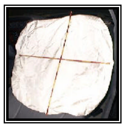
Figure 8. 1998 Jeep Cherokee Limited deployed redesigned passenger air bag.