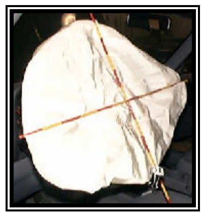
Figure 7. 1998 Jeep Cherokee Limited deployed redesigned driver air bag.

The front right passenger air bag deployed from the right mid-instrument panel area with a single cover flap design hinged at the top aspect. No contact evidence was identified on the air bag or exterior surface of the module cover flap. The cover flap was rectangular in shape and measured 39.0 cm (15.4 in) in width and 16.0 cm (6.3 in) in height. Black vinyl transfers were noted to the upper right quadrant of the air bag face. The NASS researcher measured the passenger air bag at 62.0 cm (24.4 in) square in its deflated state ( Figure 8 ). No vent ports or internal tether straps were reportedly present.