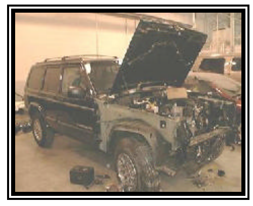
Figure 4. Frontal damage to the 1998 Jeep Cherokee Limited (vehicle under repair).