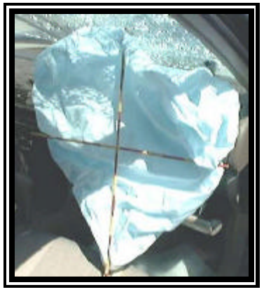
Figure 6. 1998 Toyota Corolla VE deployed redesigned passenger air bag.