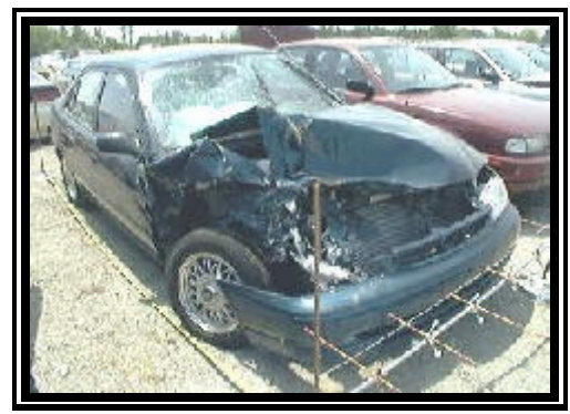
Figure 3. Front right damage to the 1998 Toyota Corolla VE.

The 1998 Toyota Corolla VE sustained moderate frontal damage as a result of the impact with the Jeep Cherokee ( Figure 3 ). The direct contact damage began at the front right bumper corner and extended 60.0 cm (23.6 in) inboard. The impact deformed the entire front end width resulting in a combined direct and induced damage length (Field L) of 141.0 cm (55.5 in). Six crush measurements were documented at the level of the bumper: C1= 6.0 cm (2.4 in), C2= 2.0 cm (0.8 in), C3= 4.0 cm (1.6 in), C4= 6.0 cm (2.4 in), C5= 8.0 cm (3.1 in), C6= 14.0 cm (5.5 in). A secondary crush profile was obtained above the level of the bumper to capture the underride damage resulting in an averaged profile of : C1= 12.0 cm (4.7 in), C2= 16.0 cm (6.3 in), C3= 23.0 cm (9.1 in), C4= 33.0 cm (13.0 in), C5= 39.0 cm (15.4 in), C6= 66.0 cm (26.0 in). The Collision Deformation Classification (CDC) for this impact to the Toyota was 01-FZEW-3 with a principal direction of force of (+)20 degrees. The hood was deformed rearward. The right fender was displaced rearward which restricted the right front wheel/tire (not deflated). The windshield was fractured from (exterior) impact forces and the (interior) front right passenger air bag deployment. Reduction in the left side wheelbase measured 2.0 cm (0.8 in).