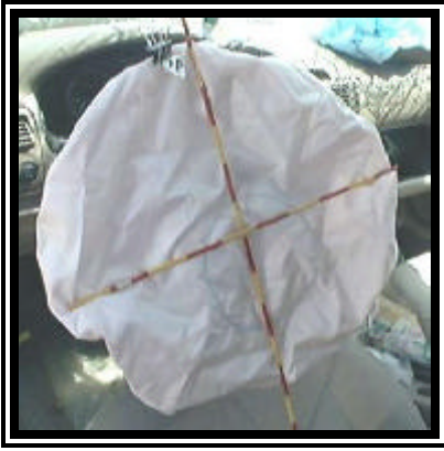
Figure 5. 1998 Toyota Corolla VE deployed redesigned driver air bag.