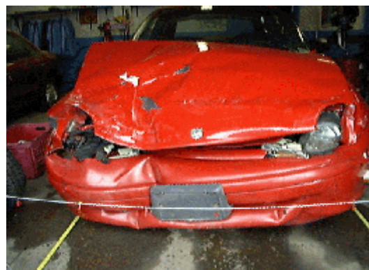
Figure 4 View showing contact damage to the frontal plane of the 1998 Dodge Neon

The SMASH algorithm computed the total delta V of 24.9 km/h (15.5 mph) for the Plymouth and 33.9 km/h (21.0 mph) for the Dodge. The longitudinal delta V component for the Plymouth was 12.5 km/h (7.7