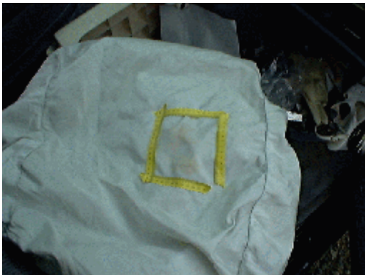
Figure 10 View of the cosmetic transfer on the front right air bag in the Plymouth

An oblong circular prominent peach color cosmetic transfer pattern ( Figures 10 & 11 ) was present on the vertical face of the air bag which was attributed to contact by the front right occupant's facial area. The pattern measured 10.2 cm (4.0") vertically and 8.9 cm(3.5") laterally. It was located 26.7 cm (10.5") below the top of the vertical face of the air bag and 10.2 cm (4.0") left of the right vertical seam edge line.