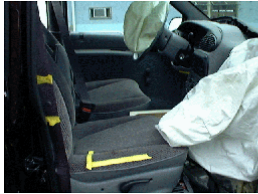
Figure 7 Lateral view of the front right seat in the Plymouth

The next white transfer mark which was 8.9 cm (3.5") long was located on the rear most portion of the door armrest. This was attributed to contact by the occupant's hip area. The lowest white transfer mark on the door surface was located at the bottom portion of the armrest in-line with the seat cushion surface. This mark measured 16.5 cm (6.5") in length and 9.5 cm (3.75") in height and was located 49.5 cm (19.5") rearward from the instrument panel.