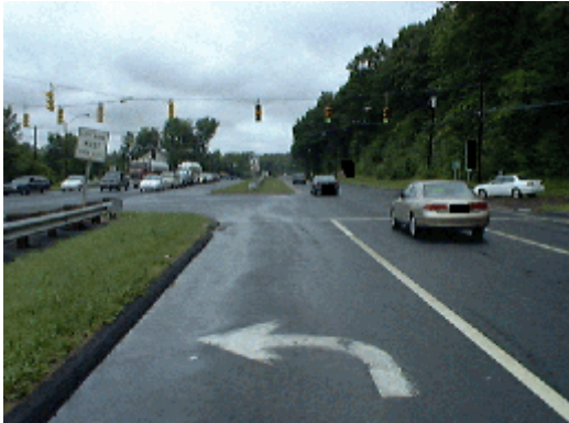
Figure 1 - Trajectory of the Plymouth

The front of the Dodge struck the right side of the Plymouth which resulted in the deployment of the frontal air bag systems in both vehicles. The Dodge then rotated 45 degrees clockwise and came to the final rest position (FRP) within the intersection boundary in the right through lane. The Plymouth rotated counterclockwise and traveled 16.0 m (52.5') in a southeasterly direction and struck a W-beam strong post guardrail system located adjacent to the intersection roadway edge with the front right bumper of the vehicle ( Figure 5 - Scene Schematic ). The vehicle remained in contact with the guardrail at the FRP facing south.