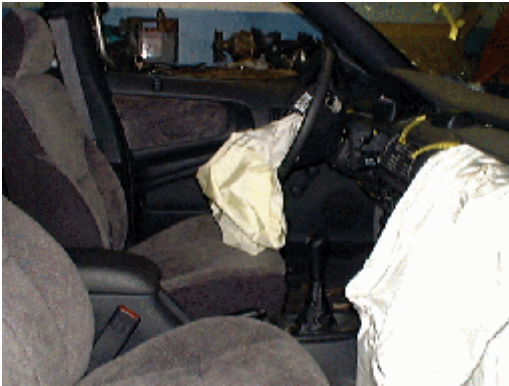
Figure 8 Lateral view of the front seat area in the Dodge

The windshield was cracked along the right side from impact forces. The left bottom area of the windshield was cracked and penetrated by the hood edge. A 17.8 cm (7.0") long swipe mark was noted at mid level on the windshield which was located 21.6 cm (8.5") left of center. This was attributed to contact by the driver's right hand during the impact sequence.