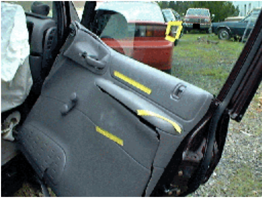
Figure 6 View of occupant contacts to the right front door surface of the Plymouth

There were a series of white transfer marks noted on the interior surface of the right front door which were attribute to contact by the front right occupant during the first impact sequence with the Dodge ( Figure 6 ). The highest mark was located on the right front side glazing which measured 1.3 cm (0.5") in diameter and located 55.9 cm (22.0") rearward from the base of the upper A-pillar and 17.8 cm (7.0") above the belt line. The next highest mark was located 44.5 cm (17.5") rearward from the instrument panel along the belt line and measured 17.1 cm (6.75") in length and 5.1 cm (2.0") in height. This was attributed to contact by the occupant's upper torso.