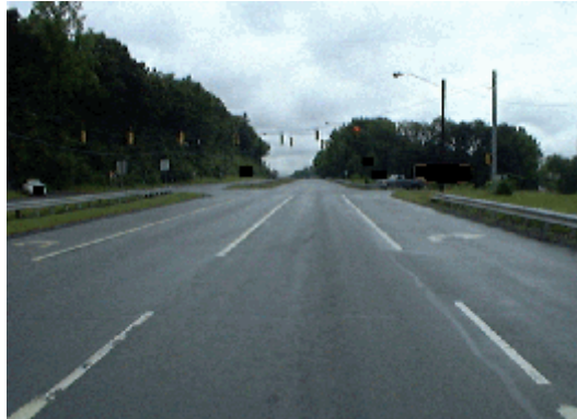
Figure 2 - Trajectory of the Dodge

The impact to the side plane of the Plymouth resulted in a Collision Deformation Classification (CDC) code of 02-RYEW-3 while the related damage to the Dodge was classified 11-FDEW-2 ( Figures 3 & 4 ). The impact with the guardrail resulted in a CDC of 12-FREW-1.