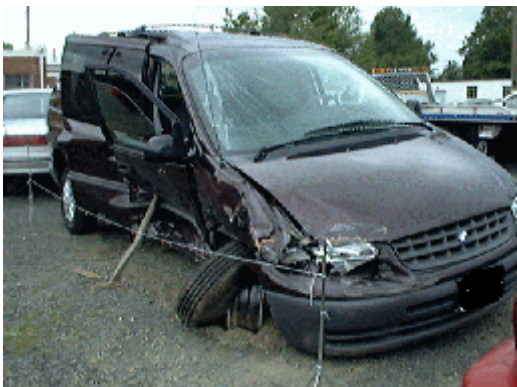
Figure 3 View of the right side impact damage and the right front bumper corner damage to the 1997 Plymouth Voyager

The impact to the side plane of the Plymouth resulted in a Collision Deformation Classification (CDC) code of 02-RYEW-3 while the related damage to the Dodge was classified 11-FDEW-2 ( Figures 3 & 4 ). The impact with the guardrail resulted in a CDC of 12-FREW-1.