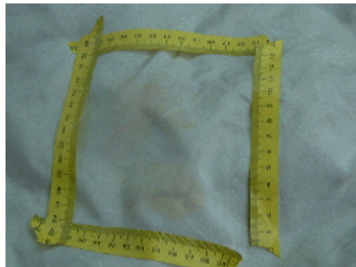
Figure 11 Close-up view of the cosmetic transfer on the front right air bag surface in the Plymouth

The concentration of the cosmetic transfer indicated that the air bag was fully inflated by the time the occupant made contact. This was an important factor in determining the occupant's position at the time of SRS