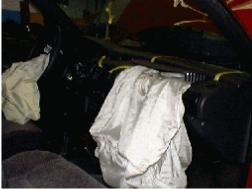
Figure 12 Angular view of the dual front air bags in the Dodge