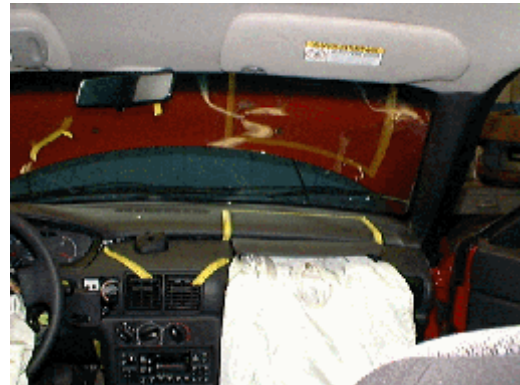
Figure 9 View of the instrument panel of the Dodge

There was a swipe transfer mark on the center instrument panel which began at the vehicle centerline and extended 14.0 cm (5.5") to the left. This was attributed to contact by the front right occupant's left hand during the impact sequence. An adjacent mark to the right of the swipe mark exhibited a 6.4 cm (2.5") striated pattern which began 5.1 cm (2.0") right of the vehicle centerline and extended to the right along the top surface of the instrument panel. This artifact was attributed to contact by the front right air bag as it was compressed by the front right occupant.