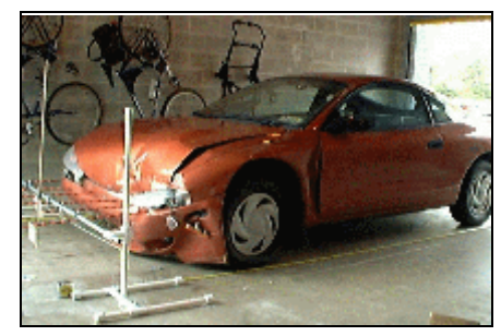
Figure 5 - Left front corner view of Vehicle #1

Driver #1, who was 154.9 cm (61.0") tall and weighed 44.5 km (98 lbs.), was using the lap and shoulder belt at the time of the crash. She sustained a laceration of the lip and soreness of the body. She exited the vehicle and opened the right front door to attend to her son who was not moving. She released his lap belt and heard him moan. She attempted to remove him from the vehicle, but remember someone telling her not to move an injured person.