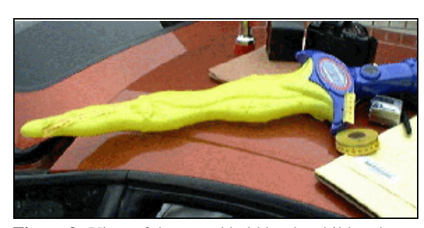
Figure 9 - View of the sword held by the child at the time of the crash

The driver and her six year old son had an active evening which included attendance at the circus and dinner afterwards. She had purchased a 0.9 m (3.0') bright yellow color plastic sword for him at the circus which he was holding while sitting in the right front seat ( refer to Figure 9 ). The child being right handed held the sword