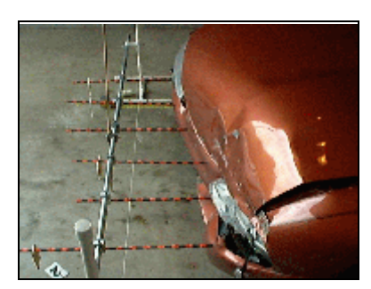
Figure 4 - Lateral view of the frontal plane showing the extent of crush