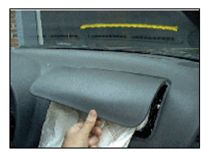
Figure 7 - View of the front right air bag module cover

The longitudinal excursion of the front right air bag measured 73.7 cm (29.0") from the air bag module cover opening ( refer to Figure 8 ). The right front seat was adjusted in the center position which measured 12.7 cm (5.0") rear of the full forward position and 12.1 cm (4.75") forward of the full rear position. The seat back support in this position was located 74.9 cm (29.5") rearward from the air bag module cover measured at a height of 45.7 cm (18.0") above the junction of the seat cushion.