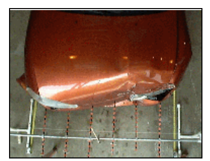
Figure 3 - Overhead view of the frontal damage to Vehicle #1

The frontal plane of Vehicle #1 contacted the stone wall ( refer to Figure 2 ) resulting in a Collision Deformation Classification (CDC) code of 12-FDEW-2 ( refer to Figures 3-5 ). A speed reconstruction using the WinSMASH algorithm indicated Vehicle #1 sustained a delta V of 29.1 km/h (18.1 mph) which was sufficient to actuate the Supplemental Restraint System (SRS). The vehicle came to the final rest position (FRP) against the wall.