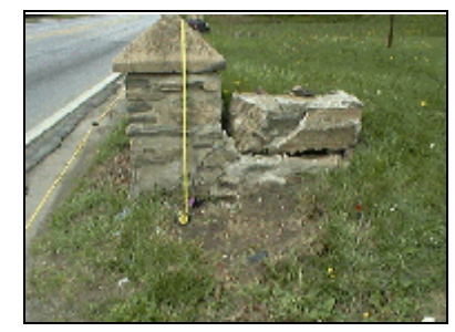
Figure 2- View of the stone wall struck by the front of Vehicle #1

The frontal plane of Vehicle #1 contacted the stone wall ( refer to Figure 2 ) resulting in a Collision Deformation Classification (CDC) code of 12-FDEW-2 ( refer to Figures 3-5 ). A speed reconstruction using the WinSMASH algorithm indicated Vehicle #1 sustained a delta V of 29.1 km/h (18.1 mph) which was sufficient to actuate the Supplemental Restraint System (SRS). The vehicle came to the final rest position (FRP) against the wall.