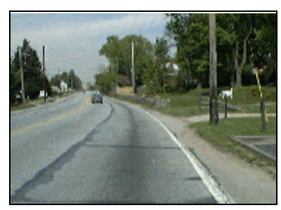
Figure 1 - Trajectory of Vehicle #1 30 m (100 prior to the POI