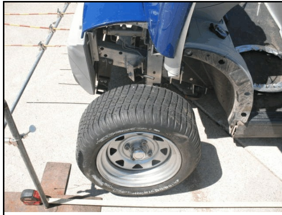
Figure 6: Damaged area, view from left; broken off wheel and tire set in place

signal area. According to the driver, the windshield had a few linear cracks on the left side (the windshield glazing was removed prior to the vehicle inspection). The windshield was the only glazing panel installed in this vehicle. A crush profile was measured but it is not useable because the plastic fender components broke away entirely.