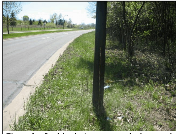
Figure 3: Steel luminaire support pole; hexagonal cross-section, approx. 18 cm (7 inches) diameter

Post-Crash : The driver and the front right passenger remained inside the vehicle at final rest. Both occupants were conscious and able to exit the vehicle without any assistance. Police and emergency medical services responded to the scene. The driver was transported via ground ambulance to a local hospital. The front right passenger accompanied the driver to the hospital but the passenger was not injured. There were no other occupants in the Ford. The Ford was towed from the scene due to disabling damage.