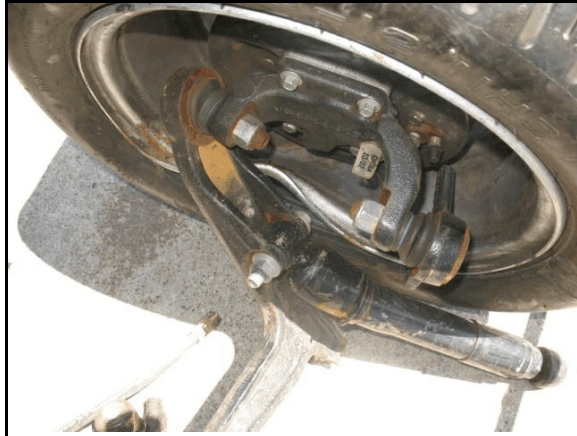
Figure 7: Wheel and suspension/steering components broken off

Damage Classification : The Collision Deformation Classification (CDC) for the Ford is 12FLEE5 (0 degrees). This collision is beyond the scope of the WinSMASH reconstruction program because the Ford is an out-of-scope vehicle. The estimated damage severity is minor.