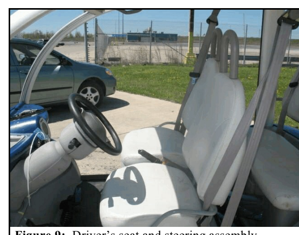
Figure 9: Driver's seat and steering assembly

The Ford's driver (53-year-old female, 152 cm [60 inches], 52 kg [115 pounds]) was restrained by the lap-and-shoulder safety belt. Her seat track was adjusted between the middle and forward most position and her seat back was not adjustable ( Figure 9 ). She was turned to her right, attending to her dog in the back seat.