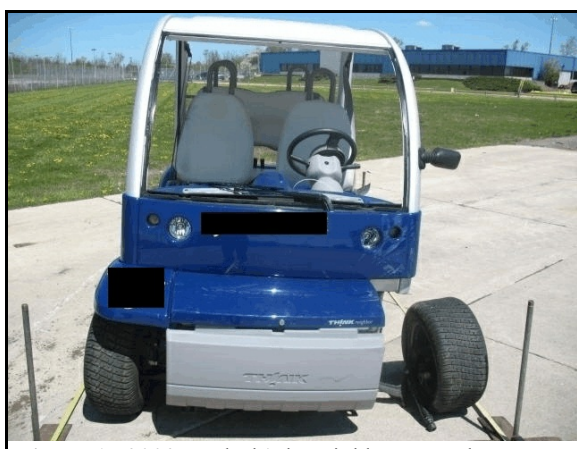
Figure 1: 2002 Ford Th!nk Neighbor; note damage to front left wheel/axle, fender and headlamp area

The focus of this investigation is the crashworthiness of a 2002 Ford Th!nk Neighbor (Figure 1) that was involved in a minor impact non-breakaway pole. The Ford was manufactured as a Low Speed Vehicle (LSV) in compliance with Federal Motor Vehicle Safety Standard (FMVSS) 500. This crash was brought to the National Highway Traffic Safety Administration's attention by sampling activities of the National Automotive Sampling System-Crashworthiness Data System (NASS-CDS). The crash occurred at 1738 hours in April 2010, in Michigan, and was investigated by the applicable municipal police department. A NASS researcher