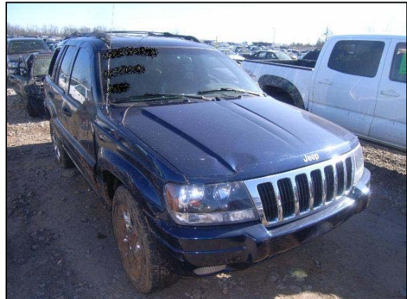
Figure 1: Right front oblique view of the 2000 Jeep Grand Cherokee.

This on-site investigation focused on a high-back booster Child Restraint System (CRS) installed in the second row right seating position of a 2000 Jeep Grand Cherokee ( Figure 1 ). The CRS was occupied by a 5-year-old female who was restrained by the vehicle's manual restraint system. The southbound Jeep departed the right side of the road due to driver distraction. The driver responded to the vehicle's errant trajectory by steering to the left and braking. The sudden steering maneuver resulted in a counterclockwise (CCW) yaw. The vehicle reentered and crossed over the road where it