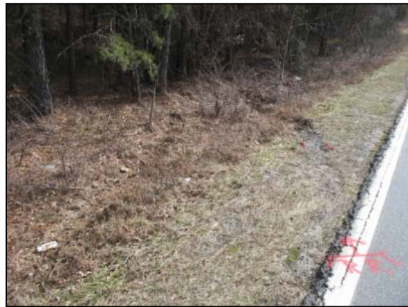
Figure 4: Southeast trajectory view of the area of the rollover and the Jeep's final rest.

The furrowing right tires tripped the Jeep into a right side leading rollover (Event 1). The Jeep rolled one-quarter turn to the right. The top plane of the vehicle then impacted a 20 cm (7.8 in) diameter tree (Event 2). The severity of this impact was minor. The tree was located within the tree line 7.1 m (27.1 ft) east of the roadway. The Jeep came to rest on its right side facing north against the tree. The interrupted rollover distance was 5 m (16.4 ft). Figure 4 is a view of the tree line, the area of the rollover and the Jeep's final rest location.