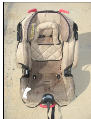
Figure 6: View of the Eddie Bauer Deluxe 3-in-1 CRS.

The CRS utilized in the second row right seating position was a Cosco/Dorel, Eddie Bauer Deluxe 3-in-1 that could be configured as a rear-facing infant CRS, a forward facing CRS, or a high-back booster CRS ( Figure 6 ). The 5-point harness had been removed and the CRS was used as a high-back booster seat at the time of the crash. The infant head stabilizing pillow was still attached to the CRS. The seat was manufactured on December 21, 2004 and was purchased new by the driver. The Model and Serial numbers were 22-755-MAC and AE2B000344, respectively. A stamp on the rear aspect of the shell showed that this seat should not be used after December 2012. The seat was designed with LATCH; however, the LATCH system was not used during this crash. The booster seat application of the CRS