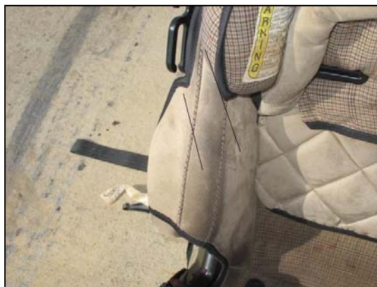
Figure 7: CRS lining wear indicating lower right height adjustment use.

The vehicle’s manual safety belt was used to secure the child and CRS during this crash. The lap portion of the belt was routed across the belt positioning channels located on both sides of the CRS shell. On the upper outboard aspects of the CRS were two shoulder belt height adjustment guides. The shoulder belt was routed through the lower right shoulder belt height adjustment guide. Inspection of the CRS identified a black transfer and wear of the CRS fabric covering that led to the lower height adjustment guide consistent with the safety belt being used in this seating position and using the lower height adjustment guide ( Figure 7 ). The CRS included two adjustable armrests. These armrests were adjusted in the up or stowed position at the time of this crash. The remainder of the CRS shell was inspected and no damage was found.