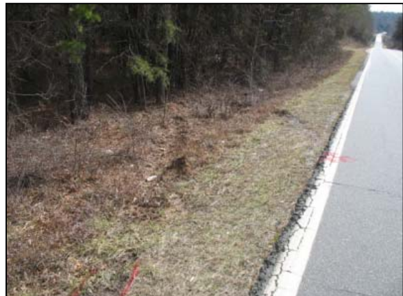
Figure 3: Southbound trajectory view of the Jeep at the left roadside departure.