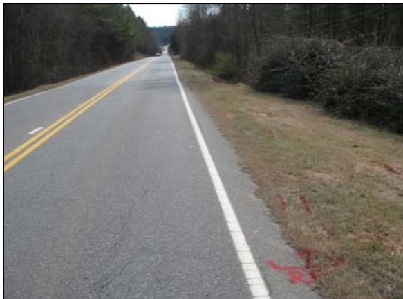
Figure 2: Southbound trajectory view of the Jeep at the right roadside departure.

were rain. The asphalt road surface was wet. The crash occurred at the end of a shallow left curve in a straight section of the road. The road had a negative 3.2 percent grade to the south. In the area of the crash, the road had recently narrowed from three lanes to two. The 3.2 m (10.5 ft) wide travel lanes were separated by double yellow centerlines. Grass roadsides, with a negative 3.2 percent grade, were located outboard of the road edge. The west roadside measured 1.7 m (5.6 ft) in width. To the west beyond the roadside, the terrain transitioned to an embankment with a negative 80 percent grade. The terrain along the Jeep's path of travel was rough and included a ditch that measured 1.1 m (3.6 ft) in wide and 45 cm (17.7 in) deep. The width of the east roadside measured 1.2 m (3.9 ft). Outboard the east roadside there was an embankment with a negative 75 percent grade that ended in a tree line. The tree line was located 7.1 m (27.1 ft) east of the road edge. The posted speed limit was 89 km/h (55 mph). The Jeep's path of travel was defined by tire marks on the grass roadsides. Figures 2 and 3 are southbound trajectory views along the Jeep's path of travel. The Crash Schematic is included as Figure 8 of this report.