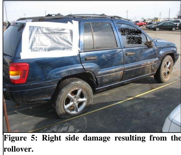
Figure 5: Right side damage resulting from the rollover.

The exterior of the Jeep sustained minor severity damage to the top plane and moderate severity damage to the right side plane as a result of this multiple impact crash. The damage from the rollover (Event 1) was limited to the right side and extended 140 cm (55.1 in) vertically from the door sill to the roof side rail and longitudinally 426 cm (167.7 in) from the right rear bumper corner to the right front bumper corner ( Figure 5 ). The maximum vertical and lateral crush was both located directly above the rear door seam at the junction of the right roof side rail and right C-pillar. The maximum lateral crush measured 3 cm (1.2 in) and the maximum vertical crush was 2 cm (0.8 in). The rear right glazing adjacent to the cargo area was disintegrated by the impact forces. All other side glazing and the windshield and backlight were not damaged in this crash. All of the vehicle doors remained closed during the crash and were operational post-crash. The CDC assigned for the rollover was 00RDAO2.