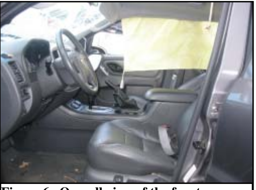
Figure 6. Overall view of the front row.

The interior of the Ford consisted of leather surfaced five-passenger seating with front bucket seats and a rear bench seat with split folding backs. The five seating positions were equipped with adjustable head restraints. The front left and front right head restraints were adjusted to 8 cm (3.3 in) and 3 cm (1 in) above the full-down positions, respectively. The front left seat back was reclined to a measured angle of 30 degrees with the seat track adjusted to the full-rear track position. The front right seat back angle was 50 degrees aft of vertical and