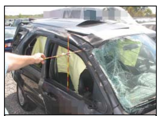
Figure 5. Location of maximum vertical and maximum lateral crush.