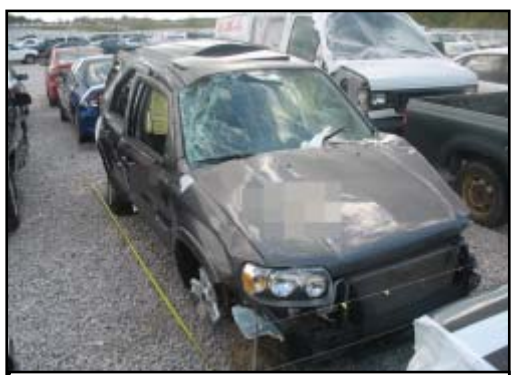
Figure 4. Front right oblique view of the residual damage.

The Ford sustained moderate severity damage from this rollover crash ( Figure 4 ). The damage consisted of scattered abrasions throughout the sides and roof of the vehicle. In addition to the abrasions, the vehicle sustained multiple areas of isolated deformation. The top plane sustained the majority of the deformation with 8 cm (3.1 in) of maximum vertical crush and 5 cm (2 in) of maximum lateral crush occurring at the right A-pillar ( Figure 5 ). In addition to the crush, the windshield was fractured and the right front, rear door, and backlight glazing were disintegrated. The front left, front right, and the rear right alloy wheels were fractured near the base of the spokes. The rear left wheel was not damaged. The CDC assigned to this impact was 00-TDDO-3. The four doors remained closed during the crash. Post-crash, the left side, tailgate, and the rear right doors were operational. The front right door was jammed in the closed position.