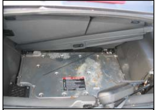
Figure 7. Hybrid battery, located in the floor of the cargo area.

The 2006 Ford Escape Hybrid was equipped with a hybrid battery system used to drive an electric motor that assists the gasoline engine. This system improves fuel efficiency while the gasoline engine is in use, or to provide power for vehicle movement at lower speeds without the use of the gasoline engine. The hybrid battery was manufactured by Sanyo and consisted of 250 cells in 50 modules. It has a nominal voltage of 300-V with a capacity of 5.5-Ah using nickel-metal hydride cells and a potassium hydroxide electrolyte. The hybrid battery was located centered under the cargo