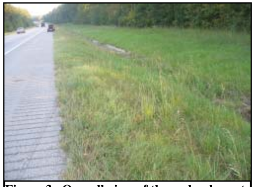
Figure 3. Overall view of the embankment where the Ford rolled over.

The Ford entered the grass embankment area where the left tires rolled under the alloy wheels exposing the rim beads to the soft terrain. The rim beads gouged the ground which tripped the vehicle into a left side leading rollover event. The Ford rolled down the embankment and partially climbed the back slope of the embankment. The vehicle rolled over a total of four-quarter turns coming to rest on its wheels facing a westerly direction. The rollover sensor actuated the dual pretensioners and deployed both IC air bags. Figure 3 is an overall view of the crash site.