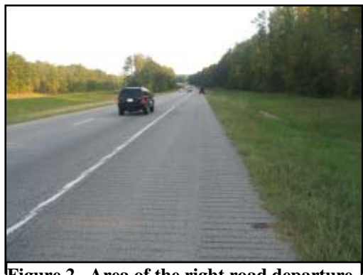
Figure 2. Area of the right road departure.

The 19-year-old male driver was operating the 2006 Ford Escape southbound on the inboard lane with the cruise control set to 121 km/h (75 mph). The driver stated to the SCI investigator that while traveling southbound, he observed a large section of tire debris on the inboard lane. He applied a left steering input to avoid the debris and entered the grass median. The driver subsequently applied a right steering input in an attempt to regain the travel lane. The Ford reentered the roadway and initiated a clockwise yaw as it traversed the travel lanes and departed the west roadside ( Figure 2 ). The driver