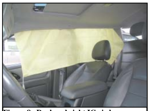
Figure 8. Deployed right IC air bag.

The Ford was equipped with seat back-mounted side impact air bags and roof rail-mounted IC air bags with rollover sensing. The seat back-mounted side impact air bags did not deploy during the crash. Both IC air bags deployed during the rollover crash sequence ( Figure 8 ). The curtain air bags were 150 cm (59 in) in length and 43 cm (17 in) in height. The IC did not provide full coverage across the side glazing of the Ford. A triangular shaped void that measured 33 cm (13 in) in height and 36 cm (14