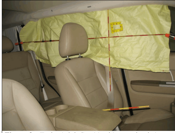
Figure 9: Entire left inflatable side curtain air bag