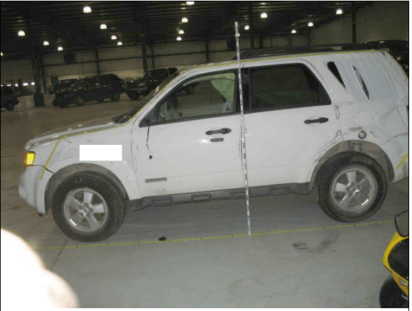
Figure 5: Left side damage from the rollover

the vehicle's track width and height of its center of gravity. The result of the calculation is a measure of a vehicle's resistence to rollover. A higher SSF indicates a more stable vehicle. The