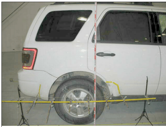
Figure 4: Right side impact area outlined in yellow tape