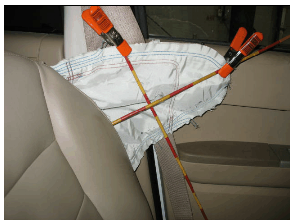
Figure 8: Driver's seat back-mounted side impact air