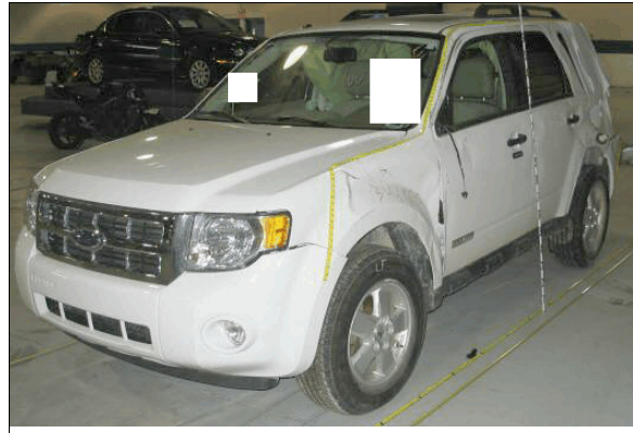
Figure 1: The damaged 2008 Ford Escape XLT

The focus of this on-site investigation was the on-roadway rollover of a 2008 Ford Escape XLT, which occurred following a right side plane impact by a 1995 Toyota Camry. This crash was brought to the National Highway Traffic Safety Administration's attention on October 17, 2008 by the sampling activities of the National Automotive Sampling System. This investigation was assigned on October 27, 2008. This crash involved a 2008 Ford Escape XLT ( Figure 1 ) and a 1995 Toyota Camry LE. The crash occurred in September, 2008 at 1115 hours, in Michigan and was investigated by the local police department. This