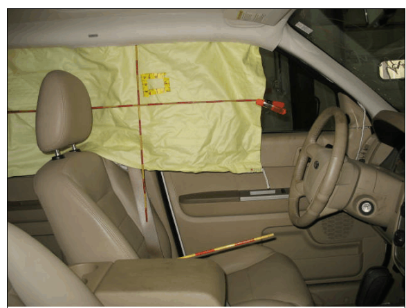
Figure 6: Yellow tape shows location of a scuff mark on the left side curtain air bag from driver contact

Vehicle Interior: The inspection of the Ford's interior revealed scuff marks on the inflatable left side curtain air bag (Figure 6) due to loading by the driver's face. A scuff mark was also present on the back of the driver's seat belt buckle, probably due to loading by the driver's right hip. A scuff mark was located on the glove box door (Figure 7), due to loading by the front right passenger's right knee. There was no deformation on the steering wheel rim or steering column, and the vehicle sustained no passenger compartment intrusions. The right rear door and tailgate were jammed shut while the remaining doors remained closed and operational. The windshield glazing was in place and cracked due to impact forces and