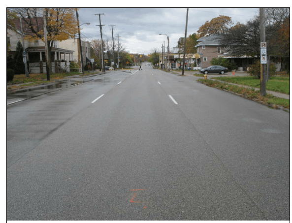
Figure 3: The Toyota's approach to intersection and impact area; arrow shows the approach of the Ford

The Ford's rollover mitigation features consisted of ESC and inflatable side curtain air bags with rollover sensing. The NHTSA has given the vehicle a three star rollover rating on a five star scale and a Static Stability Factor (SSF) of 1.13<sup>1</sup>. A three star rating indicates that the vehicle has a 20%-30% chance of a rollover when involved in a single vehicle crash. The specific chance of rollover for this vehicle model was given as 23%. The SSF is a calculation based on