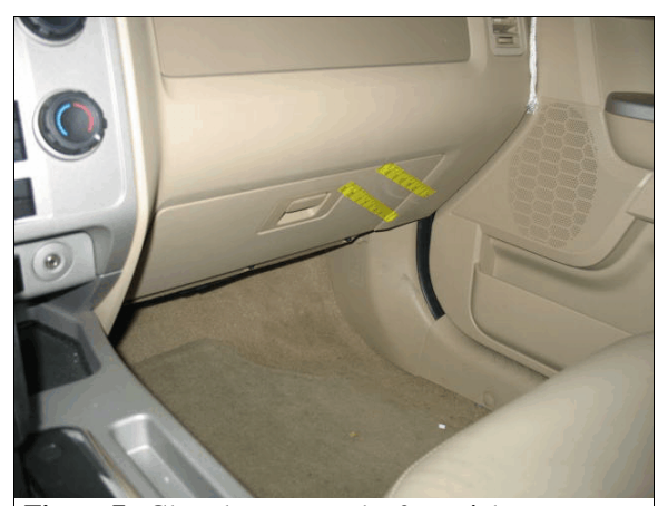
Figure 7: Glove box contact by front right passenger

The front right seat back-mounted side impact air bag and right inflatable side curtain air bag were the same dimensions as mentioned above. There was no damage to either air bag and no discernable evidence of occupant contact.