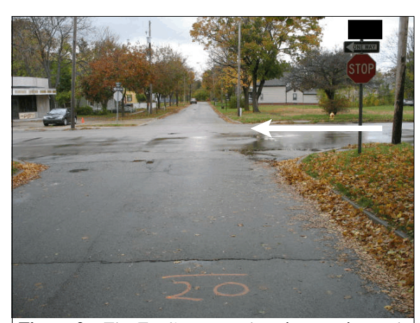
Figure 2: The Ford's approach to intersection and the area of impact; arrow shows the approach of the Toyota

Pre-Crash: The Ford was occupied by a restrained 25-year-old female driver and a restrained 47-year-old female front right passenger. The driver was traveling northwest approaching the 4-leg intersection ( Figure 2 ). The driver stated during the SCI interview that she was intending to continue northwest. She saw the stop sign but did not stop and continued into the intersection. She took no actions to avoid the