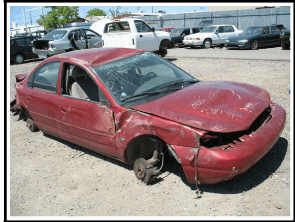
Figure 1. Subject vehicle, 1999 Ford Contour LX

This on-site investigation focused on two occupants who were restrained in child safety seats and the rollover dynamics of a 1999 Ford Contour (Figure 1). The vehicle was being driven by a restrained 29-year-old female. The second row was occupied by a 3-year-old female and a 5-year-old female who were seated in forward facing child safety seats. The vehicle drifted off the left roadside; alerted, the driver steered right, then left, inducing a counterclockwise yaw. The vehicle partially departed the left roadside and climbed an embankment. As the vehicle rotated along the embankment, it overturned two quarter turns.