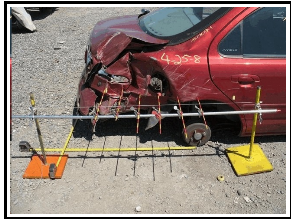
Figure 3. Right side damage, showing stands

impact with the embankment ( Figure 3 ). The direct damage began 24 cm (9.5 in) forward of the rear axle and extended 107 cm (42.1 in) rearward to the rear bumper corner. Six crush measurements were taken at mid-door level as follows: C1 = 10 cm (3.9 in), C2 = 14 cm (5.5 in), C3 = 7 cm (2.8 in), C4 = 7 cm (2.8 in), C5 = 4 cm (1.6 in), C6 = 0 cm. Maximum crush at mid-door level was located at C2 and measured 14 cm (5.5 in). The CDC for the side impact was 04RBEW2.