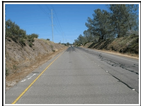
Figure 2. Crash site, eastbound approach

The crash site consisted of a physically divided east/west roadway. The roadway was configured with two eastbound travel lanes that were separated from two westbound lanes by a wide median that ascended above grade. The control loss occurred in the inboard eastbound lane (Figure 2). The roadway was of asphalt composition and was bordered on either side by narrow paved shoulders. Beyond the paved shoulders were ditches and lateral to the ditches were raised embankments. The right shoulder measured 1.3 m (4.4 ft) in width, and the first lane from the right measured 3.81 m (12.5 ft) in width. The second lane from the right measured 3.7 m (12.0 ft) in width, and the right shoulder measured 0.6 m (1.9 ft) in width. The travel lanes were