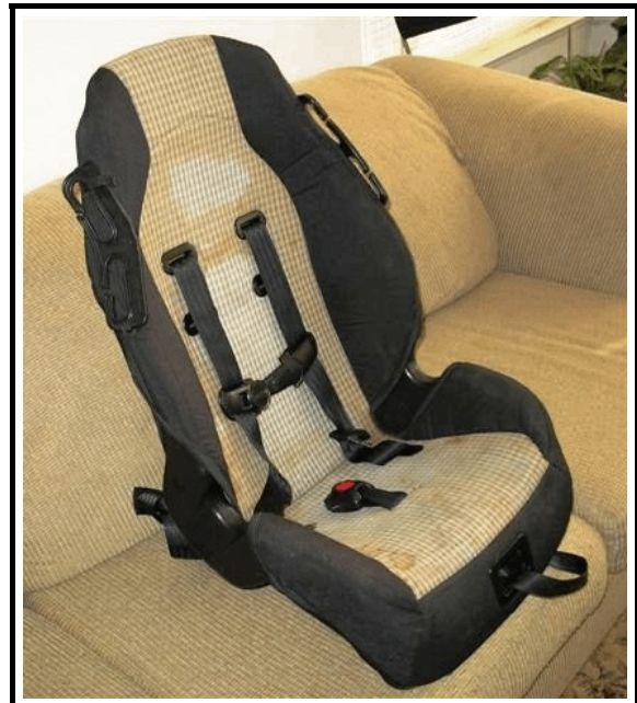
Figure 5. Cosco/Dorel High Back Booster CSS

The second row left seat was occupied by a 3-year-old female seated in a Cosco/Dorel High Back Booster CSS ( Figure 5 ). The model number was 22-208-MTN and the date of manufacture was 10/27/2005. The CSS was used forward facing and was configured with a 5-point harness and retainer clip. The harness straps were routed through the top set of slots and the retainer clip was fastened. The driver of the subject vehicle was the child's mother and she installed the CSS in the vehicle. The CSS was placed on the bench seat cushion and was secured with the 3-point manual safety belt. The safety belt was routed through the back of the CSS frame through the front facing slots, and she stated that the safety belt retractor was in the ALR mode.