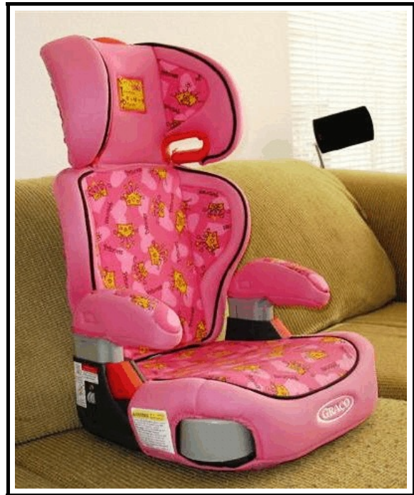
Figure 6. Graco TurboBooster CSS

The second row left seat was occupied by a 5-year-old female seated in a Graco TurboBooster CSS ( Figure 6 ). The model number was 8E10VIP and the date of manufacture was 11/28/2007. The CSS was used in a forward facing orientation. It was configured without a harness and was designed to be used only as a belt positioning booster seat. The CSS was equipped with adjustable armrests and retractable cup holders. Shoulder belt positioning slots flanked each side of the headrest. The child's mother assisted the child with the safety belt restraint. The retractor was in the ALR mode. The driver stated during the interview that she did not route the shoulder belt webbing through the belt positioning device. Instead, the shoulder belt webbing was placed below the positioning device in an opening between the CSS back and headrest. The safety belt positioned in this manner located the shoulder belt over the child's shoulder, and the shoulder belt was held in place by belt retractor tension.