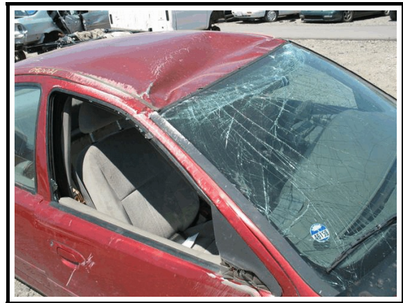
Figure 4. Roof damage sustained during rollover

The vehicle sustained moderate damage during the rollover event ( Figure 4 ). The windshield was cracked and in place. The first row right window glazing disintegrated. The doors all remained closed and operational. The direct damage to the top plane began on the leading edge of the hood, extended rearward 237 cm (93.3 in), and ended on the roof near the B-pillar. The direct damage to the roof was distributed laterally 110 cm (43.3 in) from roof side rail to roof side rail. The left and right A-pillars sustained direct damage. Direct damage was distributed down the vehicle's entire left side and measured 442 cm (174.0 in) in length. The maximum lateral crush was located at the right A-pillar and measured 5 cm (2.0 in). The maximum vertical crush was located at the right A-pillar and measured 7 cm (2.8 in). The CDC for the rollover event was 00TYDO3.