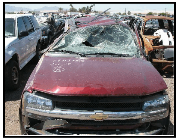
Figure 3 . Overview of roof crush as seen from the front of the vehicle

All the doors were jammed shut. The left front door was pried open during the vehicle inspection. The side glazing was disintegrated for both sides of the vehicle with the exception of the rear most left window which had popped out. The left rear tire was torn from the rim.