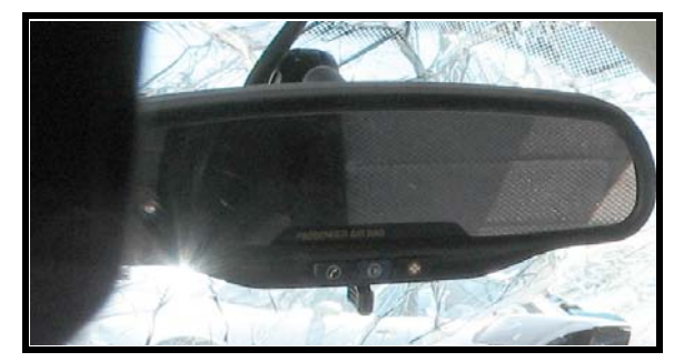
Figure 8 . Passenger Air Bag On/Off indicator on rearview mirror

The 2005 Chevrolet was equipped with advanced occupant protection systems including multi-stage Certified Advanced 208-Compliant driver and front right passenger air bags. The multi-stage air bags were certified by the manufacturer to meet the advanced air bag requirements of Federal Motor Vehicle Safety Standard (FMVSS) No. 208. The driver's air bag was mounted in the center of the steering wheel hub and front right passenger air bag was a mid instrument mount. The vehicle was equipped with a front right Passenger Sensing System (PSS). The PSS works with sensors located