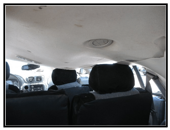
Figure 5. Overview of right side intrusion