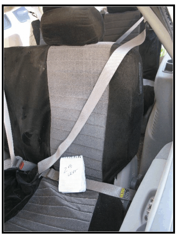
Figure 11 . Second row left occupant seated position

The 8-year-old female second row middle occupant was seated in an unknown posture and was restrained by the 3-point manual lap and shoulder belt ( Figure 12 ). As the Trailblazer drifted off the left side of the roadway, the driver woke up. He steered the vehicle to the right and the vehicle began a clockwise rotation. The second row middle occupant pitched to the left due to the rotation. As the vehicle returned to the roadway, the vehicle tripped and began a left side leading rollover. The second row middle occupant generally stayed in place during the rollover sequence. There were no reported injuries for this occupant.