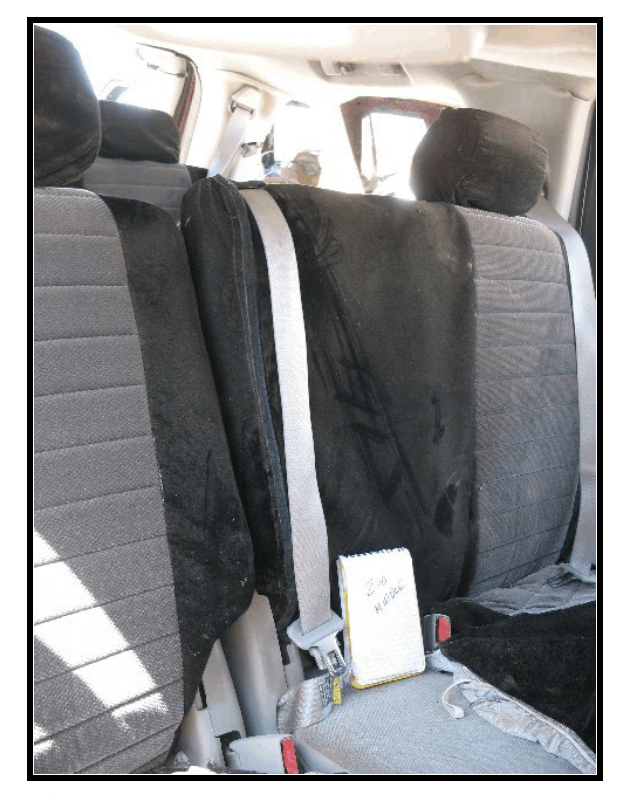
Figure 12 . Second row middle occupant seated position