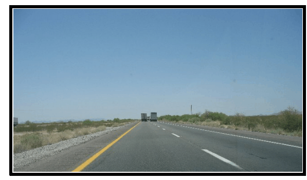
Figure 2. Path of travel (west)

The crash occurred at 1246 hours in January 2007. This single vehicle crash occurred on an east/west divided interstate highway ( Figure 2 ). The westbound and eastbound lanes were divided by a depressed median. The westbound lanes were separated by a dashed white line. The left lane edge was bordered by a solid yellow line, followed by an asphalt shoulder with a rumble strip. The right lane edge was bordered by a solid white line, followed by an asphalt shoulder with a rumble strip. The interstate was level at this location. The asphalt