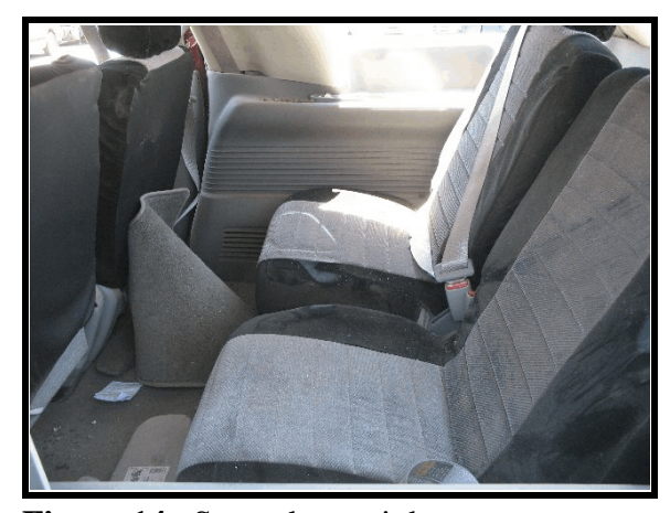
Figure 14 . Second row right occupant seated position

The 15-year-old male third row left seat occupant was seated in an upright posture and was restrained by the 3-point manual lap and shoulder belt ( Figure 14 ). The driver had fallen asleep. As the Trailblazer drifted off the left side of the roadway, the driver woke up. He steered the vehicle to the right and the vehicle began a clockwise rotation. The third row left occupant pitched to the left due to the rotation. As the vehicle returned to the roadway, the vehicle tripped and began a left side leading rollover. The third row left occupant generally stayed in place during the rollover sequence. He complained of pain to his left shoulder. He was transported to a local hospital for evaluation.