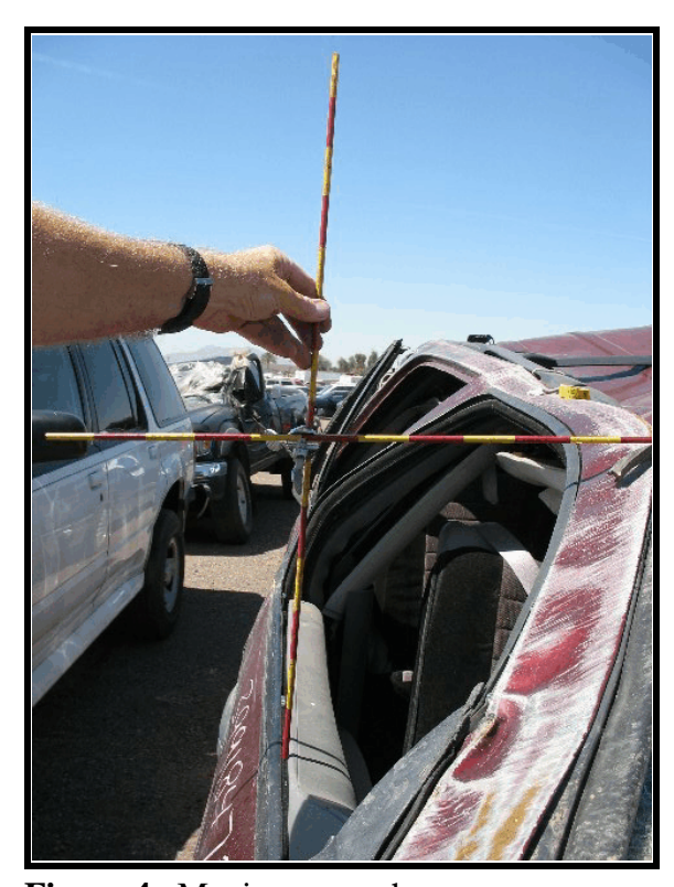
Figure 4. Maximum crush