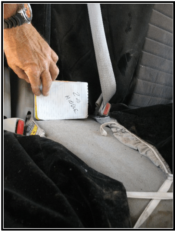
Figure 7 . Second row middle safety belt, cut by EMS

The Chevrolet Trailblazer was equipped with LATCH (Lower Anchors and Tethers for Children) system anchors in the second row seats. The LATCH system provides two lower anchors and one top tether anchor to be used to secure a child seat.