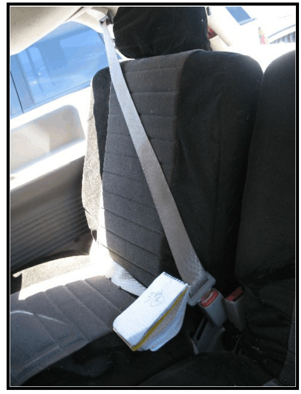
Figure 15 . Third row right occupant seated position

The 5-year-old male third row right seat occupant was seated in an upright posture and was restrained by the 3-point manual lap and shoulder belt ( Figure 15 ). The driver had fallen asleep. As the Trailblazer drifted off the left side of the roadway, the driver woke up. He steered the vehicle to the right and the vehicle began a clockwise rotation. The third row right occupant pitched to the left due to the rotation. As the vehicle returned to the roadway, the vehicle tripped and began a left side leading rollover. The third row right occupant generally stayed in place during the rollover sequence. This occupant likely contacted the intruding right side roof/roof rail. He sustained a skull fracture, as well as miscellaneous lacerations, contusions and abrasions. He was evaluated at the scene. He was then transported by air ambulance to an area trauma center where he was arrived with a GCS of 15. He was hospitalized one day.