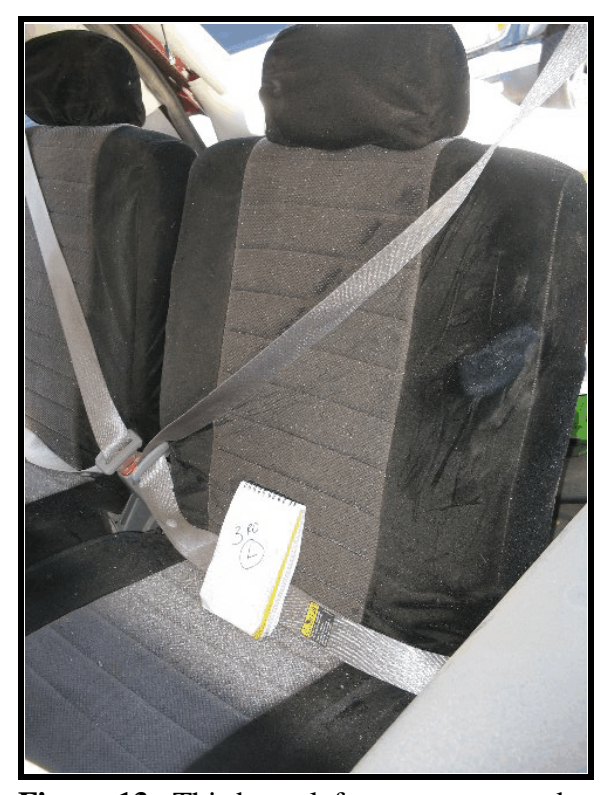
Figure 13 . Third row left occupant seated position