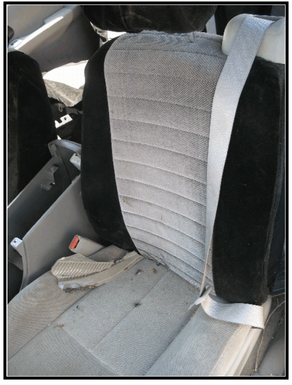
Figure 9. Driver's seated position

The 44-year-old female front right seat occupant was seated in an unknown posture and was restrained by the 3-point manual lap and shoulder belt (Figure 10). The seat was positioned to the forward most track position. The driver had fallen asleep. As the Trailblazer drifted off the left side of the roadway, the driver woke up. He steered the vehicle to the right and the vehicle began a clockwise rotation. The right front occupant pitched to the left due to the rotation. As the vehicle returned to the roadway, the vehicle tripped and began a left side leading rollover. The right front occupant generally stayed in place during the rollover sequence. It appears that this occupant's head contacted the intruding right side roof. She sustained a scalp laceration and multiple