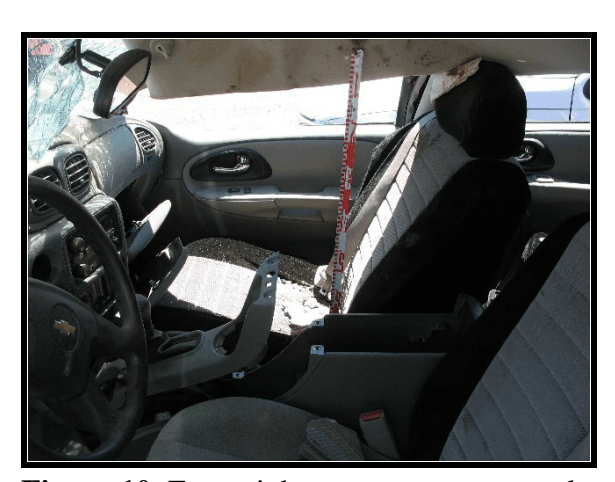
Figure 10 . Front right seat occupant seated position

lacerations to the right elbow. She was able to exit the vehicle under her own power. She was evaluated at the scene. She was then transported by air ambulance to an area trauma center where she was admitted and hospitalized for one day.