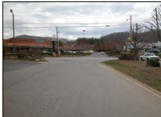
Figure 3. Jeep's eastbound pre-crash travel.