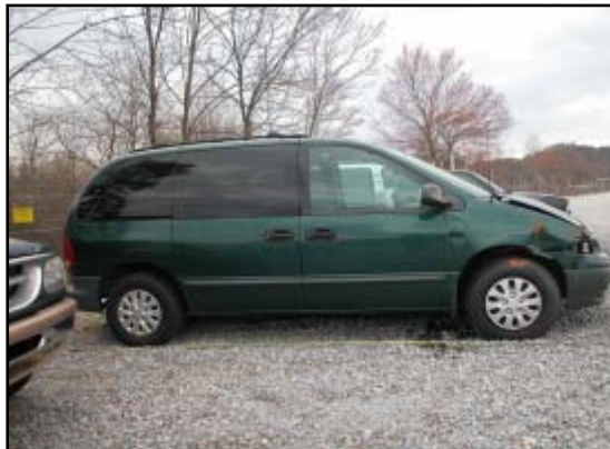
Figure 1. Subject vehicle 1996 Plymouth Voyager.

The Plymouth was involved in a minor severity intersection crash with a 2004 Jeep Grand Cherokee. The driver of the Plymouth was operating the vehicle southbound on a local roadway approaching the intersection. The driver of the Jeep was turning left across the path of the Plymouth at the intersection. The driver of the Plymouth applied braking force in an attempt to avoid the impact. This pre-impact braking displaced the 6-year-old male right front occupant forward in the path of the deploying air bag. The mid-mount front right air bag expanded and struck the 6-year-old male front right occupant's head, which resulted in a 5 mm left subdural hematoma of the frontal temporal and parietal region with significant left to right shift, massive cerebral edema/cisterns obliterated, multiple abrasions to the left side of the face, nose abrasion, and a left eyelid contusion. The 6-year-old male was transported by ambulance to a local hospital where expired one day post-crash. The driver of the Plymouth sustained minor severity injuries and was transported by ambulance to a local hospital where she was treated and released. The 2-week-old male infant and the 4-year-old male were not injured; however, they were transported by ambulance to a local hospital for observation.