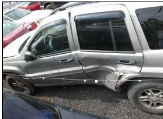
Figure 9. Impact damage to the left side 2004 Jeep Grand Cherokee.

The Jeep sustained moderate severity left damage as result of the impact with the Plymouth ( Figure 9 ). This impact resulted in lateral deformation the left side doors, fender, and quarter panel. The maximum crush measured 29 cm (11.3”) and was located 75 cm (29.5”) forward of the left rear axle on the left rear door. The direct contact damage began 39 cm (15.3”) forward of the left axle and extended 149 cm (58.5”) forward onto the left front door. The lateral deformation was documented at the mid-door level using a combined direct and induced damage width of 196 cm (77.3”) and were as follows: C1 = 1 cm (0.4”), C2 = 22 cm (8.7”), C3 = 22 cm (8.7”), C4 = 15 cm (5.9”), C5 = 7 cm (2.8”), C6 = 0 cm. The CDC for this impact was 10-LPEW-2.