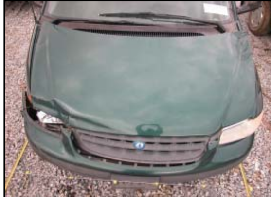
Figure 6. Overhead view of the bumper crush to the Voyager.

The 1996 Plymouth Voyager sustained minor severity damage as result of the crash with the Jeep ( Figure 6 ). The damage was contained to the front right area of the vehicle, involving the hood, bumper fascia and support beam, headlight, upper radiator support, and the right front fender. Maximum crush was 5 cm (1.9”), and was located 7 cm (2.8”) right of the centerline. The direct contact damage began 3 cm (1.0”) right of the vehicle’s centerline and extended 70 cm (27.5”) to the right. A crush profile was documented along the full width of the bumper beam, which measured 141 cm (55.5”). The crush profile consisted of six equidistant crush measurements that were as follows: C1 = 0 cm, C2 = 0 cm, C3 = 3 cm (1.2”), C4 = 5 cm (1.9”), C5 = 4 cm (1.6”), C6 = 3 cm (1.2). The Collision Deformation Classification (CDC) for this impact was 01-FZEW-1.