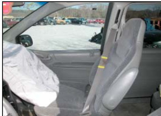
Figure 13. Front right safety belt, body fluid highlighted by calibrated tape.

The remaining outboard belt systems utilized light weight locking latch plates and belt sensitive ELR’s. The front right and second row seats were equipped with height adjustable D-rings that were in the full down position at the time of the SCI inspection. The third seat contained a center seating position that was configured with a fixed length lap belt with a locking latch plate and no retractor.