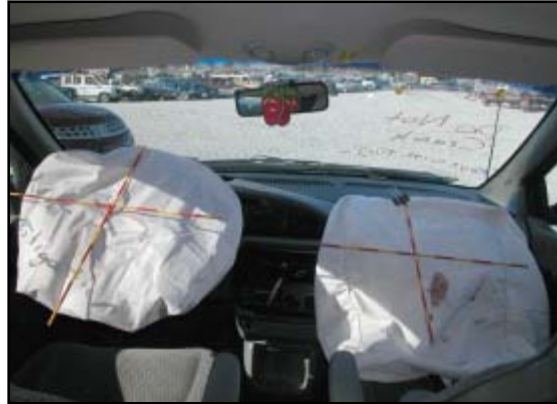
Figure 10. Deployed frontal air bags.

tear seam. The upper and lower flaps were measured at 3 cm (1.0”) and 8 cm (3.3”) in height respectively. The air bag membrane measured 66 cm (26.0”) in diameter in its deflated stated and was tethered by two internal tethers at the 3/9 o’clock sectors and was internally vented. The maximum rearward excursion of this bag at the tether locations was 25 cm (9.3”). There was no damage or evidence of driver contact on the deployed air bag; however, dirt was present of the air bag membrane from post-crash handling.