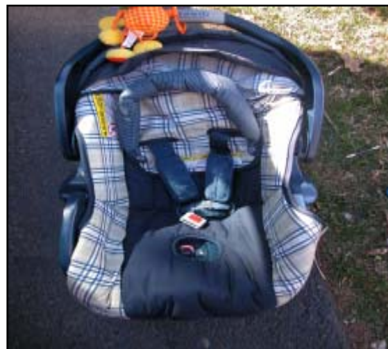
Figure 14. Graco infant seat.

The RFCSS was installed in the second row right position of the Plymouth and was used without the detachable base ( Figure 14 ). The driver stated during the SCI interview that the detachable base was located in the cargo area and she could not remove it due her recent caesarian section childbirth. Additionally, she stated that the lap and shoulder safety belt was routed across the top of the RFCSS through the belt path. The driver indicated that she set the retractor in the ALR mode. However, upon inspecting the RFCSS in the replacement vehicle, the retractor was not set in the ALR