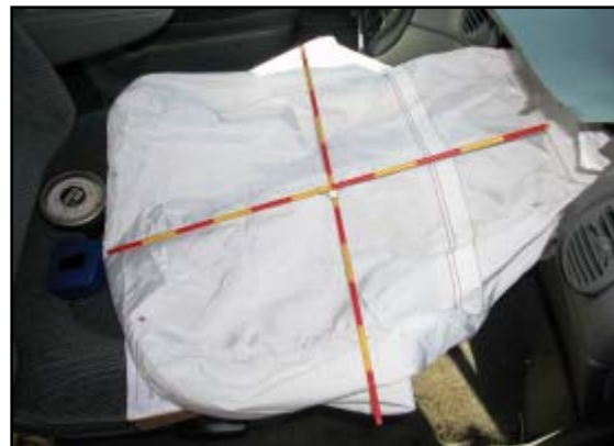
Figure 12. Lateral view of the maximum excursion of the front right air bag.