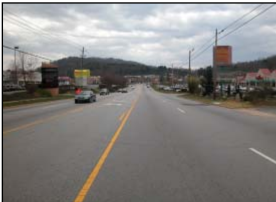
Figure 2. Plymouth's southbound approach.

The crash occurred on a straight segment of road with a downgrade for southbound travel. Located at the bottom of the grade was a business driveway that intersected the roadway from the west roadside. The driver of the Plymouth stated to the SCI investigator that she was returning home from picking up the 6-year-old right front occupant from an after school program. She was operating the vehicle southbound in the left lane approaching the driveway ( Figure 2 ). She stated that the 6-year-old male was describing the events that occurred at school to the driver. The driver of the Plymouth indicated that a non-contact vehicle (large van) was traveling southbound adjacent to the Voyager. The 46-year-old female driver of the 2004 Jeep Grand Cherokee was traveling eastbound approaching the mouth of the driveway ( Figure 3 ). It was unknown if the driver of the Jeep intended to turn left or continue her eastbound travel direction. As the Plymouth approached the driveway, the driver observed the van accelerate which created some distance between the vehicles. The driver stated that as the van passed the driveway she observed the Jeep travel into the southbound lanes. Additionally, she stated that she applied the brakes in an attempt to avoid an impact. Although the driver of the Plymouth did not indicate that she applied a steering input, it appears that she probably steered left prior to the impact.