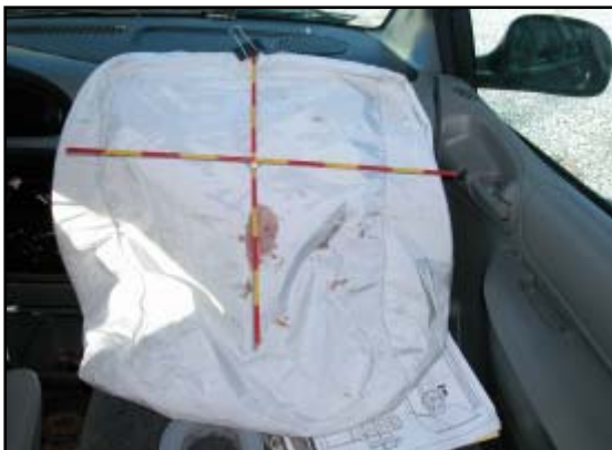
Figure 11. Deployed front right air bag.

The right front air bag membrane measured 48 cm (18.8”) in width and 83 cm (32.5”) in height ( Figure 11 ). The bag was not tethered and was internally vented. The maximum rearward excursion of this air bag was 71 cm (28.0”) from the instrument panel and terminated 8 cm (3.0”) from the right front seat back ( Figure 12 ). The air bag membrane extended and additional 28 cm (11.0”) into the instrument panel to the inflator.