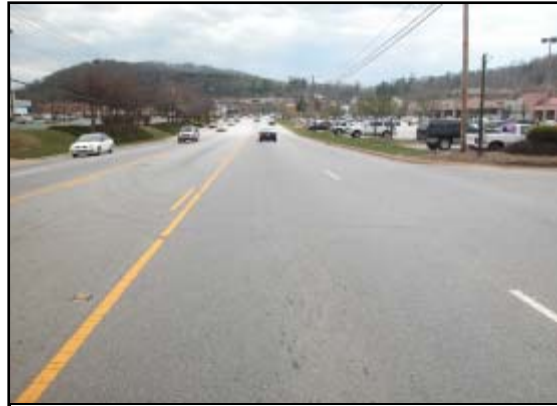
Figure 4. Area of impact from the southbound lane.

The front right area of the Plymouth impacted the left side of the Jeep within the left southbound travel lane ( Figure 4 ). Based on the area of contact to the vehicles, it appears that the driver of the Plymouth probably steered left. Resultant directions of force were 1 o'clock for the Plymouth and 10 o'clock for the Jeep. The damage algorithm of the WinSMASH program computed total velocity changes of 15 km/h (9.3 mph) for the Plymouth and 13 km/h (8.1 mph) for the Jeep. The specific longitudinal and lateral components were -13 km/h (-8 mph) and -8 km/h (-4.7 mph) for the Plymouth and -7 km/h (-4.0 mph) and 11 km/h (7.0 mph) for the Jeep. As a result of the crash, the frontal air bag system in the Plymouth deployed.