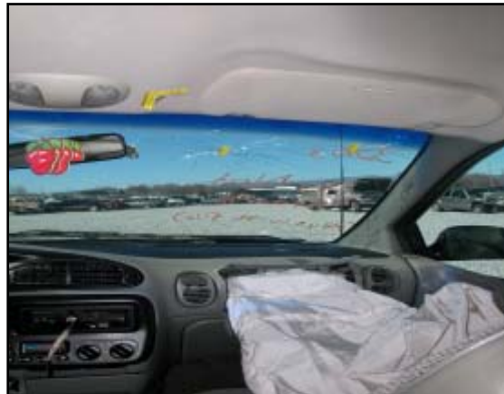
Figure 8. Overall view of right side windshield and headliner damage.

Two tears were documented on the headliner forward of the right sun visor. All four occupants of the vehicle were restrained; therefore this damage was probably pre-existing. The 1 cm (0.3”) laceration was located 9 cm (3.5”) inboard of the right A-pillar and 1 cm (0.5”) rear of the windshield header. The 5 cm (2.0”) laceration was located 48 cm inboard of the right A-pillar and 9-14 cm (3.5-5.5”) rear of the windshield header. Figure 8 is an overall of the right side damage to the windshield and headliner.