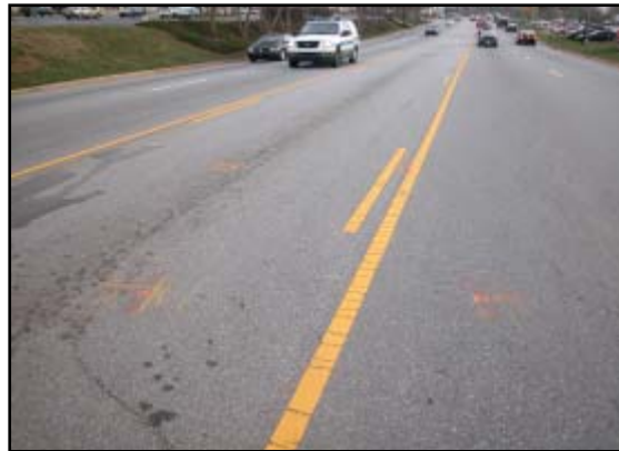
Figure 5. Plymouth's final rest.

The Voyager continued its forward and slight left travel and came to final rest approximately 10 m (33 feet) south of the driveway straddling the center two-way left turn lane and the inboard southbound lane ( Figure 5 ). The driver of the Jeep did not stop post-crash and fled the crash site. Police stopped the Jeep approximately 10 minutes post-crash on an interstate where it struck a sign post with the front right corner.