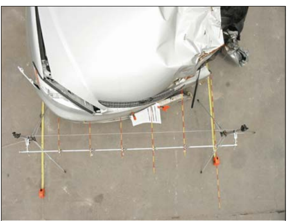
Figure 7: Overhead view of case vehicle's front crush profile, each increment on rods is 5 cm (2 in)

The case vehicle's recommended tire size was: P205/65R15, and the vehicle was equipped with tires of this size.. The case vehicle's left front tire was deflated and rotated outward as a result of the crash. The case vehicle's tire data are shown in the table below.