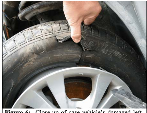
Figure 6: Close-up of case vehicle's damaged left front wheel

Exterior Damage: The case vehicle's contact with the Ford involved the front bumper, hood, grille, left fender (Figure 4 above), and the left front wheel (Figure 6). Direct damage began at the left front bumper corner and extended 121 centimeters (47.6 inches) along the bumper. Direct damage also extended 118 centimeters (46.5 inches) along the left fender, which was torn off. Residual maximum crush was measured as 37 centimeters (14.6 inches) occurring at C_2 (Figure 7 below). The case vehicle's front bumper, bumper fascia, radiator, left fender, grille. left turn lamp/headlamp assemblies, left front wheel, and hood were directly damaged and crushed rearward. The table below shows the case vehicle's crush profile.