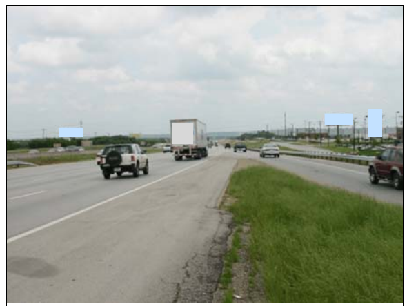
Figure 1: Easterly view from gore of entrance ramp and through lanes showing overview of crash scene, exact location of impact was not determined

Crash Environment: The trafficway on which both vehicles were traveling was a eight-lane, divided, Interstate highway, traversing in an eastwest direction and curving gently to the left for eastbound traffic (Figure 1). Both the eastbound and westbound roadways had four through lanes and paved shoulders. In addition, the eastbound roadway had an entrance ramp while the westbound roadway had an exit ramp. The trafficway was divided by a grass median, and there was a concrete median barrier along the inside shoulder of the westbound traffic way. Each travel lane was approximately 3.7 meters (12 feet) wide and the speed limit was 105 km.p.h. Roadway marking consisted of (65 m.p.h.). broken white lane lines, solid white edge lines and