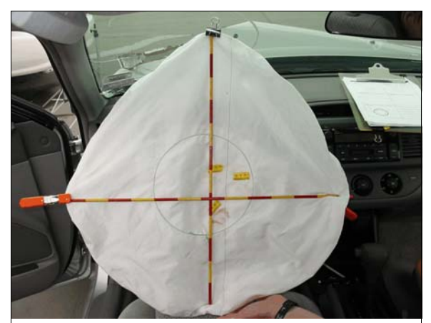
Figure 9: Case vehicle's deployed driver air bag, occupant contact evidence highlighted with yellow tape