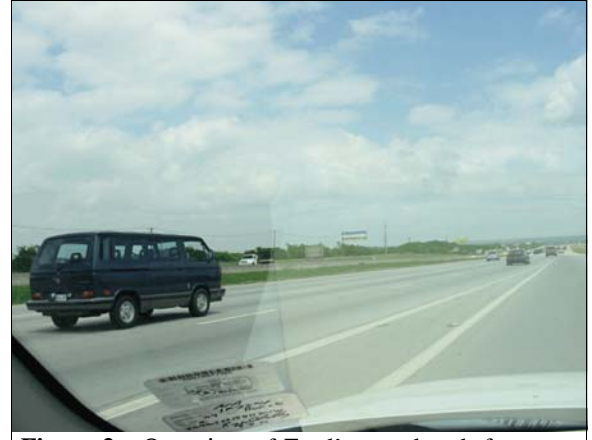
Figure 3: Overview of Ford's travel path from on ramp to crash area