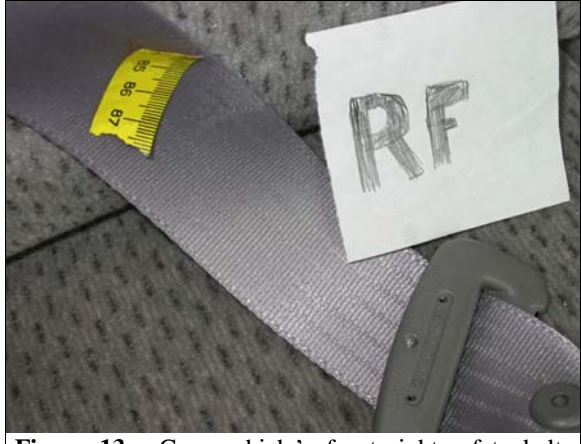
Figure 13: Case vehicle's front right safety belt showing friction burns (indicated by yellow tape) on webbing

As a result of the probable braking, the case vehicle's front right safety belt retractor most likely locked, and the front right passenger moved forward into his safety belt just prior to impact. The case vehicle's impact with the Ford caused the front right passenger to continue forward along a path opposite the case vehicle's 0 degree direction of principal force as the case vehicle decelerated. The passenger's face and chest impacted his deployed air bag causing a cervical strain and chest contusion. In addition, both knees impacted the knee bolster causing contusions to both knees. The passenger rebounded off his air bag moved to the right as the case vehicle rotated counterclockwise to final rest. The passenger remained restrained in his seat as the case vehicle came to final rest and exited the vehicle under his own power.