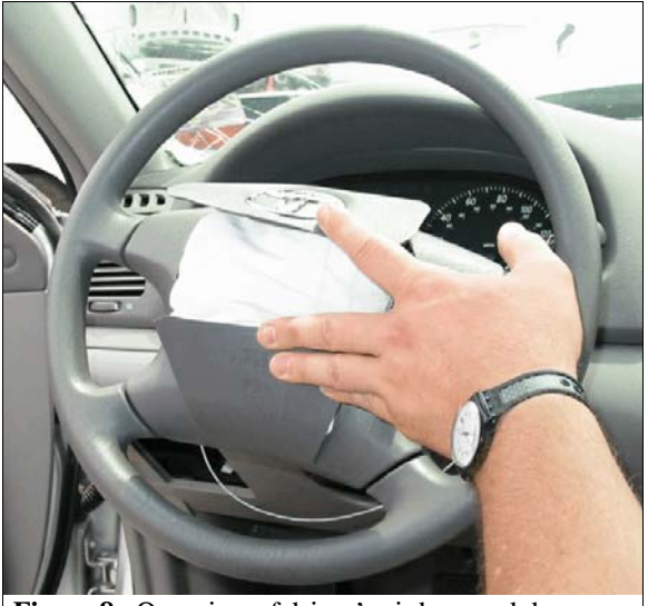
Figure 8: Overview of driver's air bag module cover flaps

The case vehicle's driver air bag was located in the steering wheel hub. An inspection of the air bag module cover flaps (Figure 8) and the air bag fabric revealed that the cover flaps opened at the designated tear points There was no evidence of damage during the deployment to the air bag or the cover flaps. The top cover flap was triangular in shape and was 16.5 centimeters (6.5 inches) in width at it widest point near the tear seam and 7 centimeters (2.8 inches) in height. The bottom cover flap was also triangular in shape and was 14 centimeters (5.5 inches) in width at its widest point near the tear seam and 8 centimeters (3.1) in height. The driver's air bag was designed with two tethers, each approximately 11 centimeters (4.3 inches) in width and had two vent ports, each approximately 3 centimeters (1.2 inches) in diameter, located at the 11 and 1 o'clock positions. The deployed driver's air bag (Figure 9) was round with a diameter of 65 centimeters (25.6 inches). An inspection of the driver's air bag fabric revealed eye and lip makeup near the center of the air bag (Figure 10). The distance between the mid-center of the driver's seat back as positioned at the time of the inspection (i.e., between forward-most and middle track position) and the front surface of the air bag's fabric at full excursion was 24 centimeters (9.4 inches).