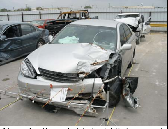
Figure 4: Case vehicle's front left damage and damage to left fender and wheel assembly from the impact with the Ford