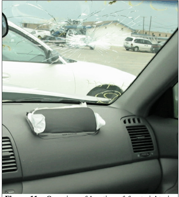
Figure 11: Overview of location of front right air bag, air bag module flap and cracked windshield from deployment