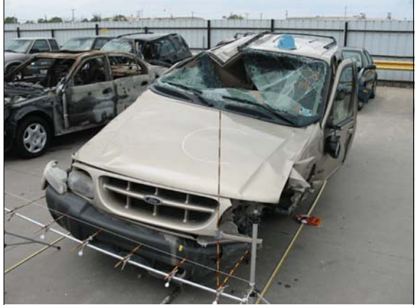
Figure 5: Ford's front left and left fender damage from impact with the case vehicle, and top damage due to the subsequent rollover.

Crash: The front left of the case vehicle ( Figure 4 ) impacted the front left of the Ford ( Figure 5 ) causing a stage one deployment of the case vehicle driver's air bag and a stage two deployment of the front right passenger air bag. As a result of the impact with the case vehicle, the Ford's counterclockwise rotation was accelerated, and the Ford entered the median and rolled over, driver side leading, one-and-one half times (six quarter turns).