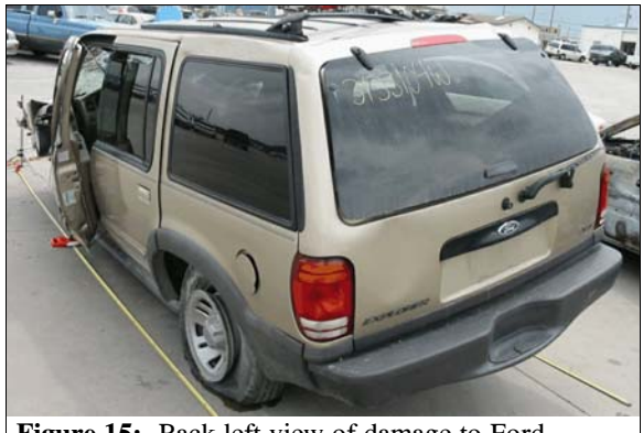
Figure 15: Back left view of damage to Ford