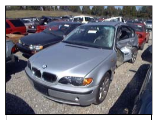
Figure 1. Subject vehicle 2002 BMW 325i.

This remote investigation focused on the performance of the Side Impact Inflatable Occupant Protection system (Figure 1) in a 2002 BMW 325i. The safety system included front door panel mounted side impact air bags and a Head Protection System (HPS) that consisted of roof side rail mounted tubular air bags for the front seating positions. In addition, the BMW was equipped with dual stage frontal air bags, a front right seat occupant presence sensor, and buckle pretensioners. The 2002 BMW 325i was occupied by a restrained 16-year-old female driver. The BMW was