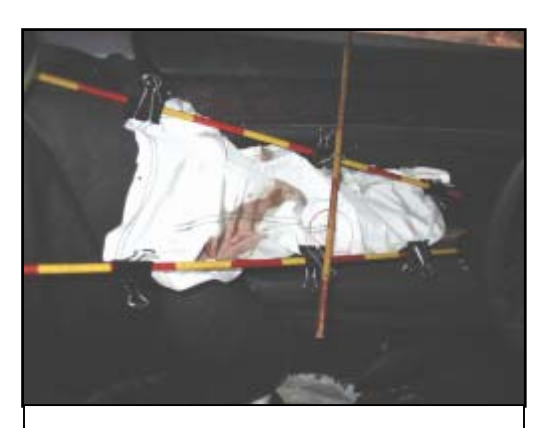
Figure 12. Deployed driver's door panel mounted side impact air bag. Noted the blood on the air bag is from driver bleeding onto it at final rest not an occupant contact.

The 2002 BMW 325i was equipped with door panel mounted side impact air bags for the front seating positions. In this crash, the driver's door panel side impact air bag deployed ( Figure 12 ). The air bag was concealed by a leather cover flap that measured 8.0 cm (3.2") in height and 34.0 cm (13.4") in width. The air bag membrane measured 12.0 cm (4.7") in height and 40.0 (15.7") in width at the top aspect and 30.0 cm (11.8") in width at the lower aspect. The air bag contained a single circular tether on the center aspect of the air bag. No vent ports were noted on the air bag. The NASS researcher documented a large area of body