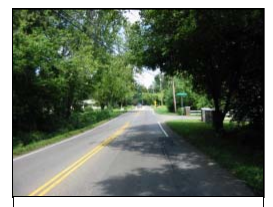
Figure 3. Ford's eastbound approach to the intersection.