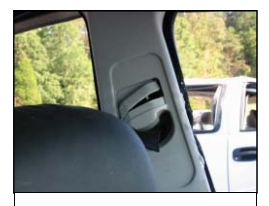
Figure 10. Shoulder belt portion retracted in B-pillar cut by rescue

The 2002 BMW 325i was equipped with manual 3-point lap and shoulder safety belts for the outboard seating positions. The rear center seating position was configured with a manual 2-point lap belt. The driver's safety belt was configured with a height adjustable D-ring that was in the full-up position at the time of NASS inspection, sliding latch plate, and Emergency Locking Retractor (ELR). The driver's safety belt was also equipped with a buckle pretensioner that did not fire in this crash. The driver utilized the safety belt in this crash which was evidenced by EMS personnel cutting the safety belt ( Figure 10 and 11 ). The shoulder portion was retracted into the B-pillar and the lap portion remained attached to the latch plate that was found in the buckled position at the time of the NASS inspection. The front right safety belt was configured with an adjustable D-ring; sliding latch plate, buckle pretensioner, and a switchable ELR/Automatic Locking Retractor (ALR). The front right safety belt pretensioner did not fire in this crash. The rear outboard safety belts were configured with sliding latch plates and switchable ELR/ALR retractors. The rear center safety belt was configured with a locking latch plate and no retractor.