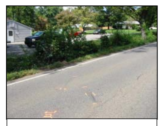
Figure 5. Approach to final rest and shrub impacts for both vehicles.

As result of the initial impact, both vehicles were deflected in a northeast direction. The NASS researcher documented multiple centrifugal skid marks from the BMW as it traveled northeast rotating counterclockwise. The NASS researcher also documented two post-impact skid marks from the Ford as it traveled northeast. As the BMW rotated approximately 90 degrees counterclockwise, it departed the north road edge and traveled approximately 6.0 meters (20.0 feet) where its back plane impacted a shrub as it came to rest ( Figure 5 ). The Ford continued in a forward