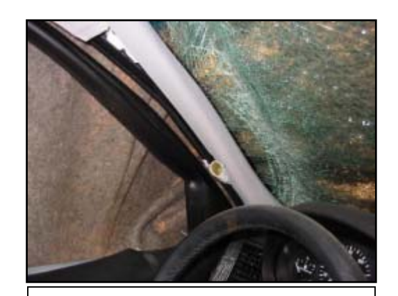
Figure 17. Area of HPS that rescue personnel cut.