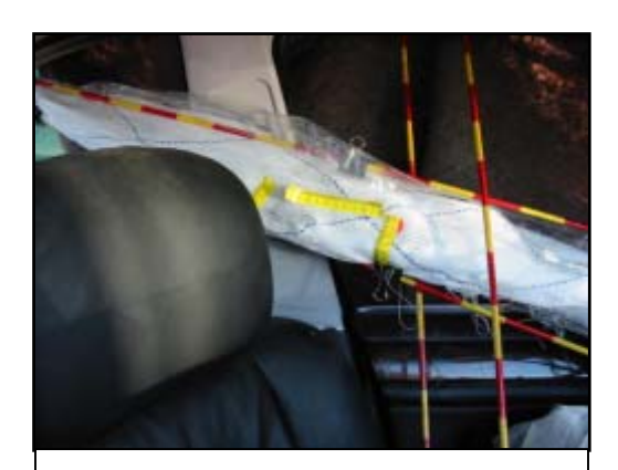
Figure 14. Head restraint contact to HPS air bag.

restraint. The transfer was black in color and consistent with contacting the head restraint, therefore it was not considered and occupant contact ( Figure 14 ). Rescue personnel cut the air bag at the A-pillar tether during the removal of the driver ( Figure 16 and 17). There also appears to be several small cuts and frayed air bag material from contact with glass and the front of the Ford. The NASS researcher noted no failures or damage to the air bag.