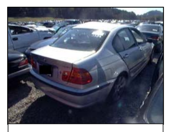
Figure 7. Rear area no residual damage from shrub impact.

The BMW sustained no damage from the back plane impact with the shrub ( Figure 7 ). The CDC for this impact was 99-B999-9.