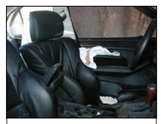
Figure 8. Intrusion into driver's position.

The 2002 BMW 325i sustained moderate interior damage ( Figure 8 ) as a result of intrusion and occupant contacts. The maximum documented intrusion was the front of the Ford intruding approximately 40.0 cm (15.7") into the front left passenger compartment area. The occupant contacts consisted of the driver's left shoulder contacting the upper aspect of the left door that was evidenced by deformation to the door panel. A contact was noted to the lower aspect of the door panel from the driver's left leg that deformed the door panel. Also noted