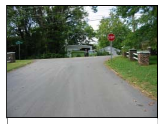
Figure 2. BMW's northbound approach to the intersection.

The restrained 16-year-old female driver of the BMW was operating the vehicle northbound approaching the three-leg "T"-type intersection ( Figure 2 ) where the driver was intending to turn left. The driver of the Ford was operating the vehicle eastbound approaching the same intersection ( Figure 3 ). The driver of the BMW failed to detect the Ford and turned left across the path of the Ford. The NASS researcher documented approximately 11.5 meters (38.0 feet) of left front pre-impact skid marks and approximately 9.0 meters (29.5 feet) of right front pre-impact skid marks that indicated the driver of the Ford detected the BMW entering the intersection and attempted to avoid the impending crash by braking. The NASS scene schematic is included as Figure 18 of this report.