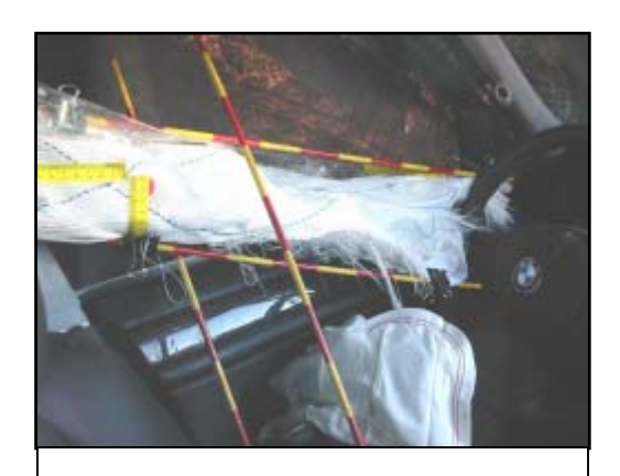
Figure 16. Damage from rescue personnel cutting the HPS air bag. Also, the air bag sustained minor cuts from contact with flying glass.