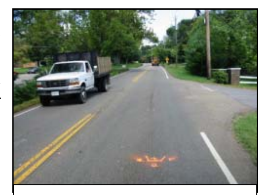
Figure 4. Eastbound view of point of impact. Note Ford's pre-impact skid marks.

As the vehicles entered the intersection the frontal aspect of the Ford impacted the left passenger compartment area of the BMW (Figure 4). The impact resulted in severe damage to the left side of the BMW and minor damage to the Ford. The resultant direction of force was within the 10 o'clock sector for the BMW and unknown for the Ford due to the vehicle being repaired prior to the NASS inspection. The WINSMASH missing vehicle algorithm was used to calculate an approximate delta V for this impact due to the repair status of the Ford. The total calculated delta V for the BMW was 35.0 km/h (21.7 mph). The