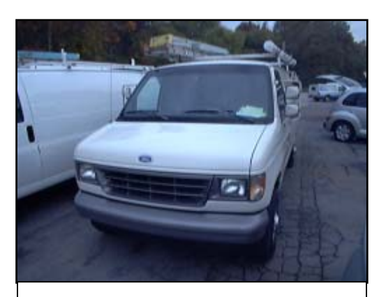
Figure 9. Repaired 1995 Ford Econoline.

The Ford sustained unknown severity frontal damage from the impact with the shrub as it came to rest. The CDC for this impact was 99-F999-9.