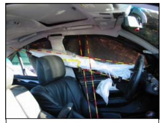
Figure 13. Deployed driver's HPS air bag.

The 2002 BMW 325i was equipped with a Head Protection System (HPS) for the front seating positions. The system included two tubular air bags that deployed from the roof side rails and were designed to protect the occupants in the event of a side impact. As a result of the subject crash, the left side HPS deployed (Figure 13 and 15) from the left roof side rail. The air bag membrane was 12.7 cm (5.0") diameter and 112.0 cm (44.1") in width. The HPS was tethered at the left A- and C-pillars and was tensioned by inflation. The NASS researcher documented a transfer on the air bag, which was located near the front left head