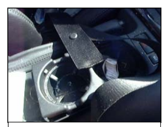
Figure 11. Cut lap belt portion remained buckled.