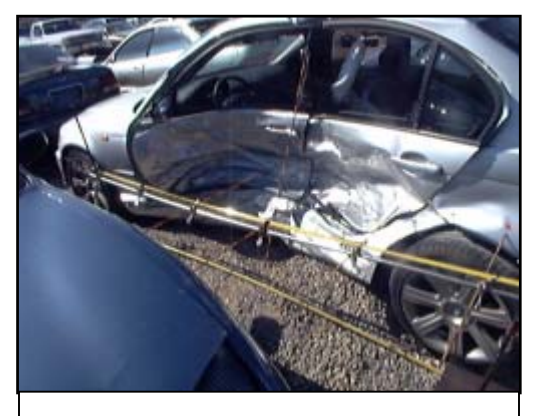
Figure 6. 2002 BMW 325i damage profile.

The 2002 BMW 325i sustained severe left side damage as a result of the collision with the Ford (Figure 6). The maximum crush was located at the mid-door level near the B-pillar and measured 48.0 cm (18.9"). The direct contact damage measured 192.0 cm (75.6") and began 4.0 cm (1.6") forward of the left rear axle and extended forward. The damage involved the left side doors, sill, left A-pillar, left B-pillar, roof, roof side rail, windshield, and left rear quarter panel. Six crush measurements were documented along the mid-door level using a combined direct and induced damage width of 212.0 \text{ cm} (83.5^{\circ}) and were as follows: C1 = 4.0cm (1.6), C2 = 24.0 cm (9.5), C3 = 48.0 cm (18.9), C4 = 46.0 cm (18.1), C5 = 38.0 cm (15.0), C6 = 5.0 cm (2.0). The Collision Deformation Classification (CDC) for this impact was 10-LPAW-3. The left side doors were jammed closed by deformation and the right side doors remained closed operational post-crash. The windshield was fractured at the left A-pillar from the lateral deformation of the A-pillar and roof. The left front and left rear glazing were disintegrated from damage. The left quarter, backlight, and right side glazing remained intact.