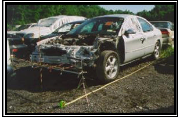
Figure 3. Frontal damage to the 2001 Ford Taurus SE (hood and fenders removed).

The 2001 Ford Taurus SE sustained moderate frontal damage as a result of the impact with the Jeep Grand Cherokee ( Figures 3 & 4 ). The direct contact damage began at the front left bumper corner and extended 118.0 cm (46.5 in) inboard. The impact deformed the entire front end width resulting in a combined direct and induced damage length (Field L) of 124.0 cm (48.8 in). Six crush measurements were documented at the level of the reinforcement bar ( bumper fascia separation ): C1= 6.0 cm (2.4 in), C2= 25.0 cm (9.8 in), C3= 24.0 cm (9.4 in), C4= 17.0 cm (6.7 in), C5= 8.0 cm (3.1 in), C6= 0 cm. The Collision Deformation Classification (CDC) assigned for this impact to the Ford was 01-FDEW-2 with a principal direction of force of (+)20 degrees. An indentation was documented along the reinforcement bar and attributed to the front left bumper corner of the opposing Jeep. The hood was deformed slightly up and rearward from the impact force. The left fender was deformed rearward which produced a partial restriction of the left front door opening. The windshield was fractured at the left lower A-pillar from exterior impact forces (only). The left front tempered glazing was disintegrated post-crash by salvage personnel. Reduction in the left side wheelbase measured 3.0 cm (1.2 in).