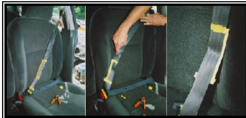
Figure 6. Crease marks to the front left restraint.

The interior of the Ford Taurus consisted of a six passenger seating configuration with front bucket (with a “flip and fold” center console that converted to a center seat position) and a rear bench seat. The driver 3-point manual lap and shoulder belt system consisted of a continuous loop belt webbing with a sliding latchplate and a dual mode retractor (inertial lock/belt sensitive). A stowage crease mark was noted on the shoulder webbing of the driver restraint ( Figure 6 ) which followed the pattern of the inboard seat back taper. The specific location of these distinct line marks on the webbing indicated the driver probably sat on/against the belt in an unrestrained fashion . The driver stated during the SCI interview that he routinely buckled the belt in this manner to defeat the vehicle (restraint) audible chimes. Furthermore, loading marks on the lap and shoulder belt webbing (from the latchplate and D-ring) confirmed the latchplate was in the buckle at the time of collision induced pretensioner activation. The front center seat was equipped with a 2-point manual lap belt and a locking latchplate. The front right (and rear) seating position was equipped with a 3-point manual lap and shoulder belt system which consisted of a continuous loop belt webbing with a sliding latchplate and a retractor equipped with an inertial and switchable lock mechanism.