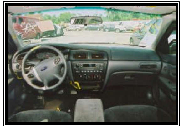
Figure 7. 2001 Ford Taurus SE non-deployed redesigned frontal air bag system.

The 2001 Ford Taurus SE was equipped with dual stage redesigned frontal air bags ( vehicle not equipped with the seat mounted side impact air bag system option ) for the driver and front right passenger positions which did not deploy as a result of the crash ( Figure 7 ). The driver air bag was housed in the center of the steering wheel with a horizontally oriented flap tear seam (H-configuration). The front right passenger air bag was housed in the right mid-instrument panel area with a single cover flap design hinged at the top aspect.