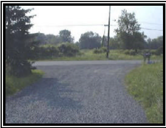
Figure 1. Eastbound approach view for the 1996 Jeep Cherokee.

The 60 year old male driver of the 2001 Ford Taurus SE was operating the vehicle southbound ( Figure 2 ) and negotiating a left curve at a (driver reported) speed of 89 km/h (55 mph) when he observed the 1996 Jeep Grand Cherokee cross his path of travel. Upon recognition of the impending harmful event, he steered left in avoidance and partially entered the northbound lane prior to the collision.