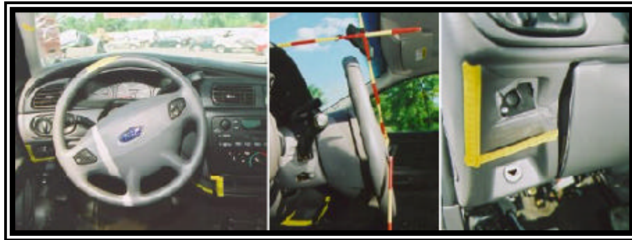
Figure 5. Interior damage to the 2001 Ford Taurus SE.