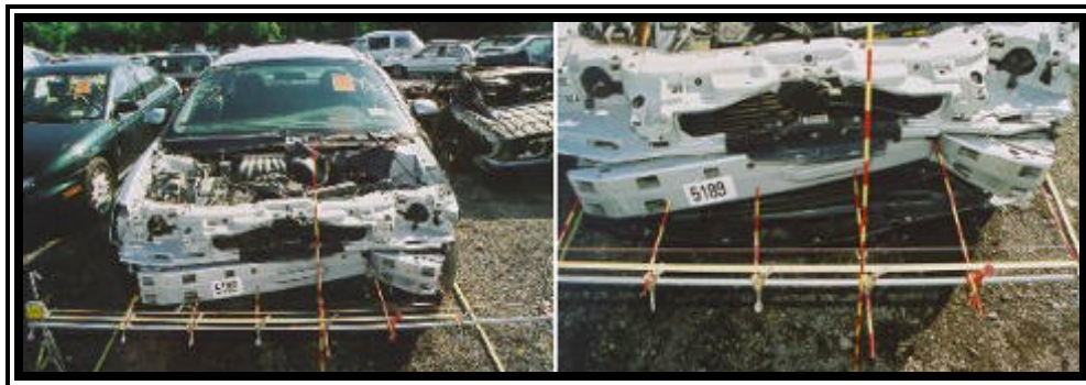
Figure 4. Contour gauge overview.