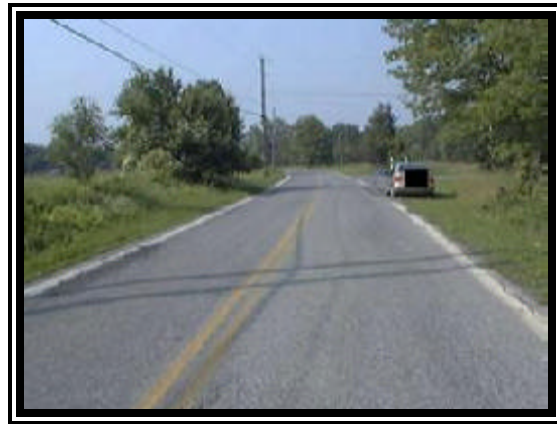
Figure 2. Southbound approach view for the 2001 Ford Taurus SE.