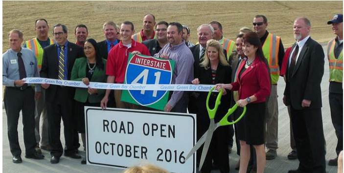
Officials celebrate an interchange opening on Wisconsin's I-41 project.

The Wisconsin Department of Transportation held a ceremony in Green Bay to celebrate the substantial completion of the I–41 project and the opening of the I–41/I–43 system interchange to traffic. The project, one of Wisconsin's largest highway construction projects, spans more than 30 miles in Brown and Winnebago Counties and includes reconstruction or improvement of 16 interchanges and 40 roundabouts . The project will be fully completed in June 2017.