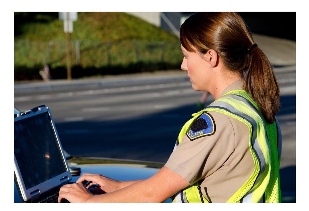
As traffic incident management activities increase, so does the need to capture data that can be used to assess program performance and drive improvements.