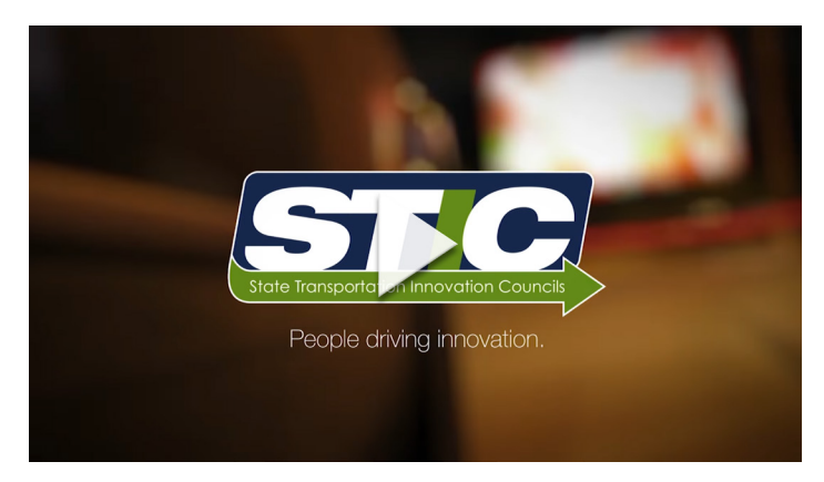
Watch an FHWA video on the benefits of STIC involvement.

Massachusetts STIC successes include projects built with the design-build contracting method and deployment of innovations such as e-Construction technologies, smarter work zones, and ultra-high performance concrete connections for prefabricated bridge components.