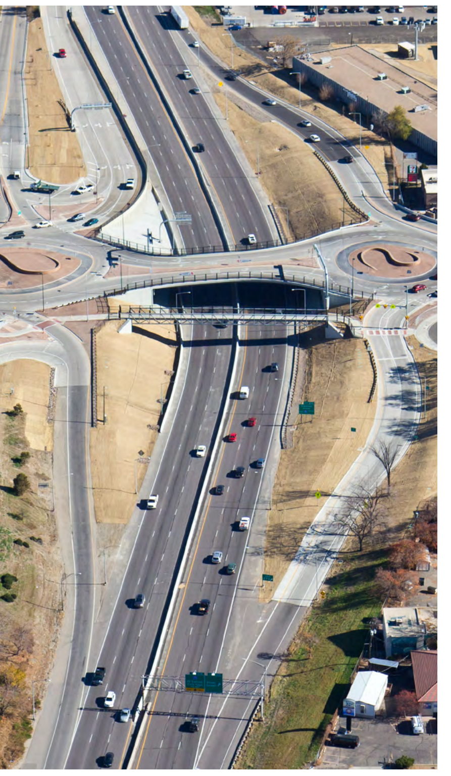
Every Day Counts has helped states accelerate adoption of innovations such as intersection and interchange geometrics (left) and warm-mix asphalt (right).

Every Day Counts, the Federal Highway Administration's initiative to encourage widespread use of proven innovations, is having a positive effect on the highway community's adoption of new technologies and practices.