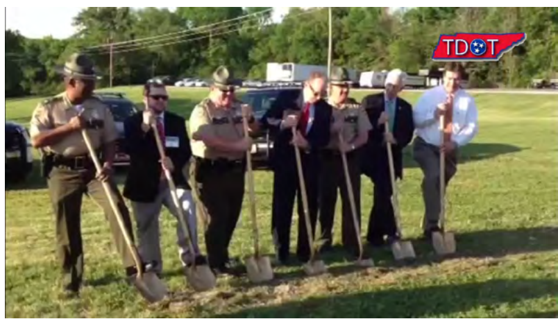
Tennessee's traffic incident management facility

The Tennessee Department of Safety and Homeland Security and the Tennessee Department of Transportation are building the first traffic incident management training facility in the country. The Nashville facility will be used to teach emergency