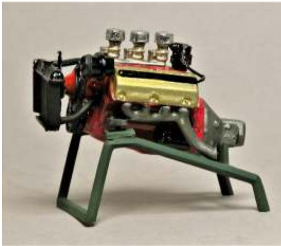
The 1953 Desoto 276 Fire Dome engine is from an old AMT kit.