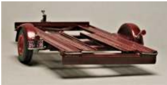
1955 Trailer Scratch built