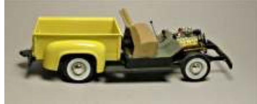
1953 Ford F-100 chassis sub assembly