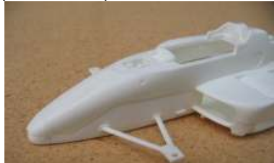
Picture 2: Here the two body sections have been glued together and you can see how bad the seam is. But this way you can start working to make it disappear before you paint the body.