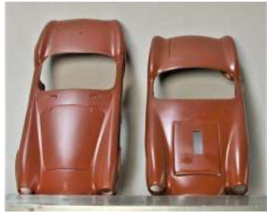
Body comparison: AMT 1/25th Cobra on Left and modified 1/24 th scale 427 Cobra body (Meteor 1/25 th scale) on right. Note the wheel base is the same but the body is wider, shorter and has a shorter passenger compartment. Hood and trunk openings are rectangles.