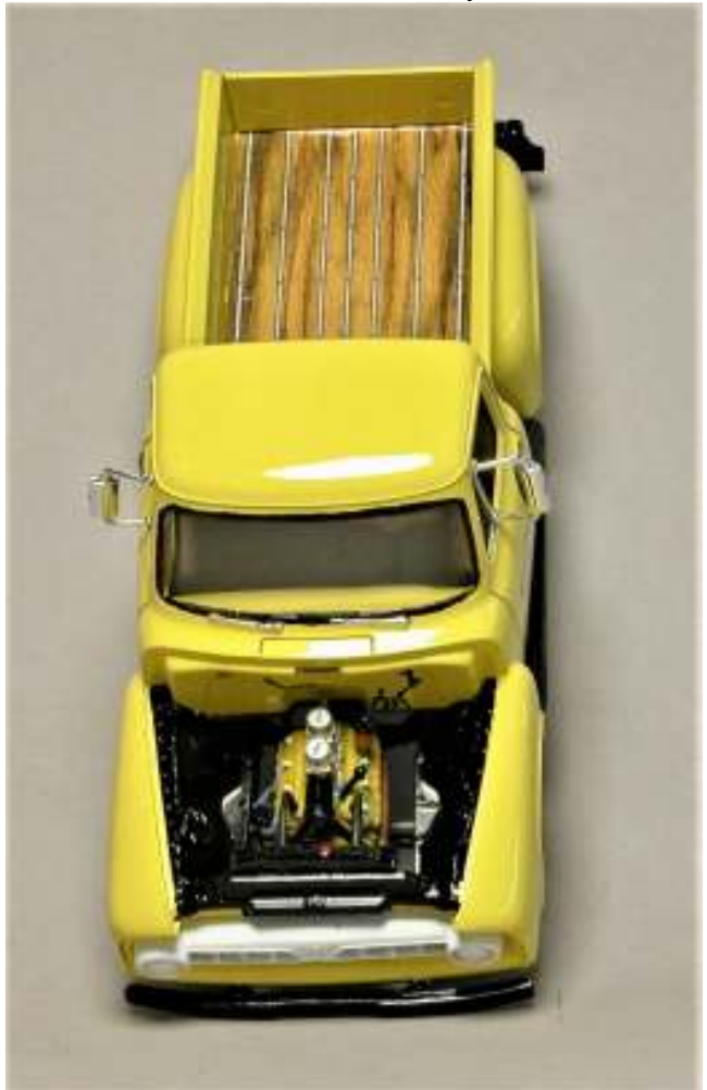
1953 Ford F-100 engine with dual carbs and chrome air cleaners