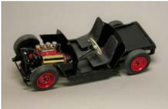
Chassis assembly – The chassis was mostly scratch built using sheet and strip styrene.