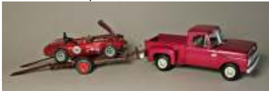
1966 Ford Flareside with trailer and 1964 Ford Cobra race car. The trailer was scratch built from styrene strip, shapes and the ramps and bed are made from parts of a 1/35th scale Russian Rocket launcher truck.