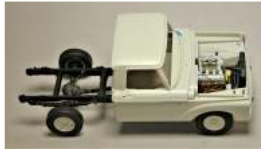
1966 Ford F0-100 Flareside body test fit and final installation of Lincoln motor. The extra length of the Lincoln motor was mostly caused by the huge water pump in the front.

These four models took up a good deal of my model building time and I had plenty of that during the shutdown.