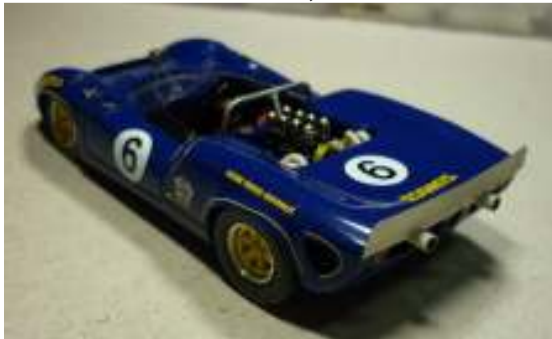
"I finished my 1/43rd Lola T70"