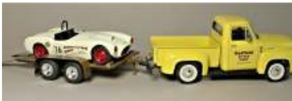
1953 Ford F-100 and trailer with Meteor Sports car. The trailer came with the 1953 Ford Pickup kit and I modified it by adding the scratch built hitch socket, trailer jack, tail lights, license plate, fenders and ramps.