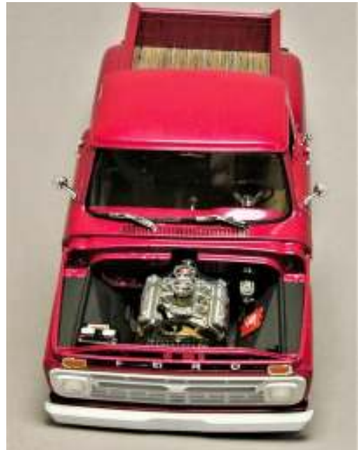
Almost stock 1953 Ford pickup and 1966 Ford Flareside with 430 cubic inch Lincoln motor

I recently built two Ford Pickup trucks that would be used to haul trailers with race cars.