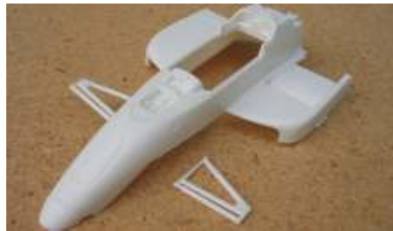
Picture 1: This shows the upper A-arms cut off and how you want to make the cut as close as you can to the body

The last real issue you deal with are the top A-arms you removed earlier. I use 2-part clear 5 minute epoxy to attach them to the side of the body. It dries with a strong bond; you can wipe off any excess before it dries and it does not affect any of the existing paintwork. Everything else in the building of these kits follows the instructions.