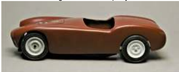
Body test fit on chassis – the body is a much modified 1/24 th scale Monogram 427 Cobra. The flares on the 427 body were removed and new front and rear wheel openings were created. The wheel openings were blanked out and then recut to fit the smaller 1/25 th scale tires. I used KISS brand fake fingernail resin to fill the sides of the body.

The same basic one piece body was manufactured and sold as a Byers, Comet and Sorrell. Engines were up to the builder and early cars had everything from flathead Fords to early OHV Cadillacs and Olds. The wide engine bay allowed these engines to fit. They were also fitted with the Chevy small block after 1955.