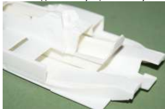
Picture 3: You will need to trim the top part of the cockpit so you can slide it in from the back. You won't notice it once when you finish the model.