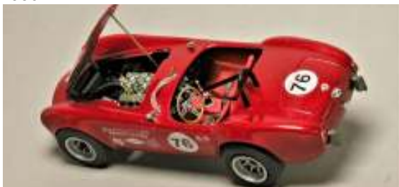
1964 Ford Cobra #76 B/P