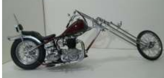
Earl Spiegelberg IL

"Just completed my latest Glue bomb (Cherry). I had picked up a couple of baggies full of broken/misc. bike parts at a toy show a couple of years ago and was able to cobble together enough parts to build a 1/8 scale model of my very first 1:1 chopper that I built back in the early 70's. It was a 1962 Triumph Bonneville."