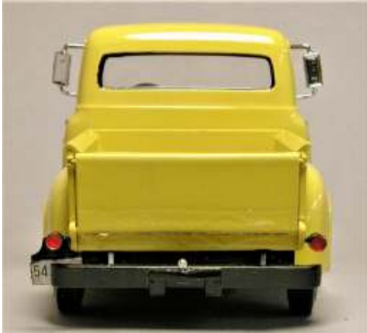
1966 Ford F-100 Flareside and 1953 Ford F-100 1/2 ton