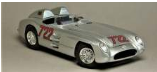
Mercedes 300 SLR Targa Florio 1955