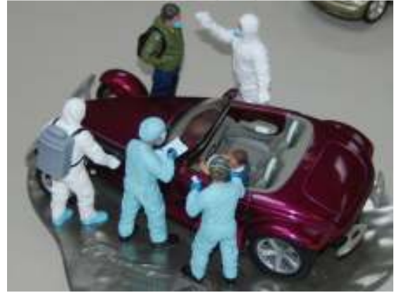
1/18 Scale Drive thru Covid Test and Shots