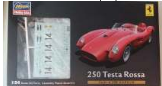
Next one on the bench, restarting after 13 years!