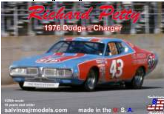
R-RPDC1976D Richard Petty 1976 Dodge Charger

The next new kit from Salvino JR will be the 1976 Petty Dodge Charger.