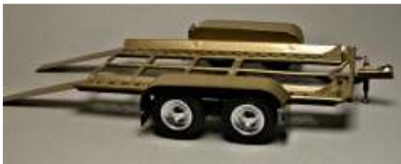
1956 Trailer modified kit model