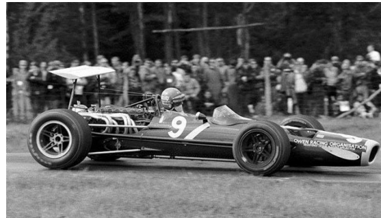
Bobby was entered in two Grand Prix races in 1968, by the BRM Team. He did not start in Italy at Monza in a rules dispute but he did take part in the US Grand Prix at Watkins Glen.

On a personal note, I saw Bobby Unser race several times, 1967-1970, at the Springfield one mile oval, in the USAC Champ Car races held during the Illinois State Fair. And maybe at the USAC Stock Car race held the same weekend, but I cannot find records for those races. And then moving to Albuquerque the Unser family has a huge legacy. The original family garage still stands. The Unser Racing Museum is a great display of memorabilia from all the Unsers, including trophies from races at Springfield. And the main street on the western edge of town is named after the family.