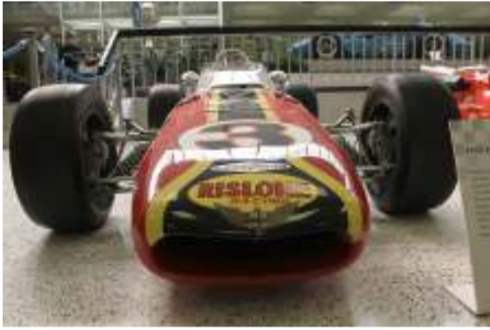
1968 Indy 500 Winner