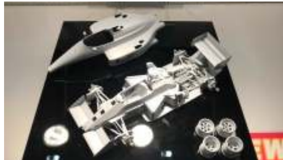
NuNu Lotus 99T 1/12

No word on the availability of the previously released LeMans Porsche 911 RSR kits.