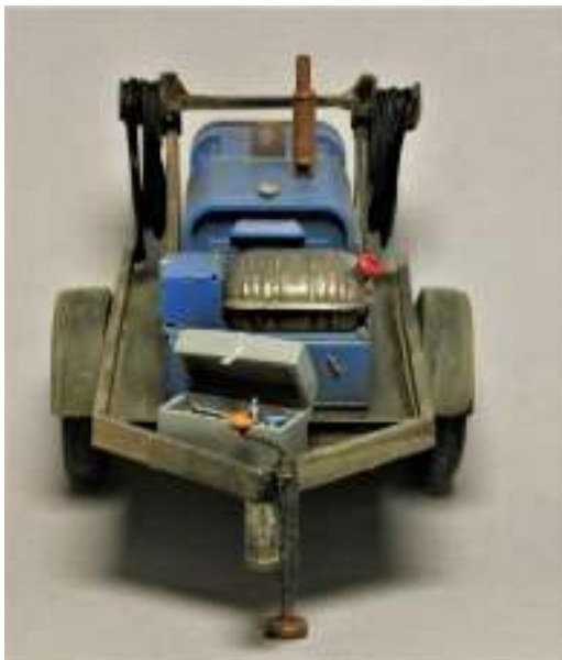
Scratch built tool box and trailer jack