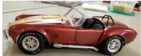
David had a '66 Cobra from Revel which was a poorly built kit and stripped the kit to bare plastic. Repainted and used Spastik chrome for most of the shiny bits. Paint was Burgundy Red Metallic over a Krylon gold leaf short cuts undercoat.