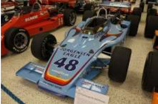
1975 Indy 500 Winner