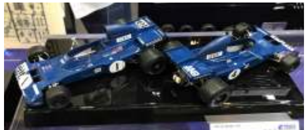
1/20 Tyrell 005 1972