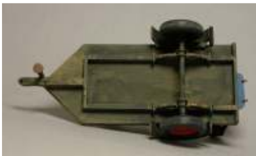
Welder control panel and welding cable sockets Trailer bottom view

The finished model will be a good entry for the miscellaneous class at contests.