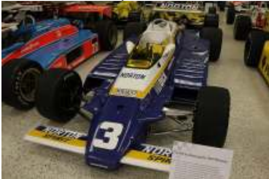
1981 Indy 500 Winner