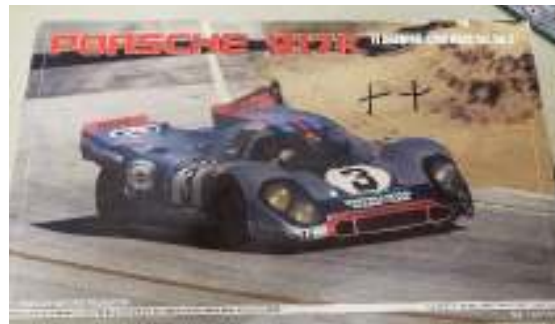
Doug with a Fujimi Porsche 917K kit with photo etch and extra decals