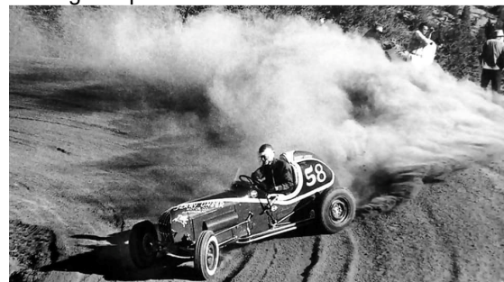
1956 Pikes Peak

An avid snowmobiler, Unser did make news in the late 1990s when he and a friend got lost and spent two frigid nights stuck in the wilderness. After they were found, Unser was charged with a federal misdemeanor of operating a snowmobile in a national wilderness area. Unser, who was fined $75, was determined to have the record expunged, and appealed all the way to the Supreme Court. His petition wasn't granted, but it was always part of Uncle Bobby's character to never give up.