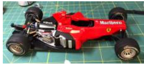
“Tamiya Ferrari F2001”