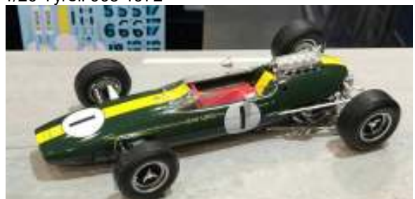
1/20 Lotus 33 F1 1966