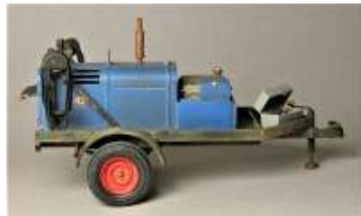
Welding cables and early Miller Logo

Once I had finished the trailer and welder I decided to add one more small detail. I used four AMT 1949 Ford custom accessories that were old reel to reel tape decks. I cut them in half and shortened them to a tool box length, then glued them back together and made a hinge from .004" sheet lead. I added a handle on top and a latch strap. Last but not least, I added the welder guy who is 1/24 th scale. I won him as an attendance prize.