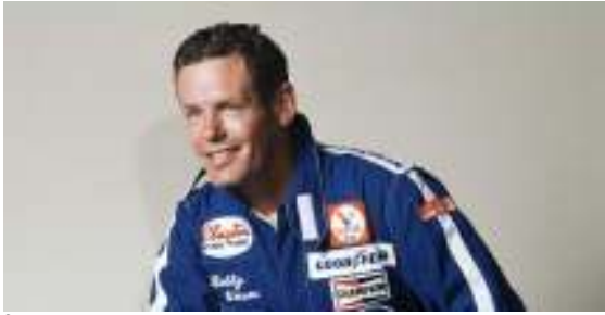
from various online sources