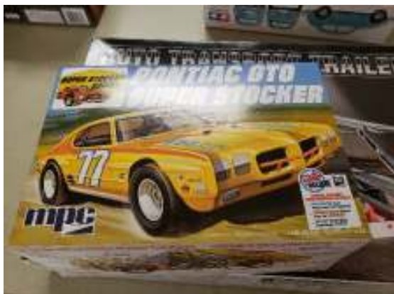
Round 2 Pontiac Superstocker from Dave. Great car to drive as the exhaust goes right through the cockpit to the side door