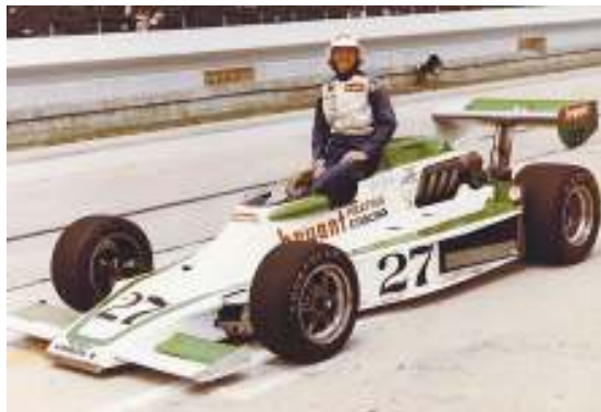
Janet Guthrie 1977 Indy 500