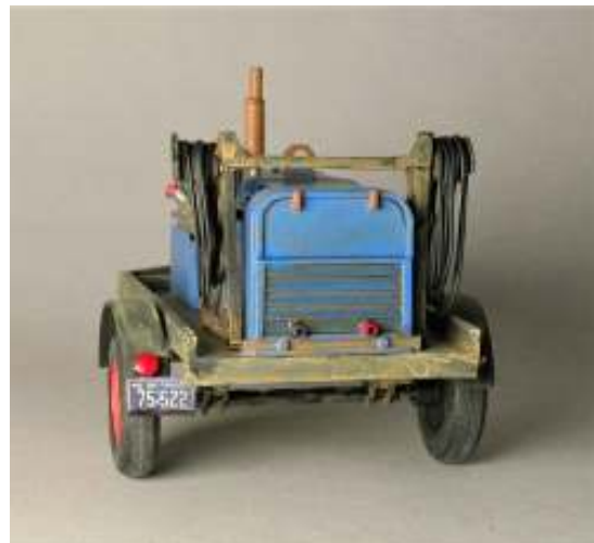
Rear view of trailer with control panel closed