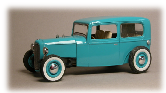
1932 Ford Tudor Sedan Street Rod a 1950's street rod with flathead power