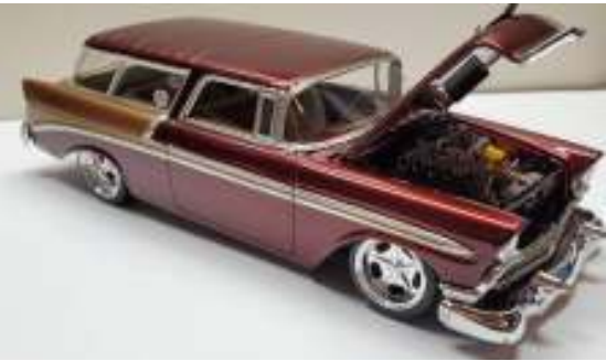
Best Paint Wes Salazar 56 Nomad