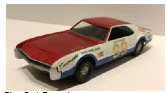
Pikes Peak Toranado