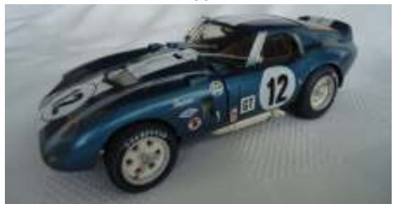
Competition Class Winner