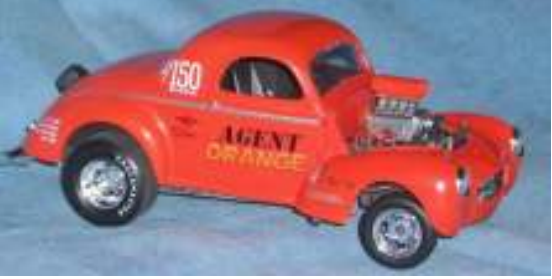
Agent Orange 41 Willys