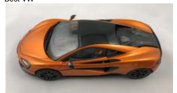
Best Out of the Box