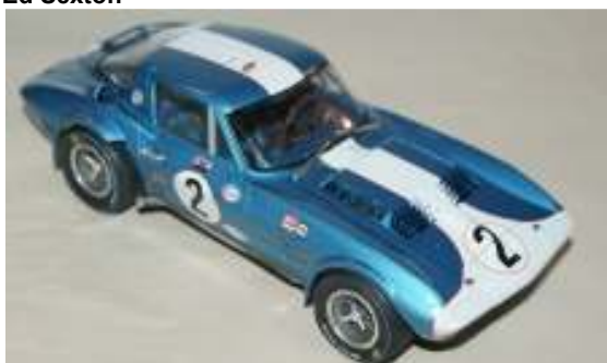
The Accurate Miniatures Corvette Grand Sport