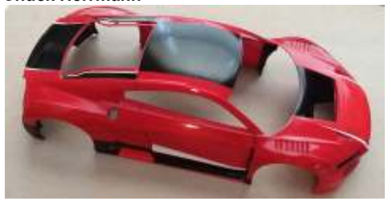
NuNu Audi R8LM GT3