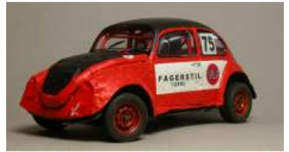
by Dave Roeder St Louis MO

I have been working on some back burner projects during the Covid-19 restrictions. The most fun ones were two Finland Folkrace cars. Folkrace is a low cost form of racing for the everyman in Finland. The rules are pretty simple. Cars can be front wheel drive or rear wheel drive, but not 4 wheel drive and not diesels. They must have safety equipment according to the local rules. To keep the cost down, all cars regardless of finishing position can be purchased for $1,650.00. These cars are not very neatly done inside or out. Many have hand painted decorations. There are six car heats with speeds exceeding 80 miles per hour on courses that average 1.5 miles in length. Tracks combine dirt and gravel with pavement. The races are also short (about 5 minutes) and feature a lot of action with frequent contact and resulting spins, rolls, and sliding crashes into large sand and gravel berms that line some of the courses. The season runs into winter with some races held during snow and sleet. The damaged cars are removed from the track with large rubber tired front end loaders. The forks are shoved under the cars and they are hauled off. The most common cars raced are Saabs and Volvos. Swedish Folkrace videos have entire fields of those two makes.