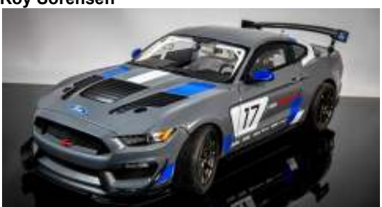
Tamiya Mustang GT3