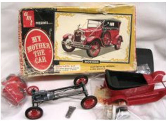
My Mother the Car TV Series