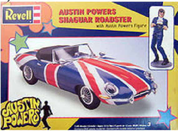
Yeah Baby! Austin Powers Jaguar