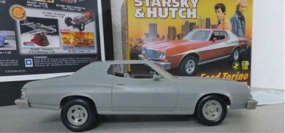
Above, test shot

Interior: It is of the platform type and seems a little barren of detail. As I mentioned above bucket seats were no longer avail-able so a bench is what we get, but why couldn't it be the split bench seat? It may be possible to cut and rebuild this seat that way. After-market seatbelts would be a good upgrade. The seat does get a back panel with an ashtray molded in. The steering column has both levers and separate steering wheel and a separate pair of pedals goes beneath the dash. The dash is very accurate; it's a perfect copy of the one in my car. The instrument panel, steering wheel and glove box door all get wood grain decals. And let's not forget the gauge decals also. The interior sides are very crisp in detail and correct.