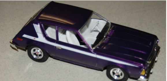
1975 Gremlin, with the six cylinder