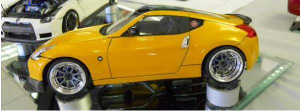
Nissan 350Z, a gold award winner