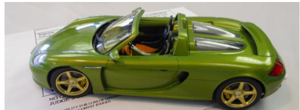
Tamiya Porsche Carrera GT

GTR was there, with a Club Display. We also had a club table in the vendor room