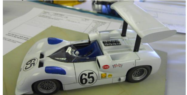
Resin Chaparral 2F, a silver award winner