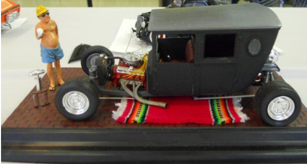
Yours truly was honored to win the Bob Urry Memorial Rat Rod Award for this Monogram Tijuana Rat Rod, converted from the Tijuana Taxi kit.