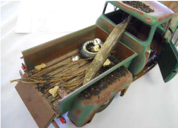
This beater 56 Ford pickup featured lots of realistic weathering. It won a Gold award, also Best in Automotive and overall Judge's Choice awards as well. GTR sponsored the Best Automotive trophy.