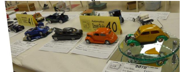
Street Rod class table