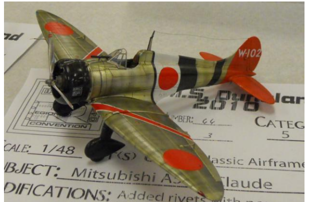
A Mitsubishi Claude