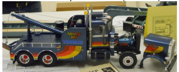
Commercial/Trucks class winner