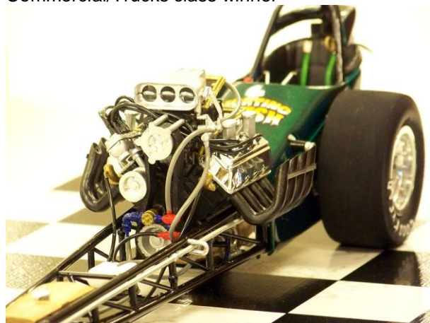
Large Scale class winner

One interesting aspect of these IPMS shows is the variety of models. While most of the readers of this are car guys, there is a lot to admire in other modeling genres. I especially like the figures and dioramas since I occasionally dabble in these and I can pick up some ideas and techniques. Fine Scale Modeler was on hand to take some photos.