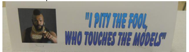
A word of warning!

Thanks to IPMS/Duneland for their efforts putting on this show!