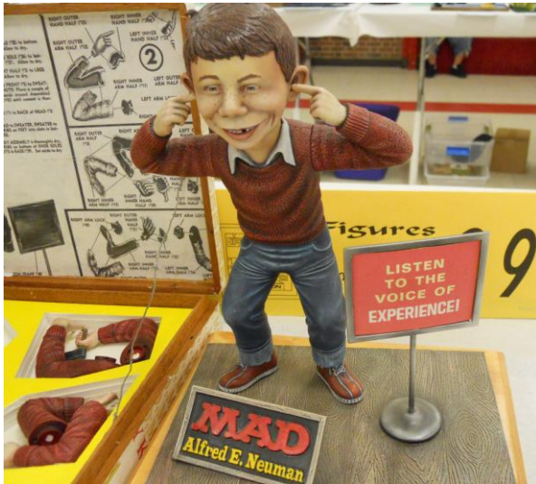
Alfred E Newman