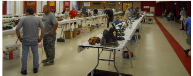
The contest room was large and well lit.