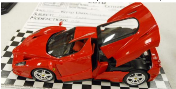
Out of the Box Class winner (Ferrari Enzo)