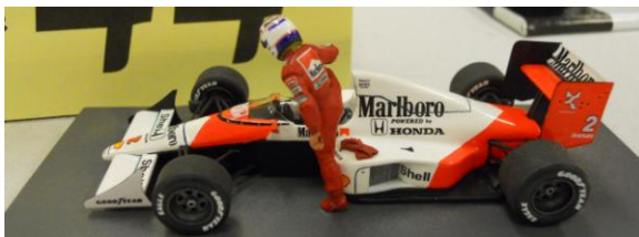
Small Scale Class winner (1/43 McLaren F1)