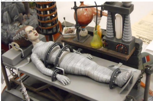
Bride of Frankenstein