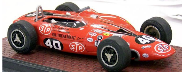
Open Wheel Comp (sponsored by GTR) class winner (STP Turbine)

This annual event, which moves throughout the region, is an all category event along with a swap meet. While most of the vendors focused on military subjects, there were some automotive kits available, including one vendor with virtually every current car kit out. Also there were paints and tools available. There were approximately 400 entries for all types of models. There were 13 Automotive classes. I would estimate about 60-70 automotive entries. Pictures of some of the auto class winners are below. One special trophy was for Best 60's Subject, this was won by a nice build up of the Modelers Chaparral 2D and is pictured on the cover.