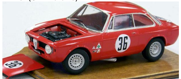
Closed Wheel Comp class winner (1966 Alfa)