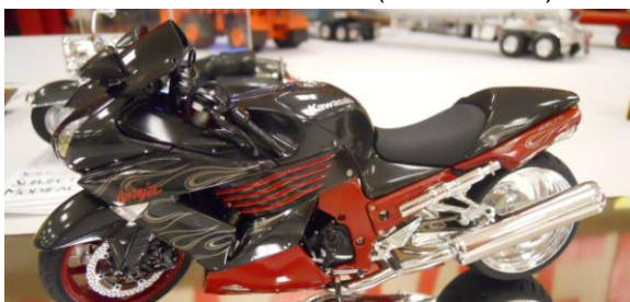
Motorcycle class winner