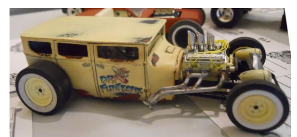
Another Rat Rod, "in the weeds"