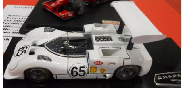
Small scale Chaparral Can-am