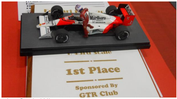
1/43 Scale Winner