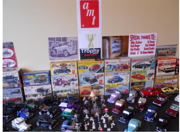
A nice display of AMT Trophy Series models.