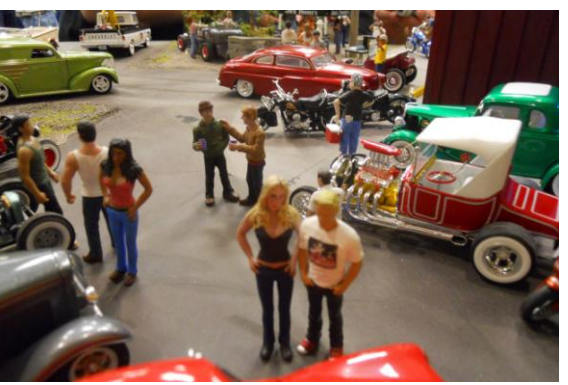
The Winnebago Area Scale Modelers (WAM) display again won the Best Club Display award,