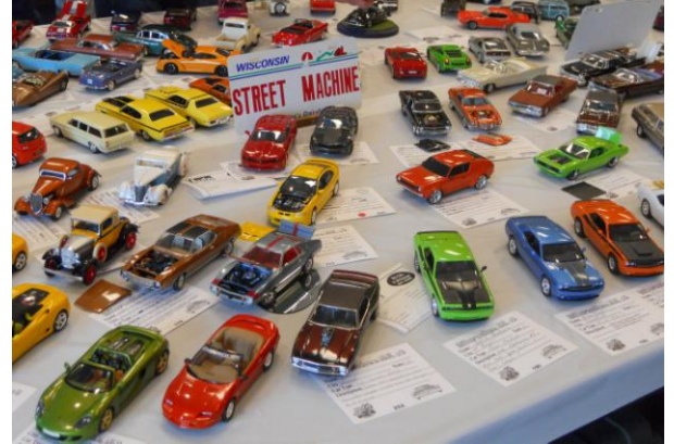
Crowed display table for Street Rods.