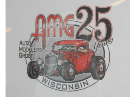
AMG is celebrating 25 years as a club.