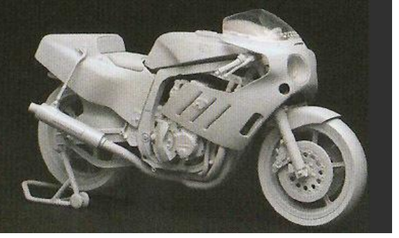
And Fujimi is issuing a new 1/12 motorcycle, the Suzuki GSX-R750, 1986 TF-F1 version