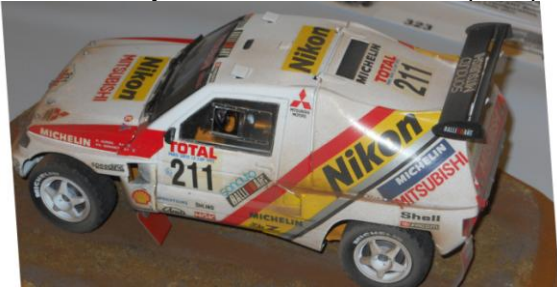
Mitsubishi Dakar Rally racer