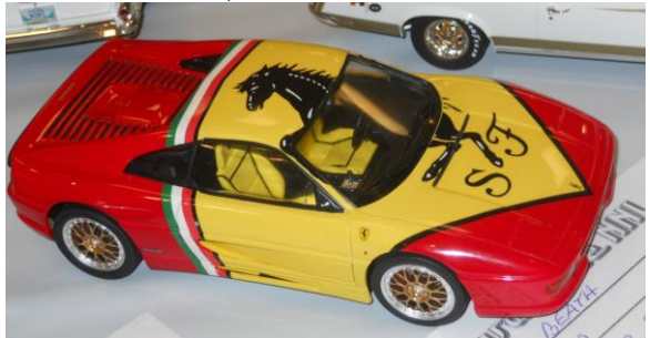
Ferraris: a 348 above, a 430 below.