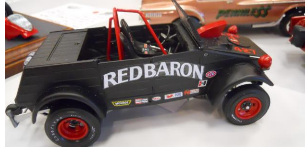
Kubelwagen Drag racer.

Revell had a display of their upcoming kits, several clubs had display tables and there was a raffle. It was good to see some old modeling buddies, also some new ones. Another good show by AMG. The date for 2011 is April 9.