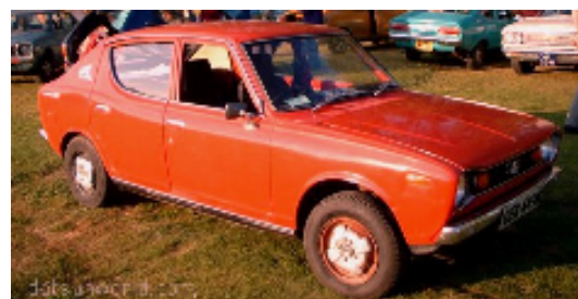
A stock 1971 four-door