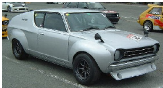
A racing Cherry – really big flares!