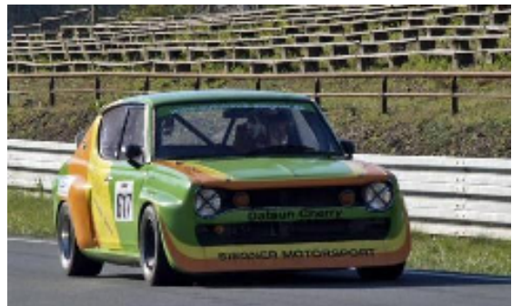
Another road racer