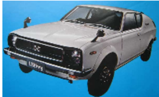
A stock X-1-R

Below are some photos of Cherrys from the web.