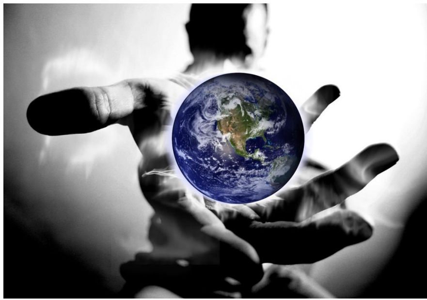
Collectively, we've gone back to what I like to refer to as the village mindset. There used to be a time before the internet, a time even before the

It shouldn't be an epiphany when I state that the two most powerful forms of advertising are