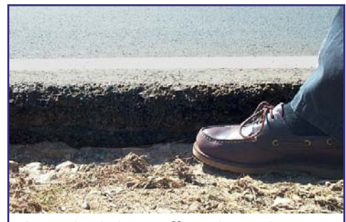
A vertical drop off such as the one shown in this photo is estimated at about 4-5 inches, which is considered a hazard if a driver's vehicle slips off the pavement and onto an unpaved shoulder.

There's a relatively easy and inexpensive countermeasure to PEDO. It's called the Safety Edge,