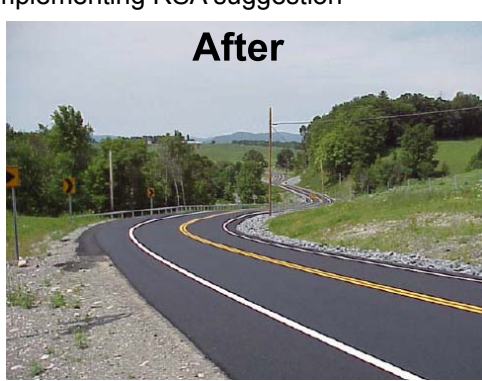
Roadside & visibility improvements; guardrail and delineation improved

RSAs and training courses have been conducted in two tribal areas (i.e., Navajo and Tohono O'Odham Nation). For the Navajo session, a Navajo Bureau of Indian Affairs representative from New Mexico was so impressed with the training that he intends to work with the New Mexico Division office on scheduling an RSA on a roadway in Navajo, NM. There also was an RSA presentation at the ITS Arizona Annual Conference.