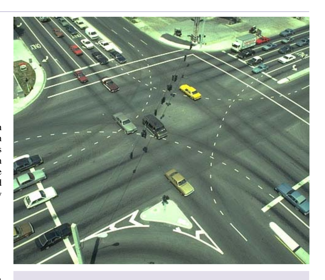
It is estimated that there are around 3 million intersections in this country, with 300,000 being signalized.