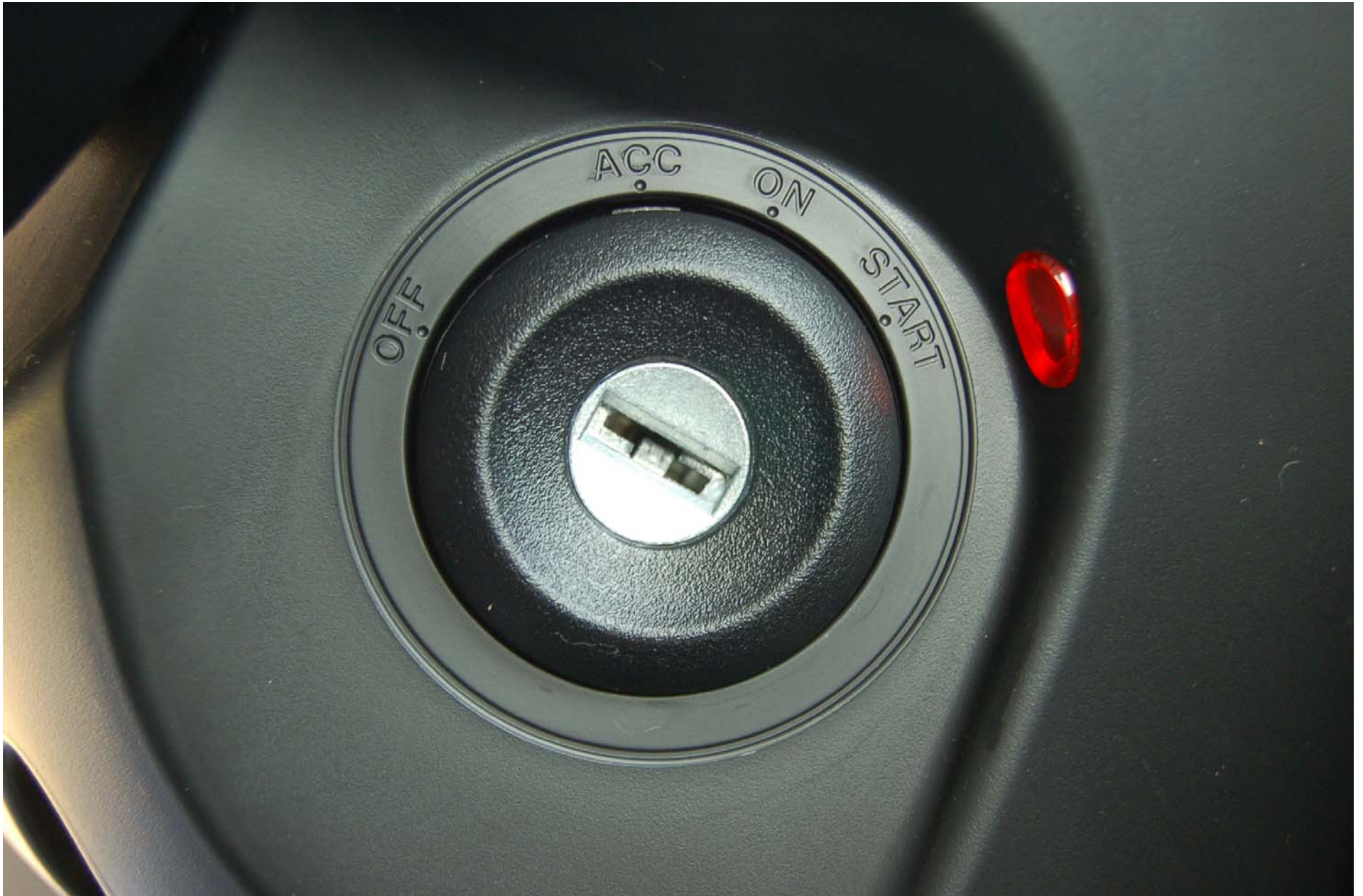
2012 MAZDA 5 SPORT MT NHTSA NO. CC5400 FMVSS NO. 114