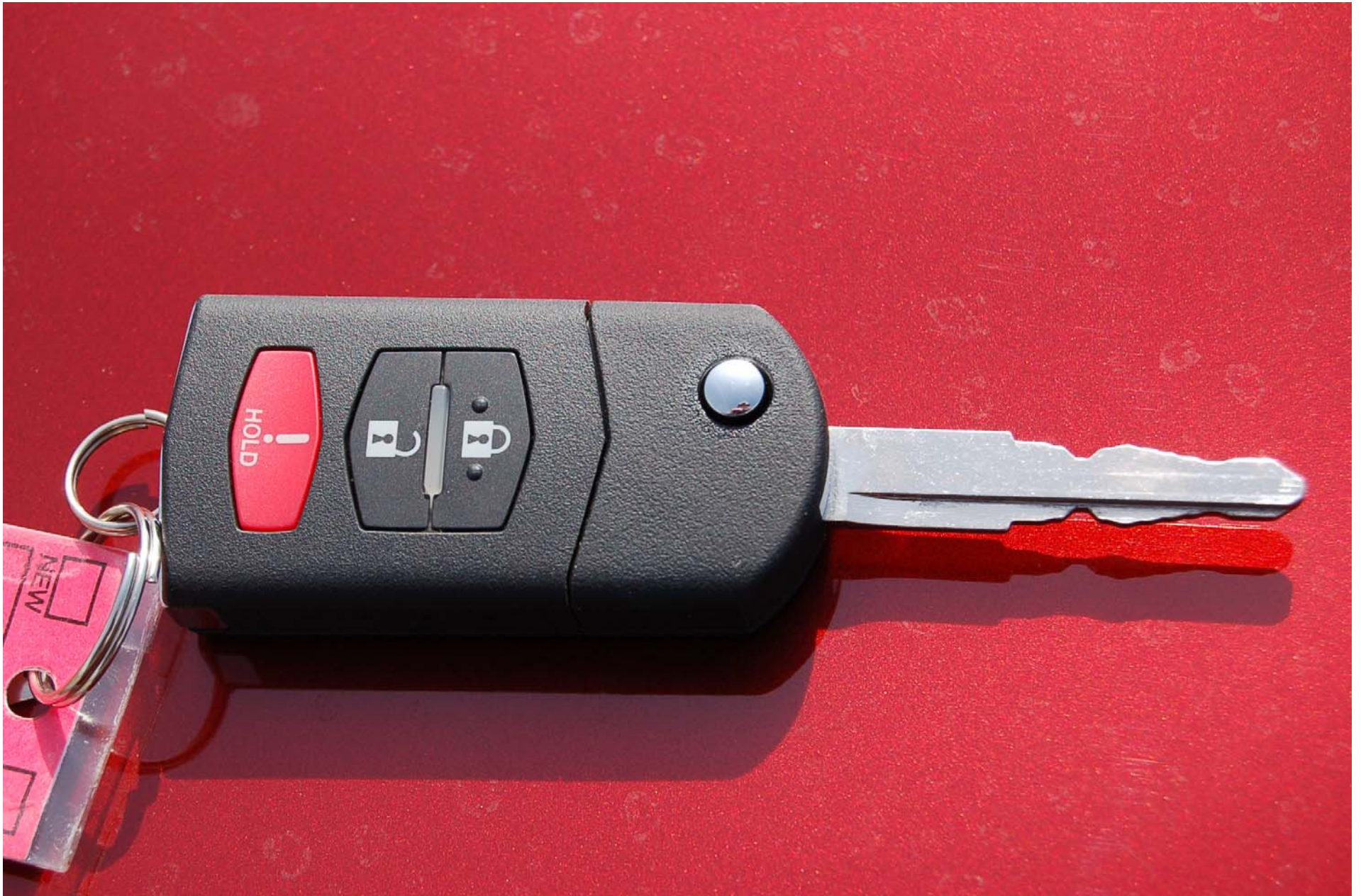
2012 MAZDA 5 SPORT MT NHTSA NO. CC5400 FMVSS NO. 114