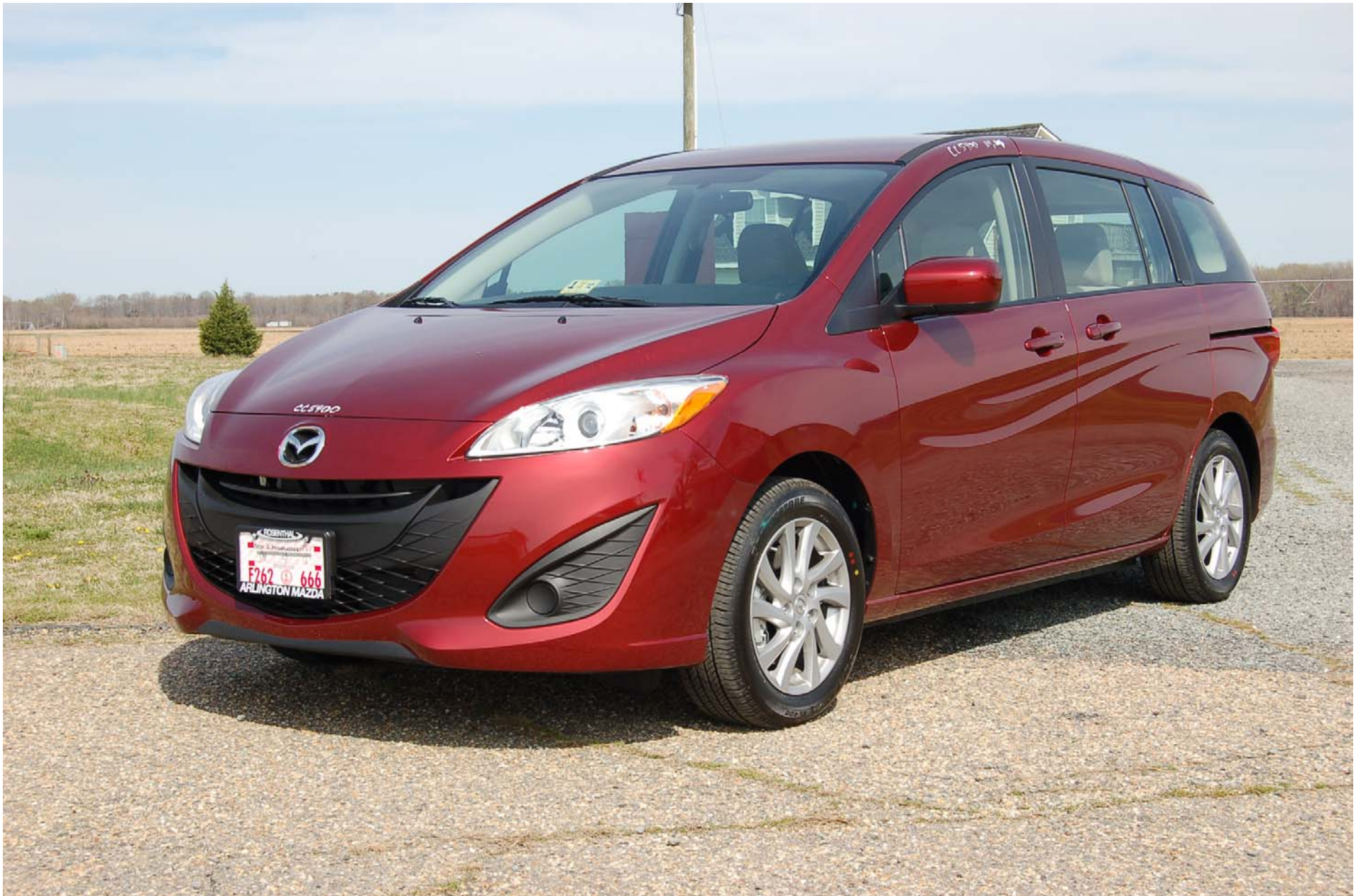
2012 MAZDA 5 SPORT MT NHTSA NO. CC5400 FMVSS NO. 114