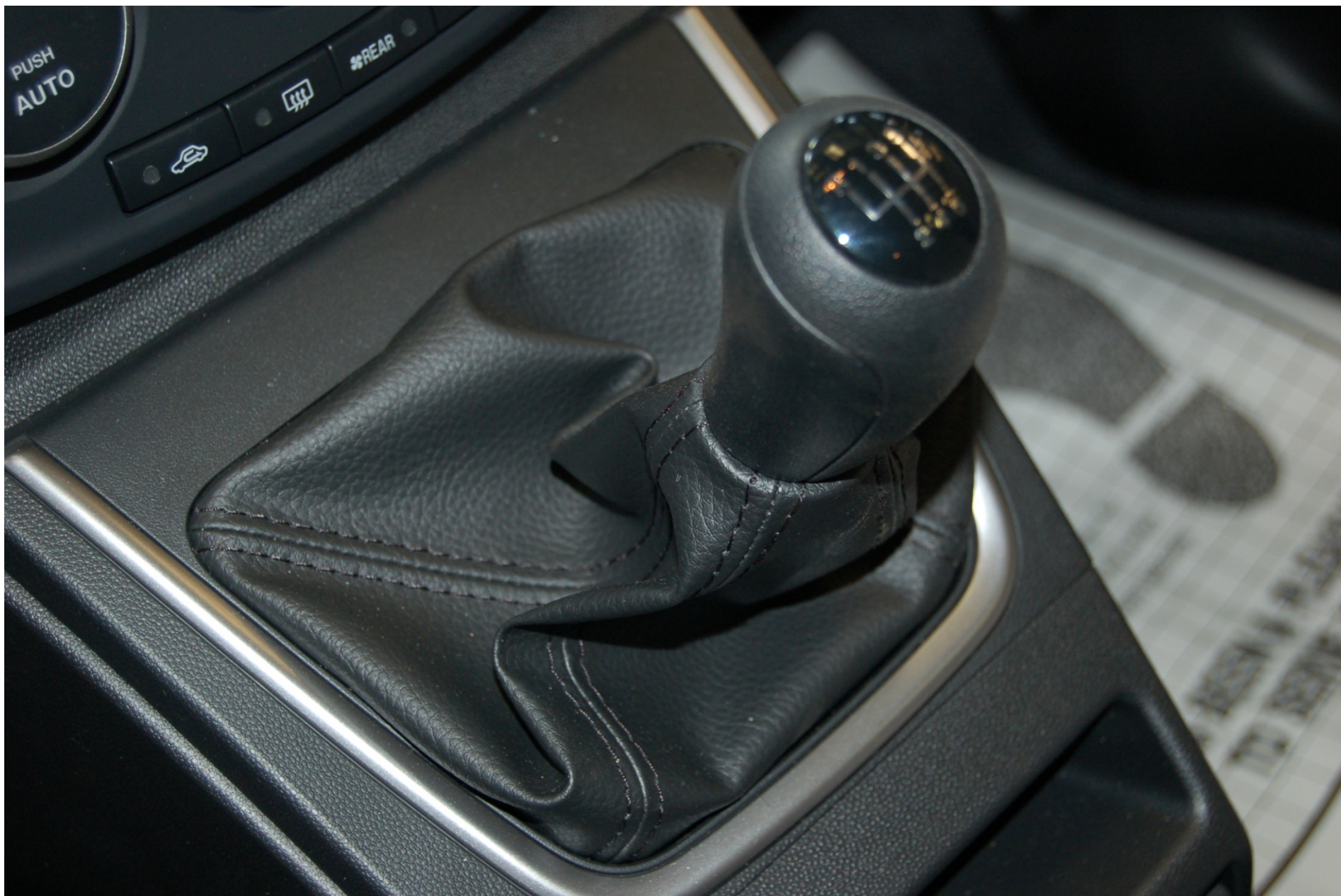
2012 MAZDA 5 SPORT MT NHTSA NO. CC5400 FMVSS NO. 114