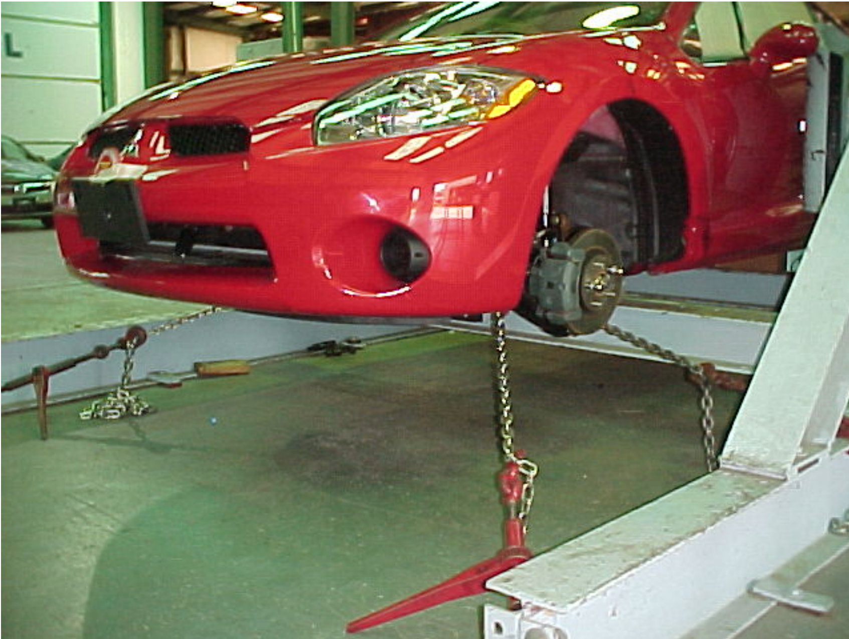
2006 MITSUBISHI ECLIPSE NHTSA NO. C65600 FMVSS NO. 214S