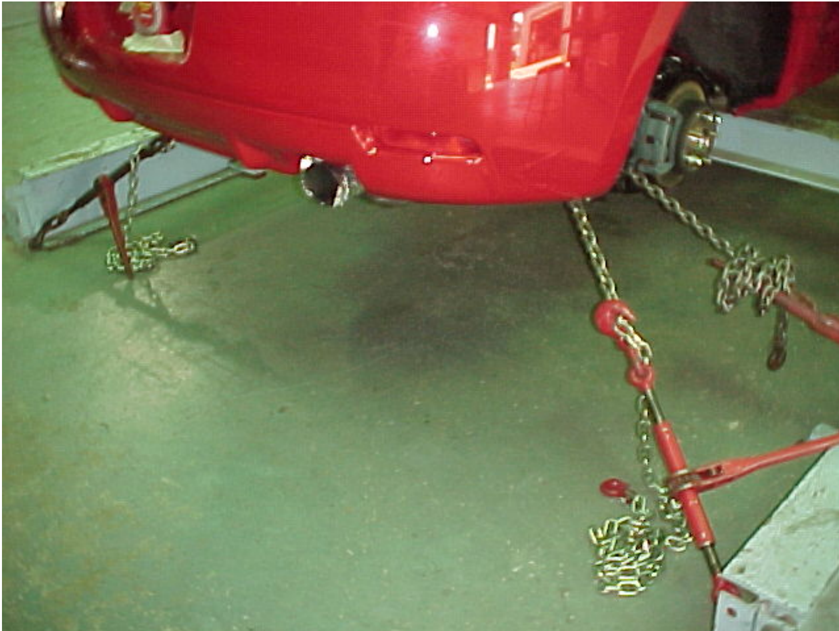
2006 MITSUBISHI ECLIPSE NHTSA NO. C65600 FMVSS NO. 214S