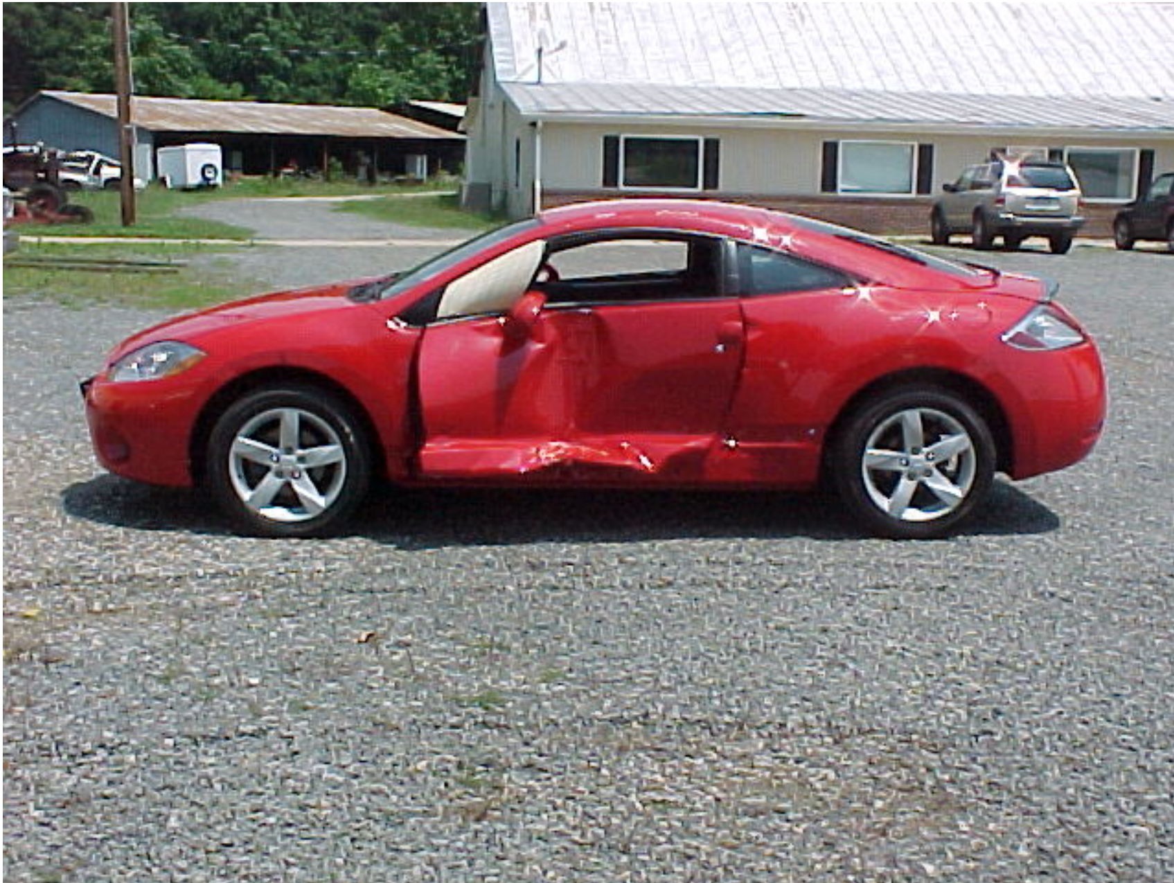
2006 MITSUBISHI ECLIPSE NHTSA NO. C65600