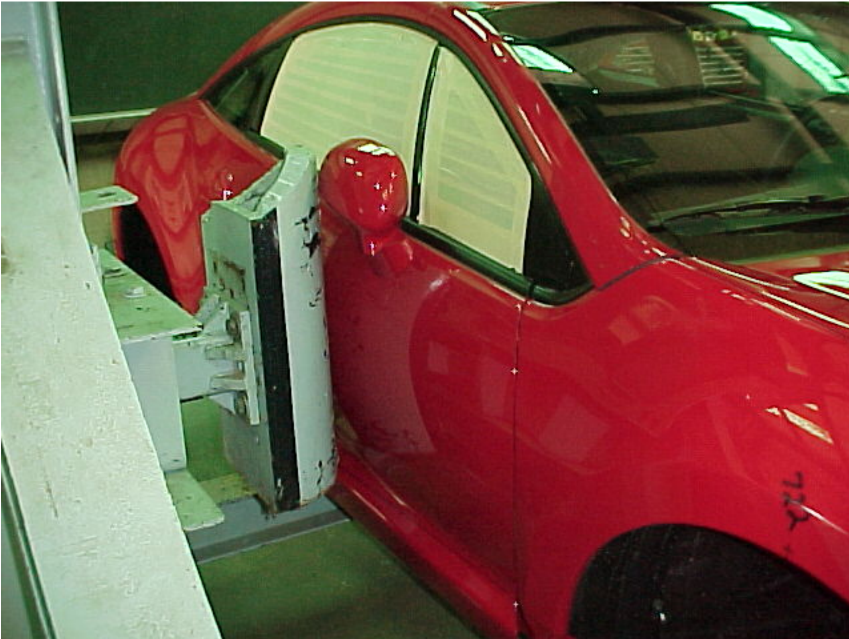
2006 MITSUBISHI ECLIPSE NHTSA NO. C65600 FMVSS NO. 214S