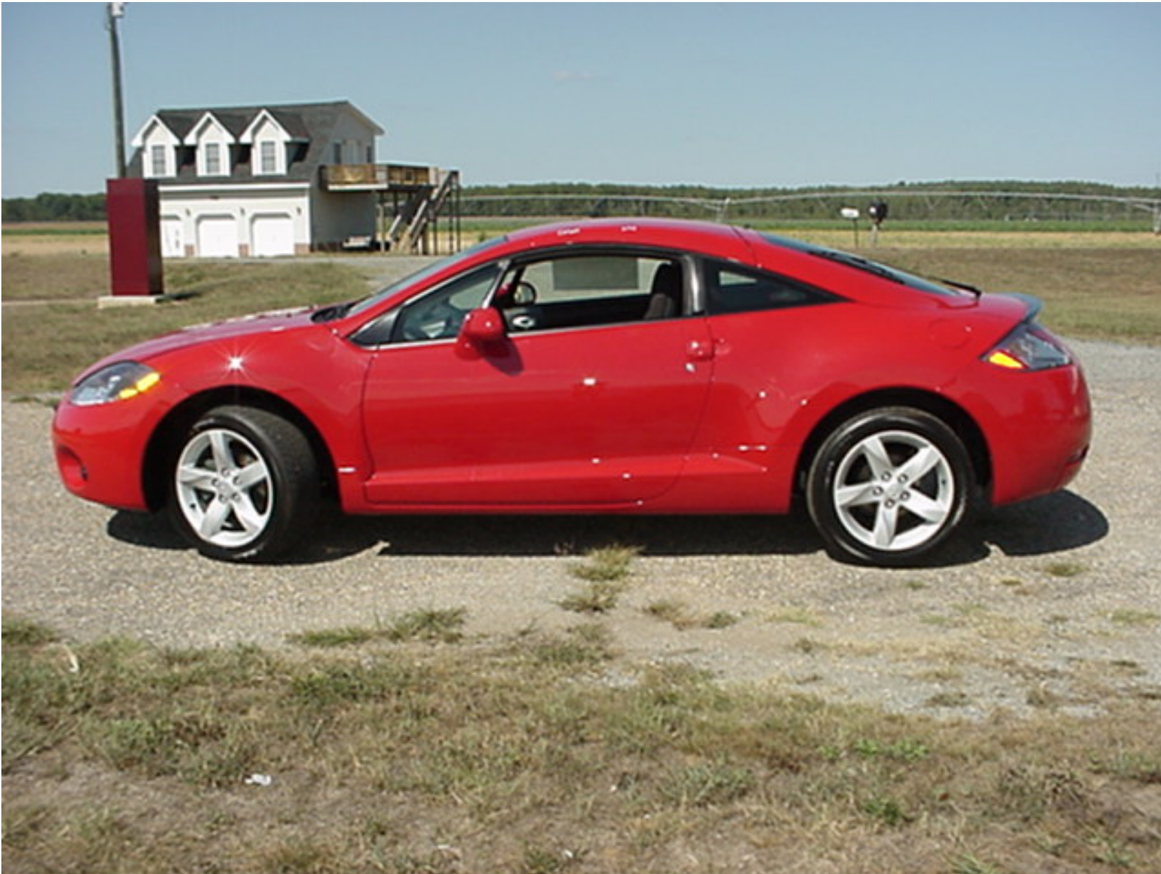
2006 MITSUBISHI ECLIPSE NHTSA NO. C65600 FMVSS NO. 214S