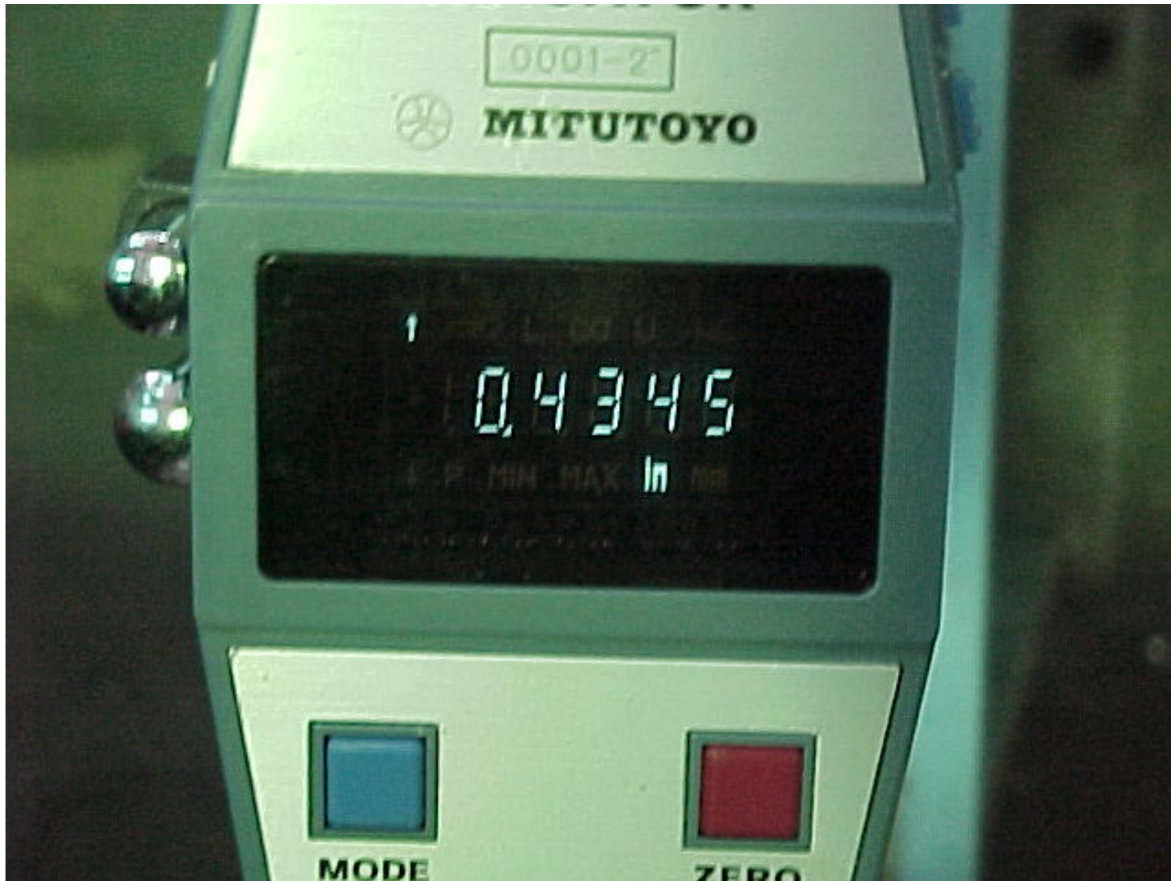
2006 MITSUBISHI ECLIPSE NHTSA NO. C65600 FMVSS NO. 214S