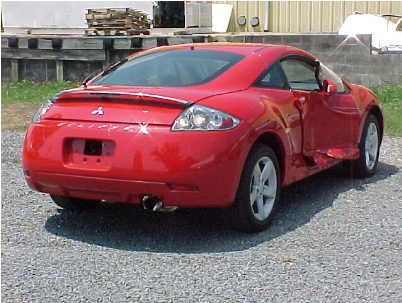
2006 MITSUBISHI ECLIPSE

¾ FRONTAL VIEW FROM LEFT SIDE OF VEHICLE POST TEST