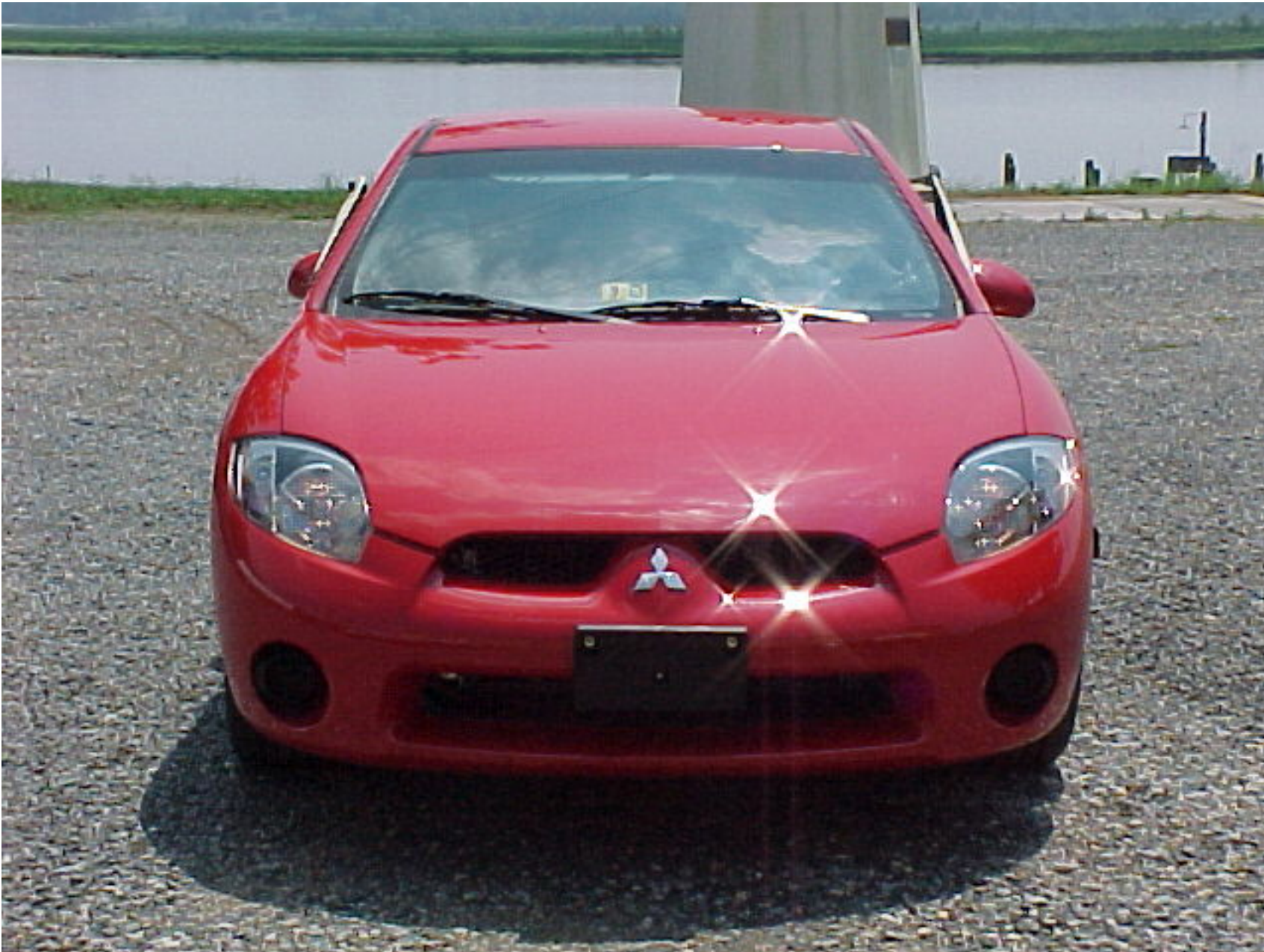
2006 MITSUBISHI ECLIPSE NHTSA NO. C65600 FMVSS NO. 214S