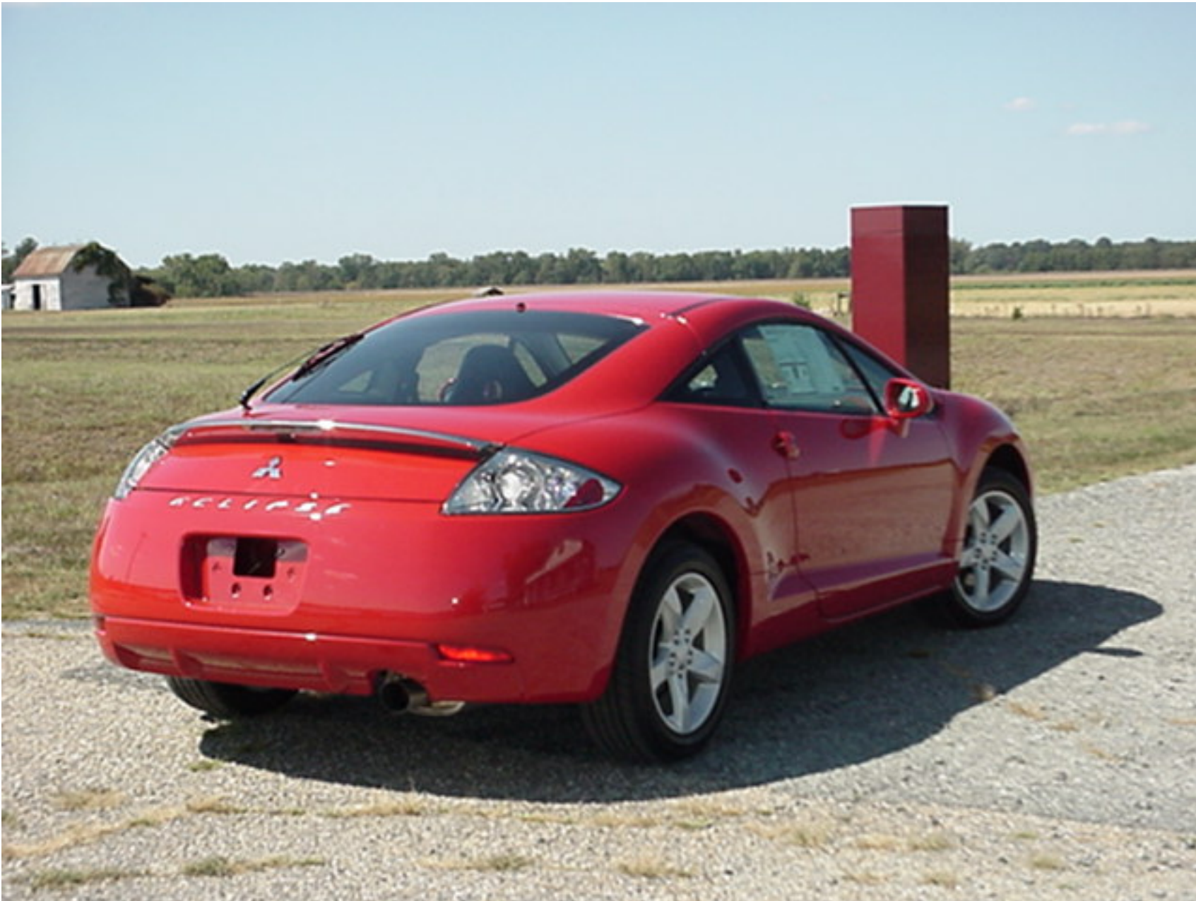
2006 MITSUBISHI ECLIPSE NHTSA NO. C65600 FMVSS NO. 214S