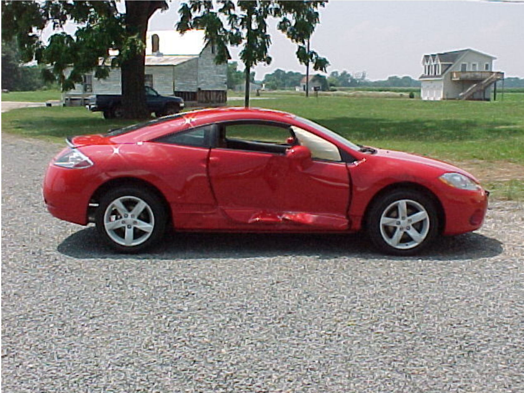
2006 MITSUBISHI ECLIPSE NHTSA NO. C65600