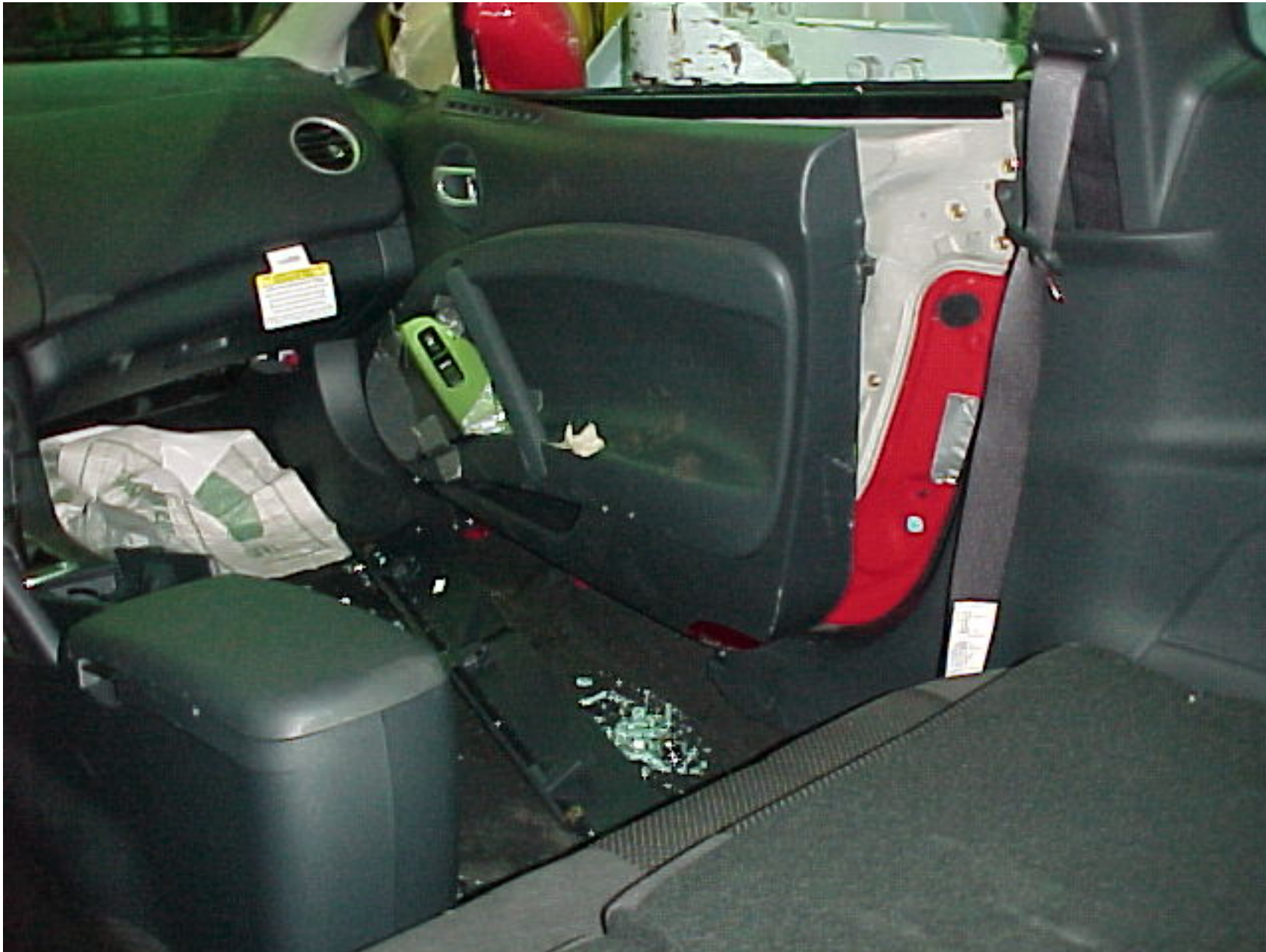
2006 MITSUBISHI ECLIPSE NHTSA NO. C65600 FMVSS NO. 214S