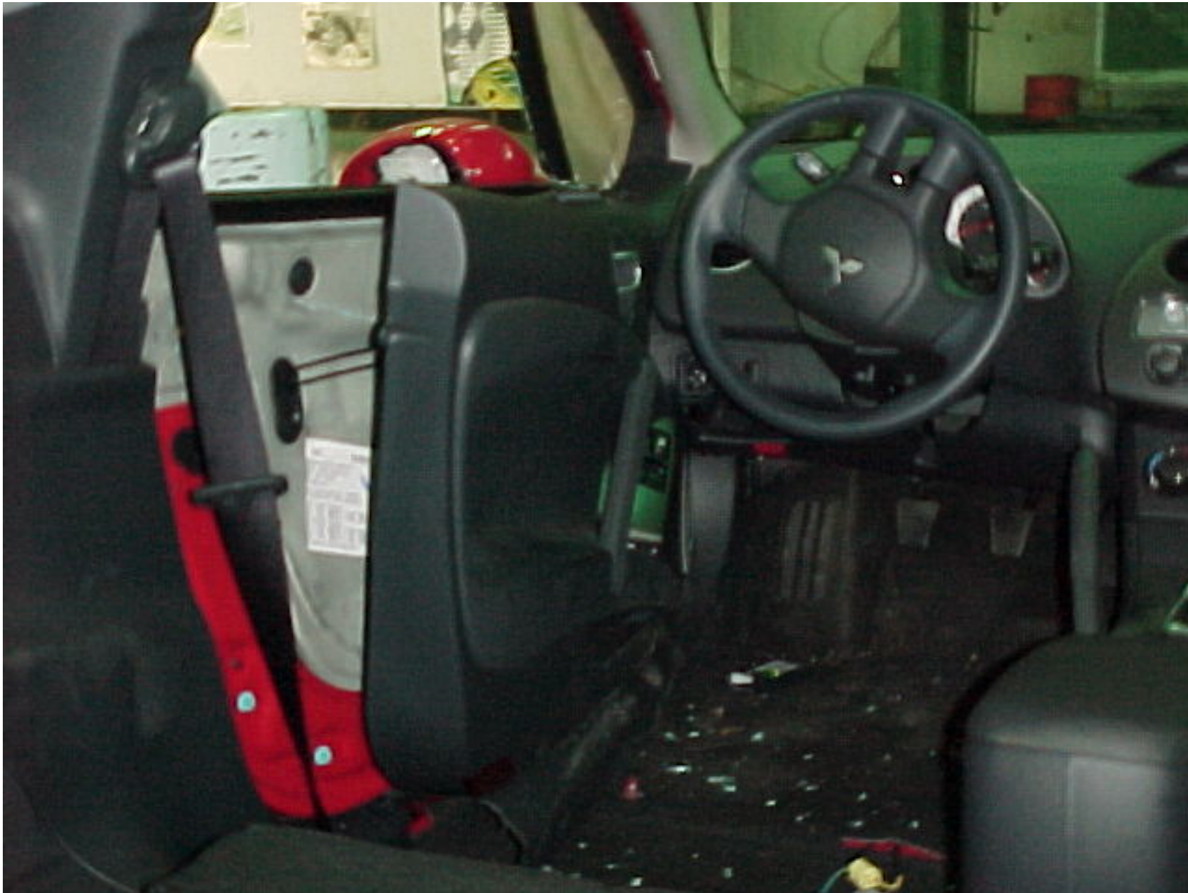
2006 MITSUBISHI ECLIPSE NHTSA NO. C65600 FMVSS NO. 214S