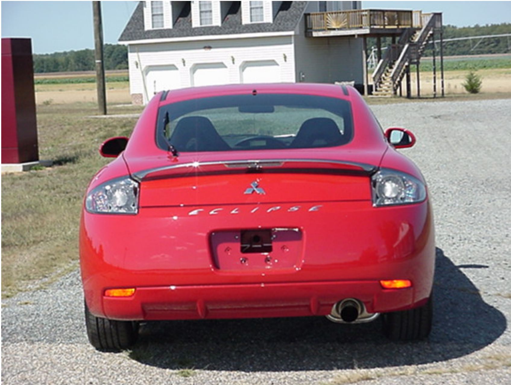
2006 MITSUBISHI ECLIPSE NHTSA NO. C65600 FMVSS NO. 214S