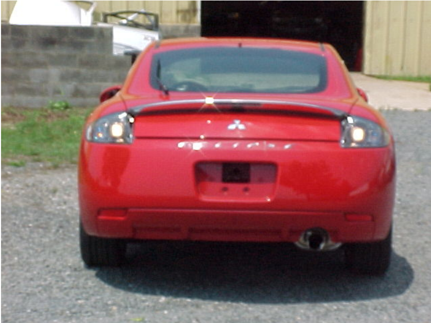
2006 MITSUBISHI ECLIPSE