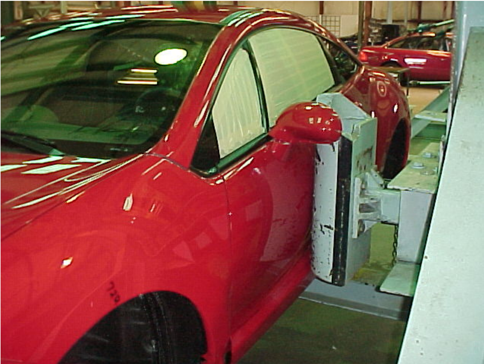
2006 MITSUBISHI ECLIPSE NHTSA NO. C65600 FMVSS NO. 214S