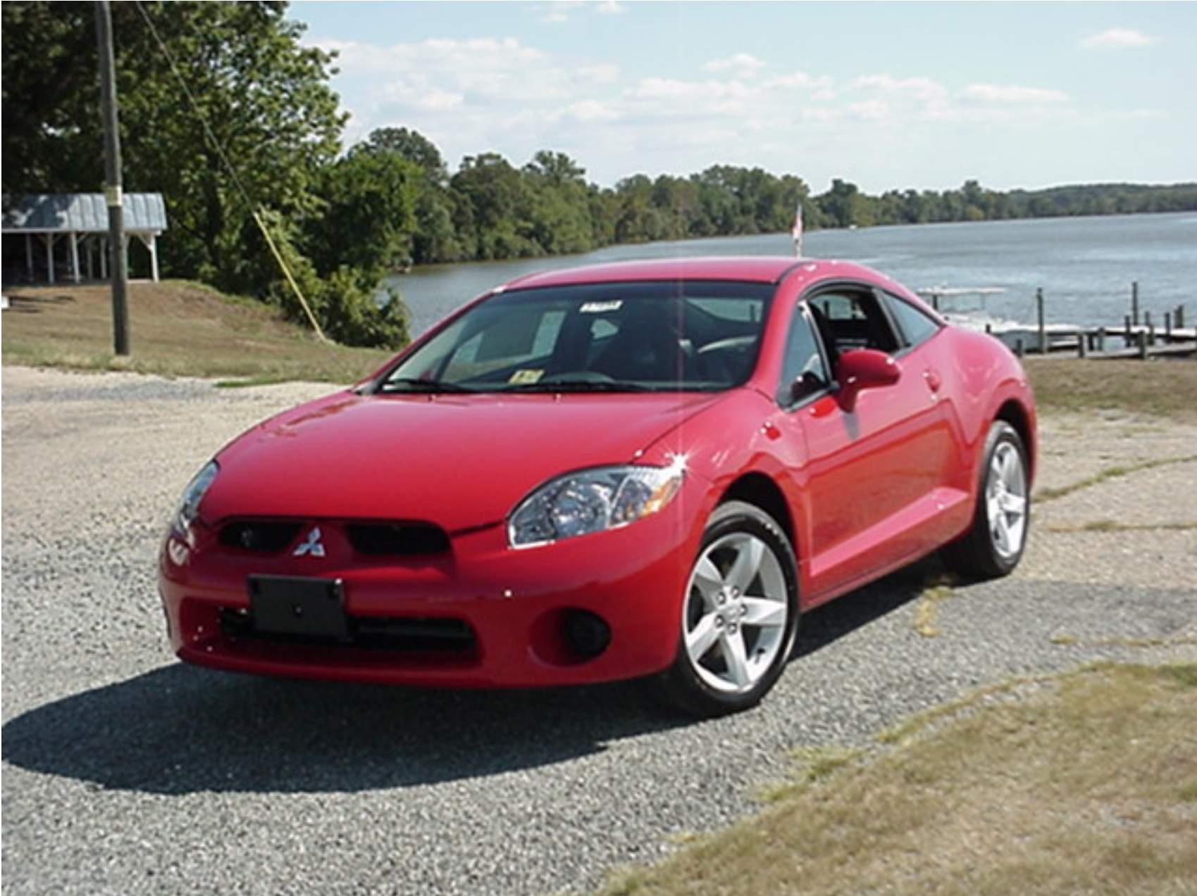
2006 MITSUBISHI ECLIPSE NHTSA NO. C65600 FMVSS NO. 214S