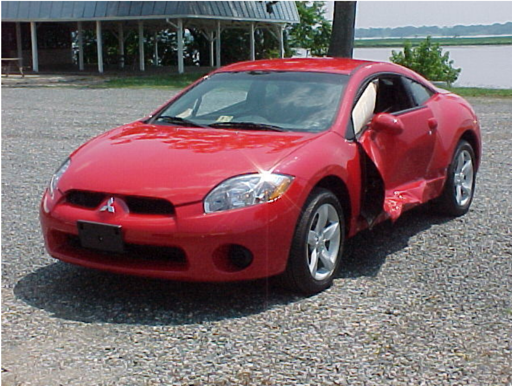
2006 MITSUBISHI ECLIPSE