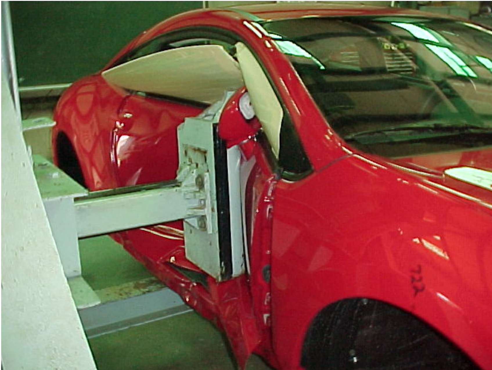
2006 MITSUBISHI ECLIPSE NHTSA NO. C65600 FMVSS NO. 214S