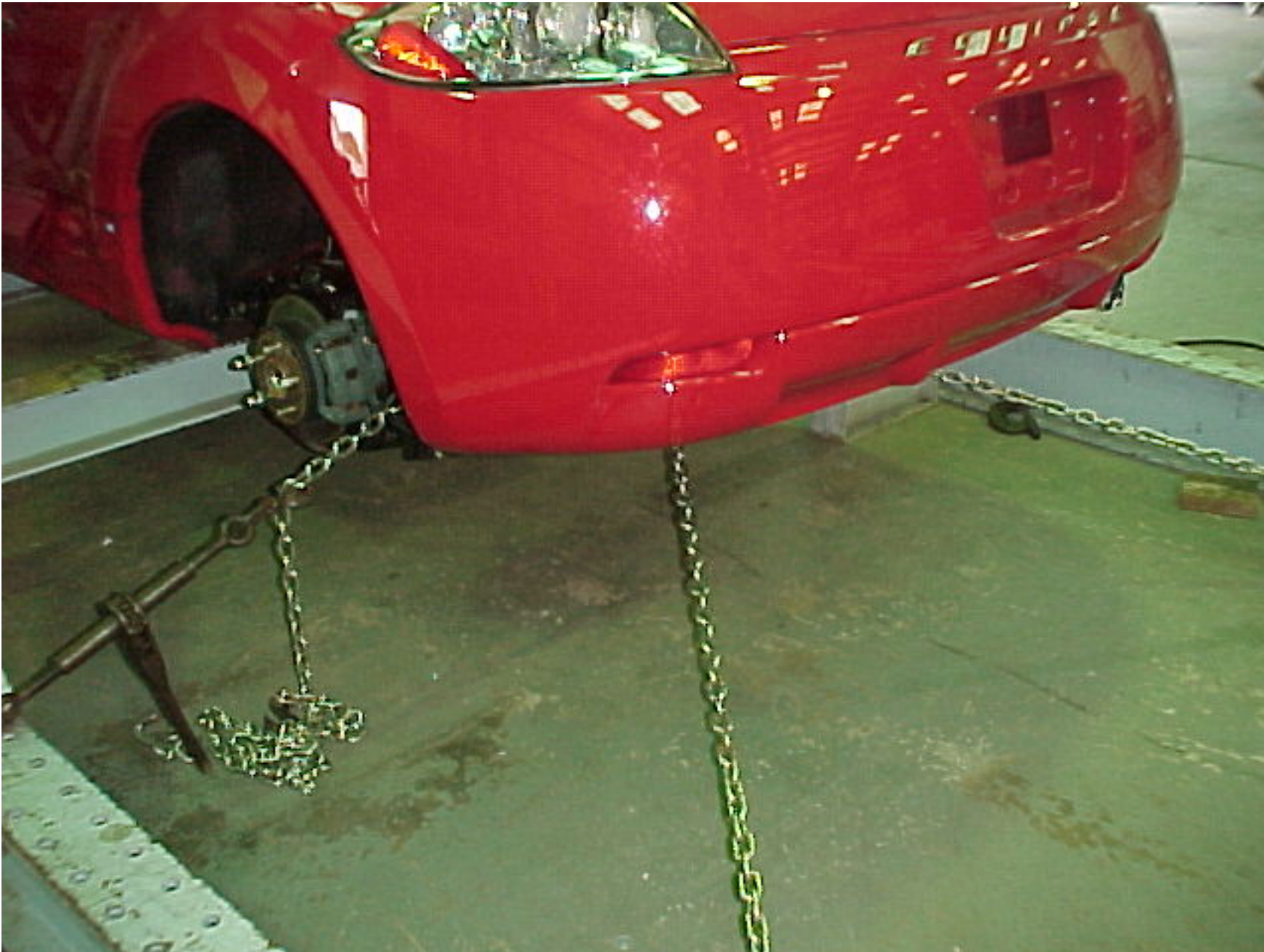
2006 MITSUBISHI ECLIPSE NHTSA NO. C65600 FMVSS NO. 214S