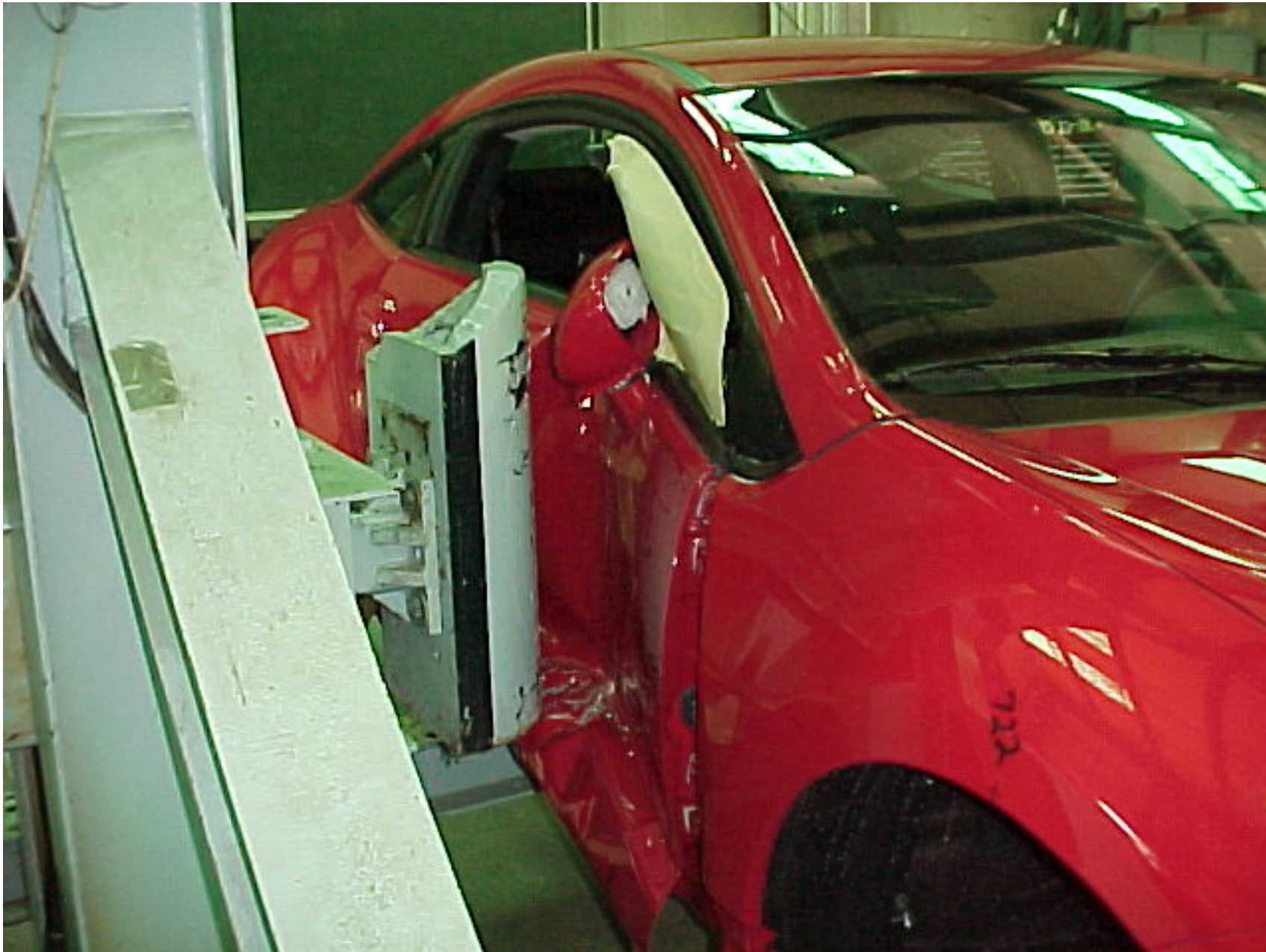
2006 MITSUBISHI ECLIPSE NHTSA NO. C65600 FMVSS NO. 214S