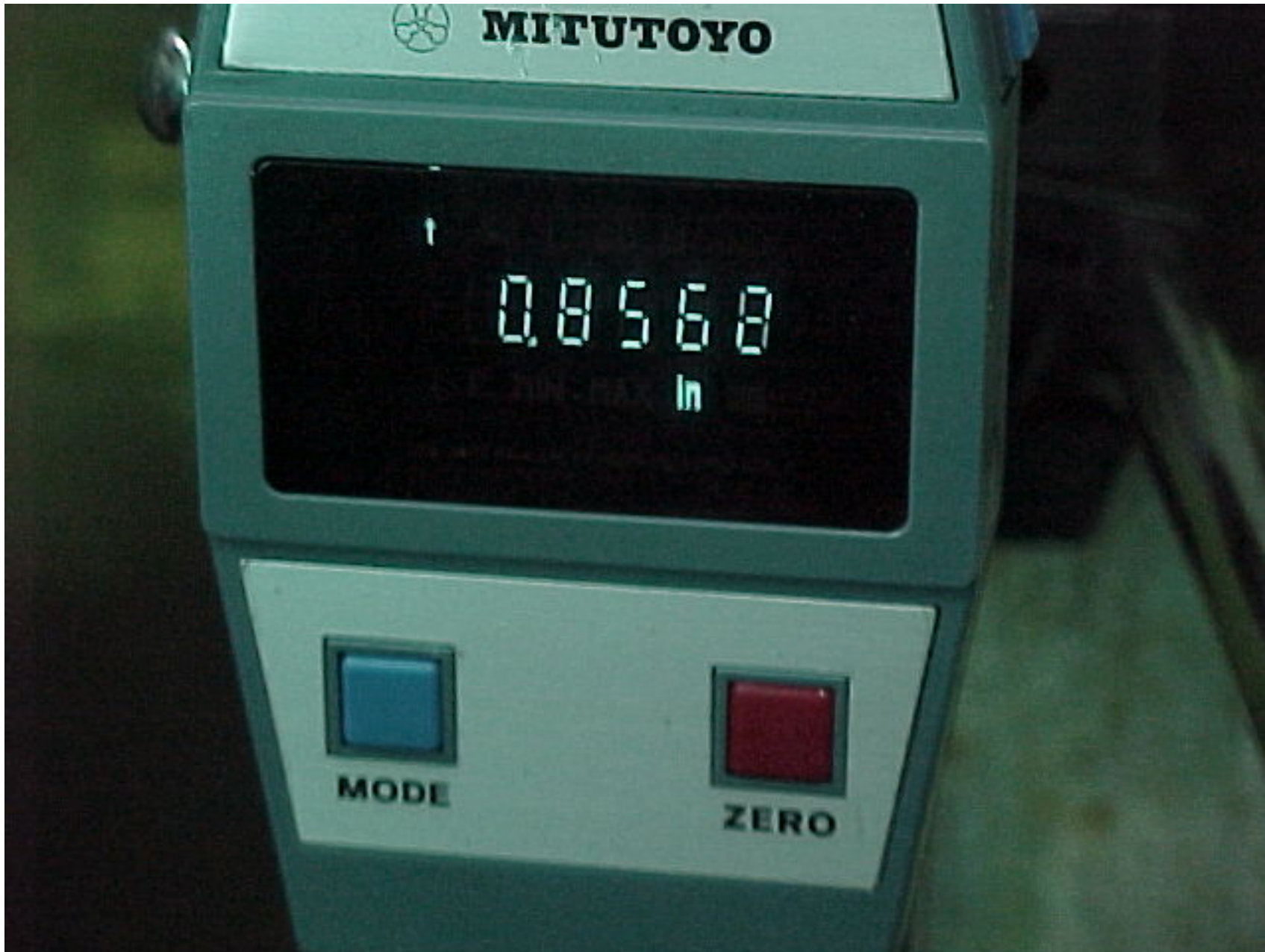
2006 MITSUBISHI ECLIPSE NHTSA NO. C65600 FMVSS NO. 214S