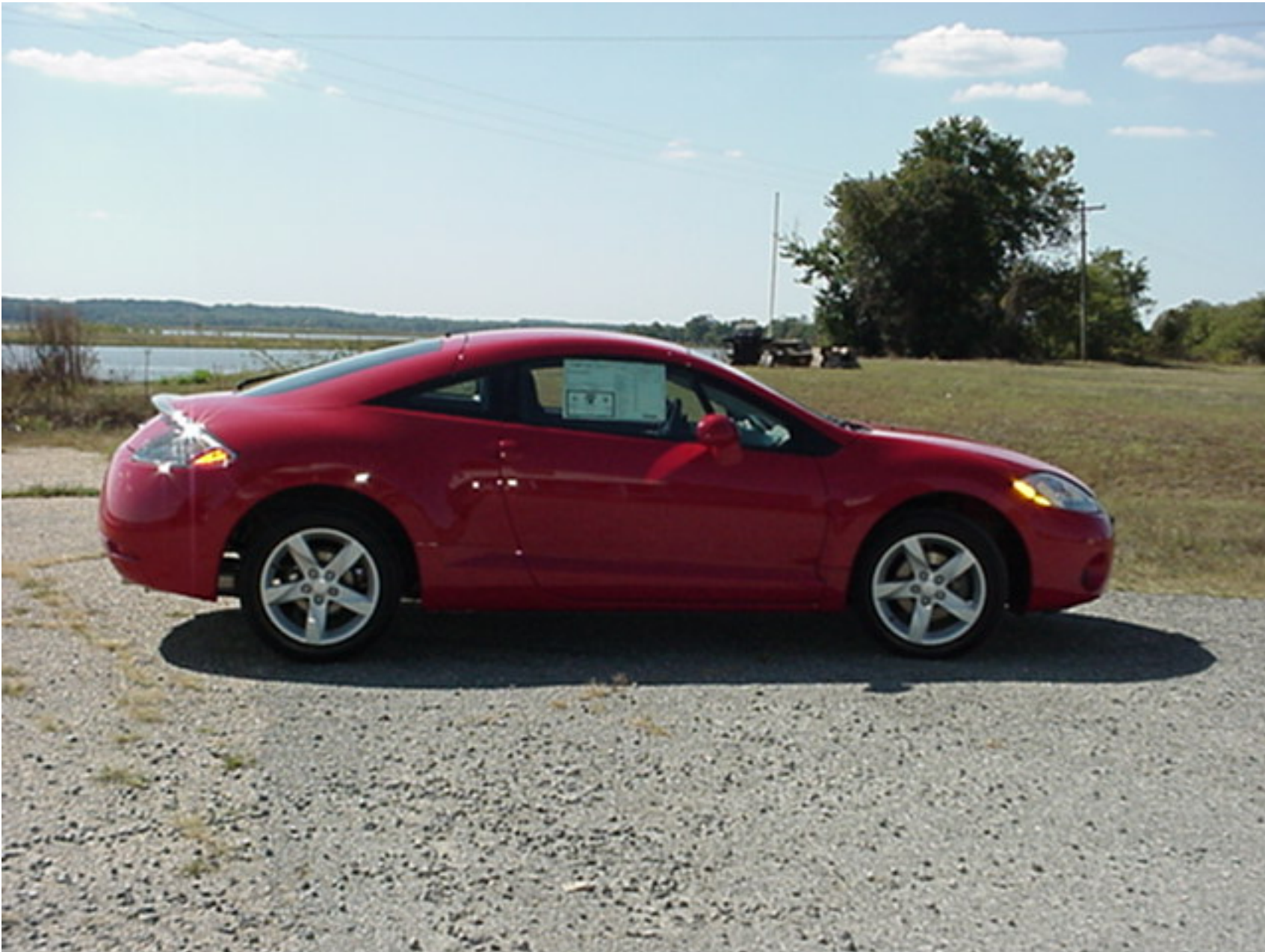
2006 MITSUBISHI ECLIPSE NHTSA NO. C65600 FMVSS NO. 214S