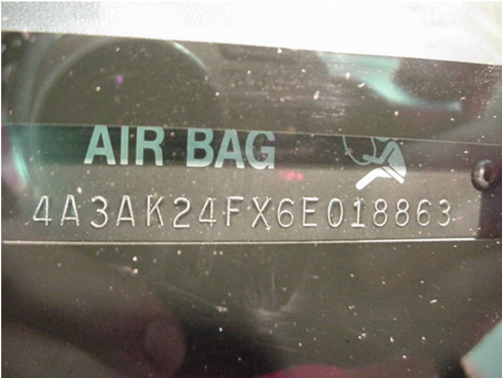
2006 MITSUBISHI ECLIPSE NHTSA NO. C65600 FMVSS NO. 214S