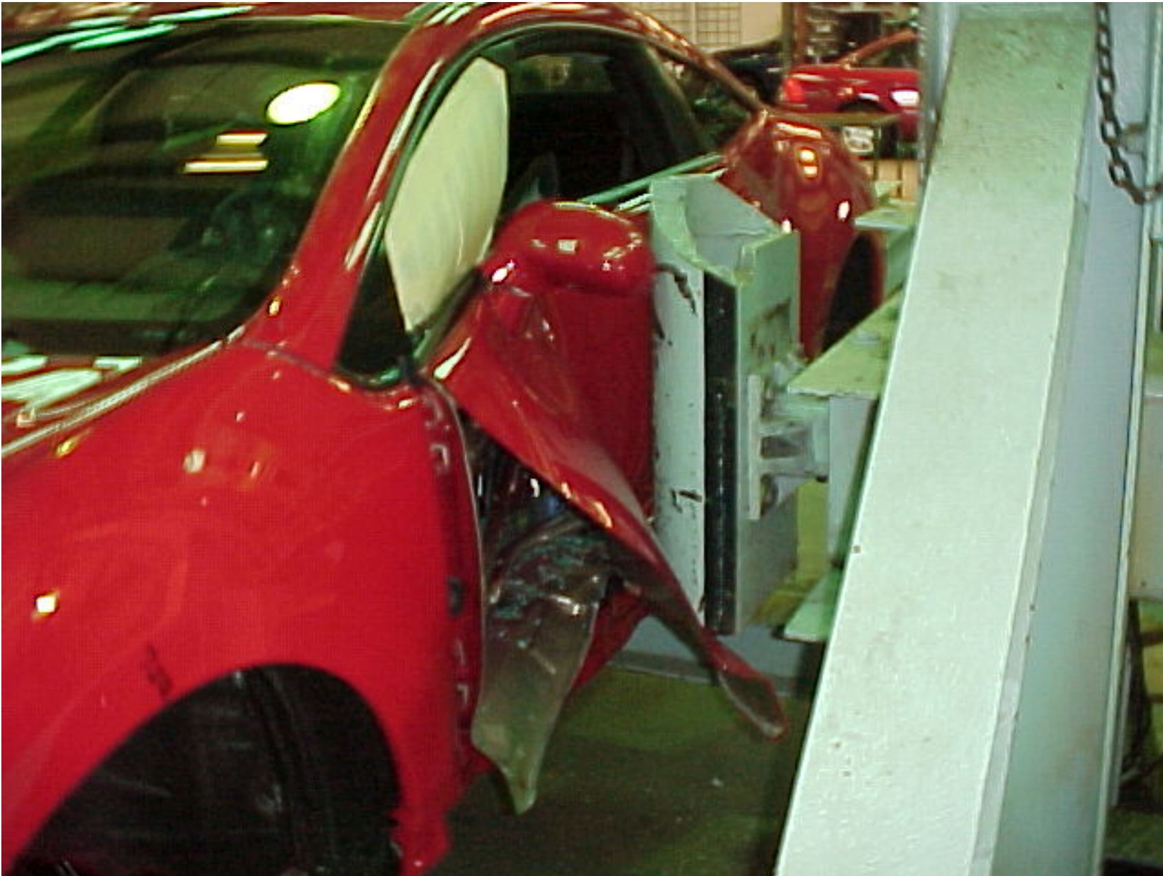
2006 MITSUBISHI ECLIPSE NHTSA NO. C65600 FMVSS NO. 214S