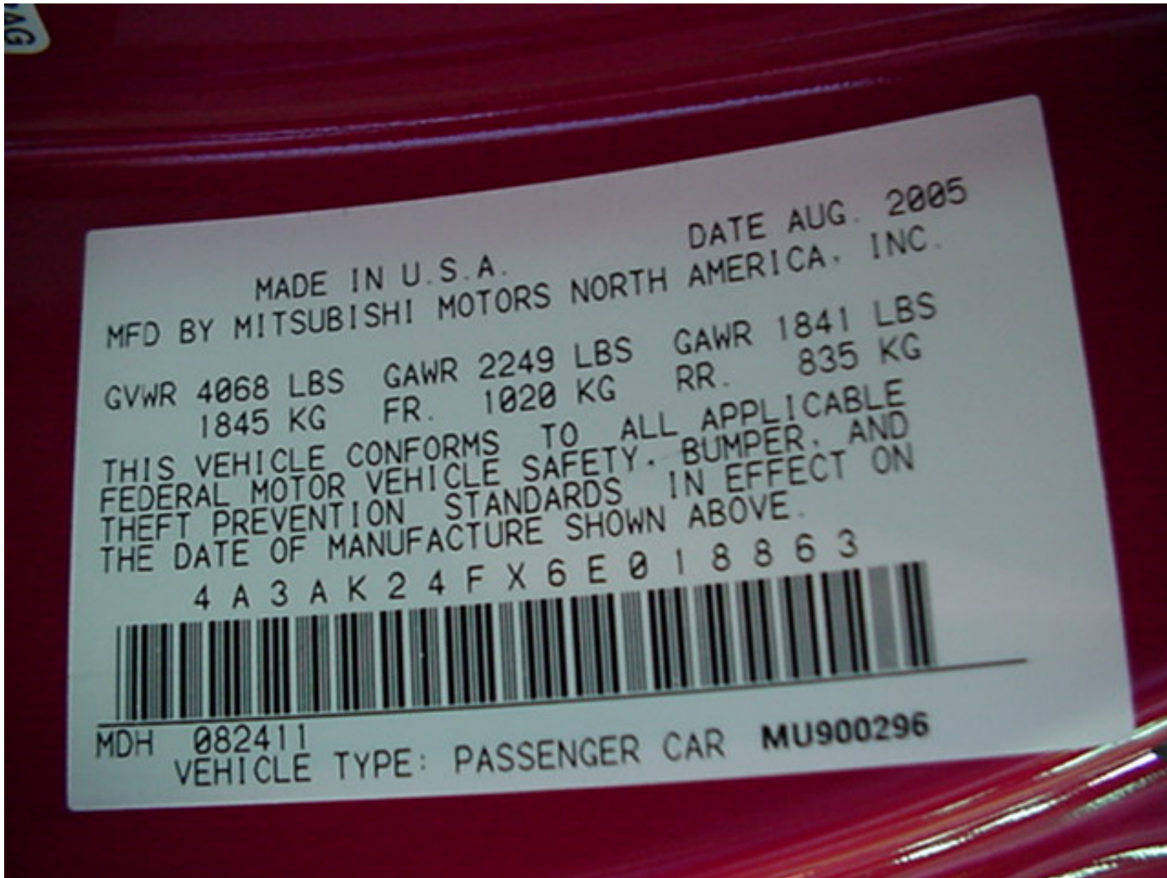
2006 MITSUBISHI ECLIPSE NHTSA NO. C65600 FMVSS NO. 214S