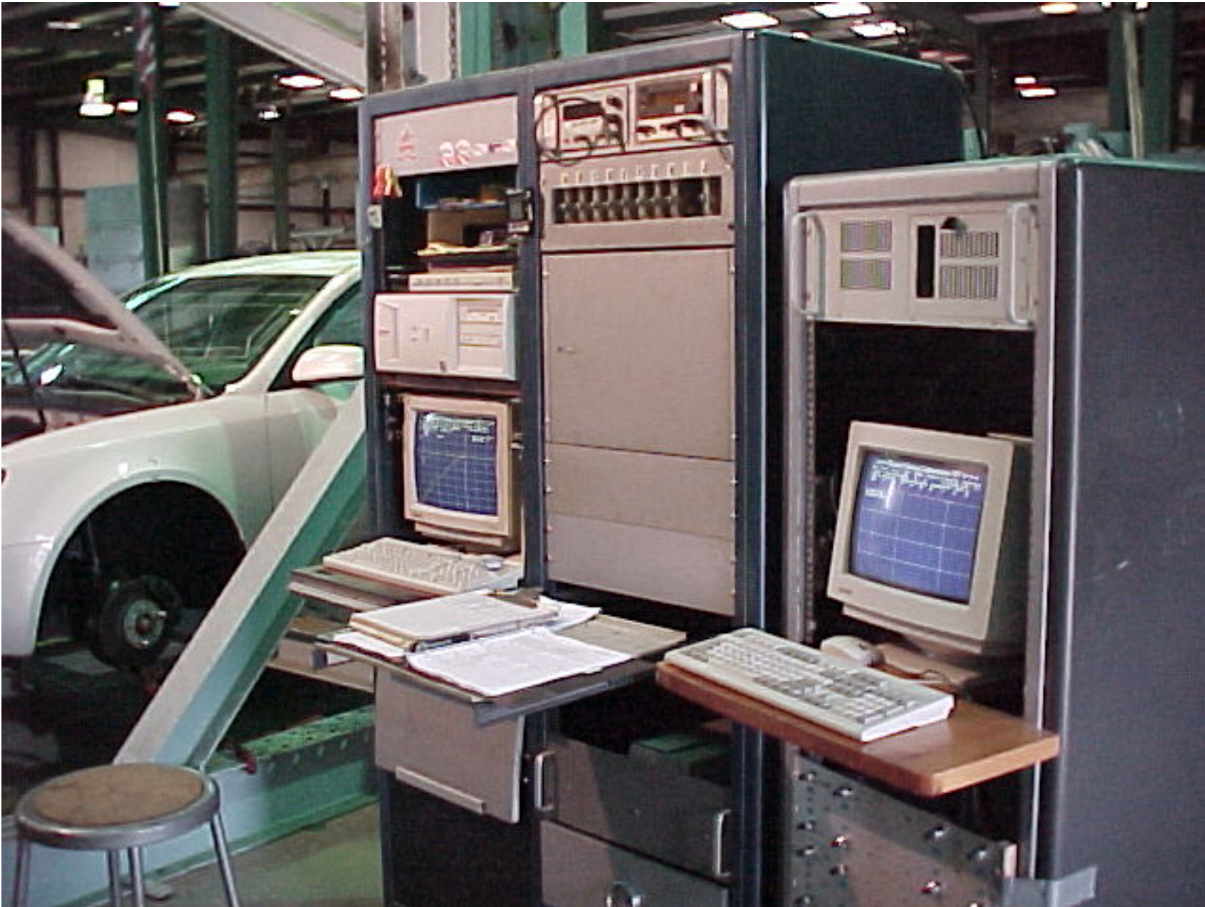
2006 HYUNDAI SONATA NHTSA NO. C60501 FMVSS NO. 214S