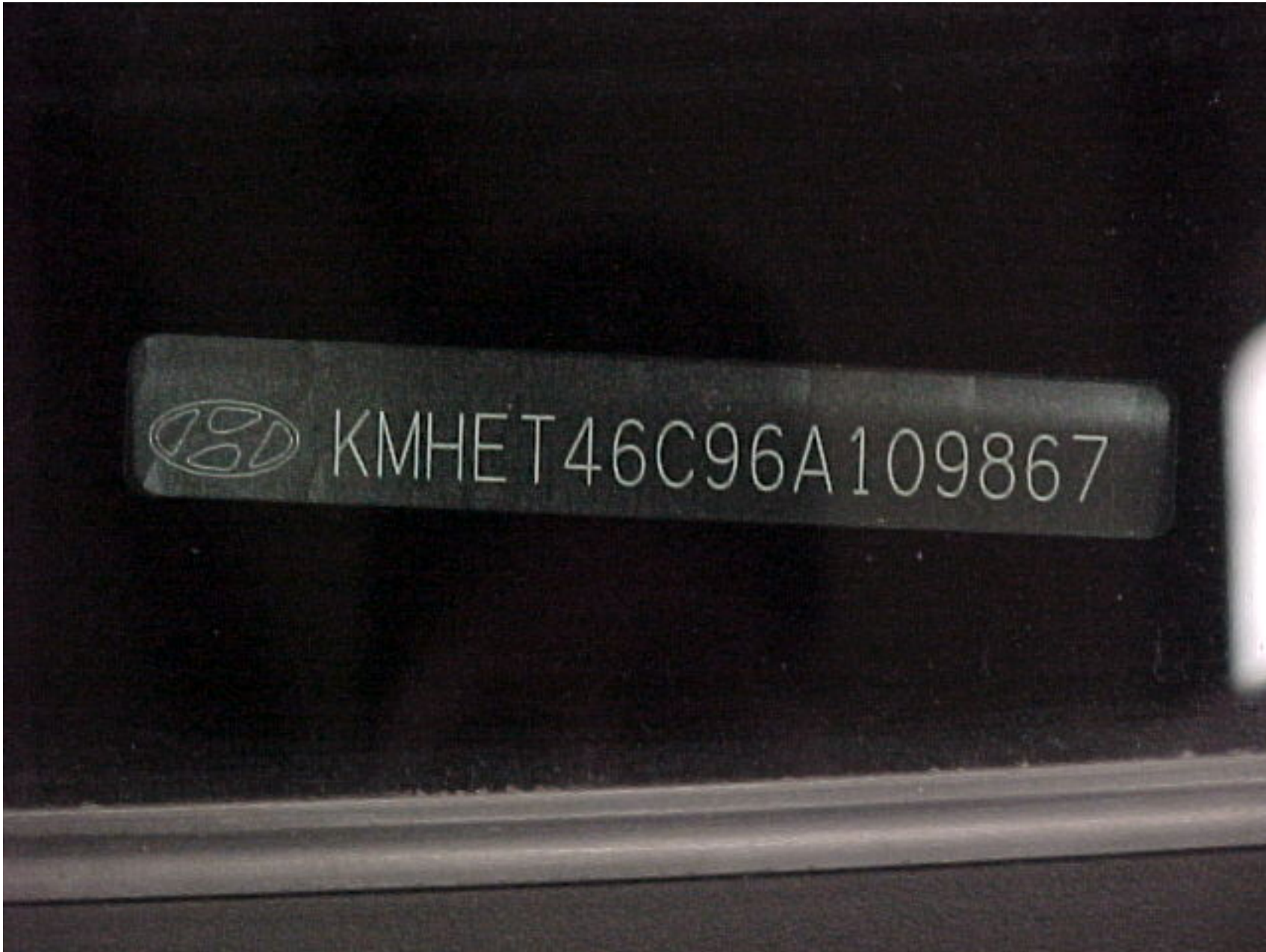
2006 HYUNDAI SONATA NHTSA NO. C60501 FMVSS NO. 214S