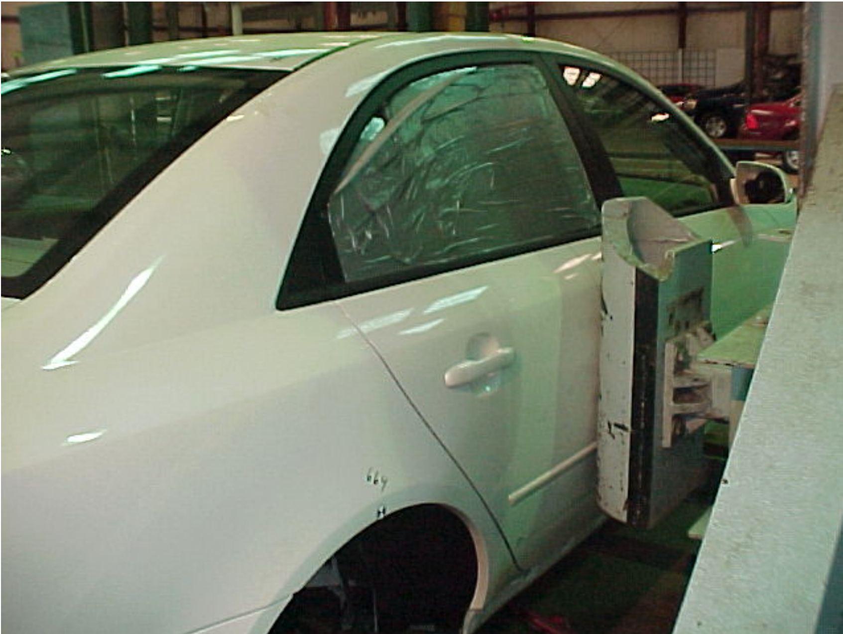
2006 HYUNDAI SONATA NHTSA NO. C60501 FMVSS NO. 214S