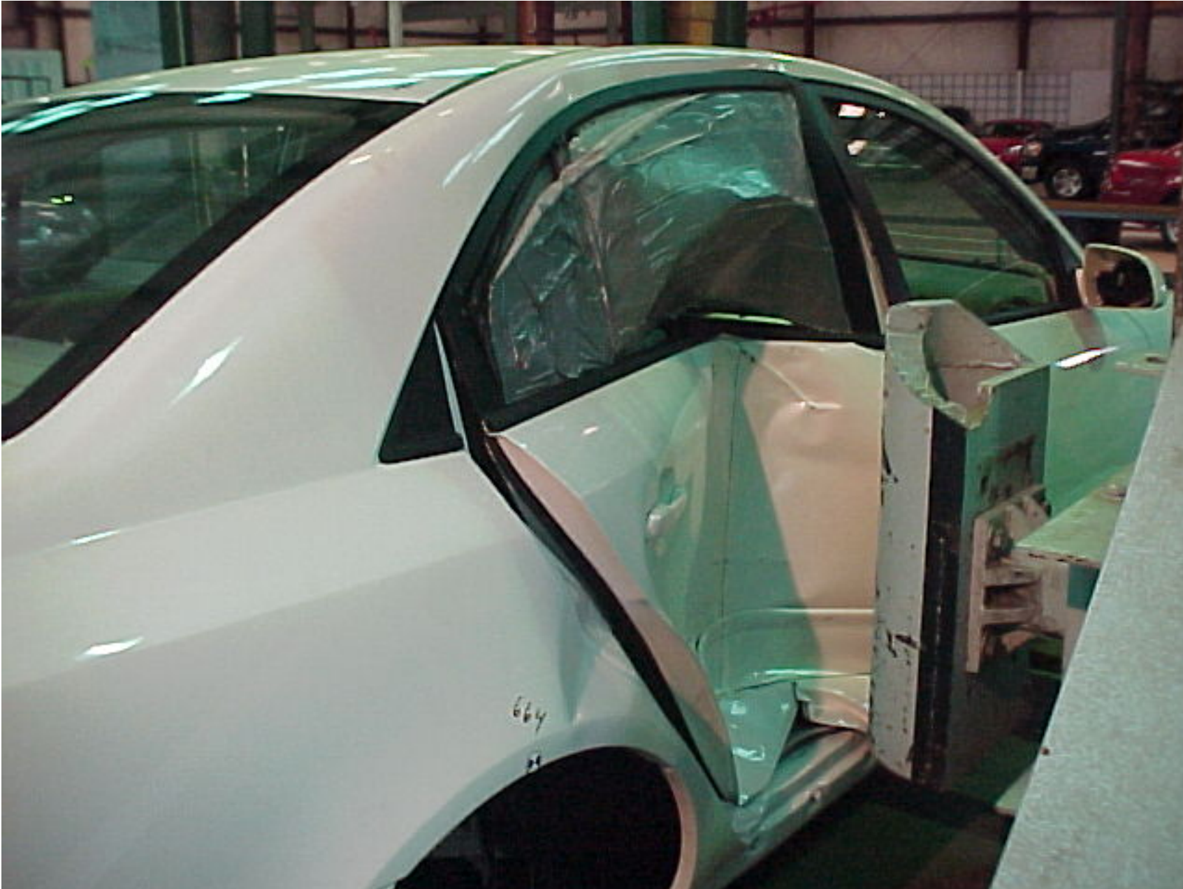
2006 HYUNDAI SONATA NHTSA NO. C60501 FMVSS NO. 214S