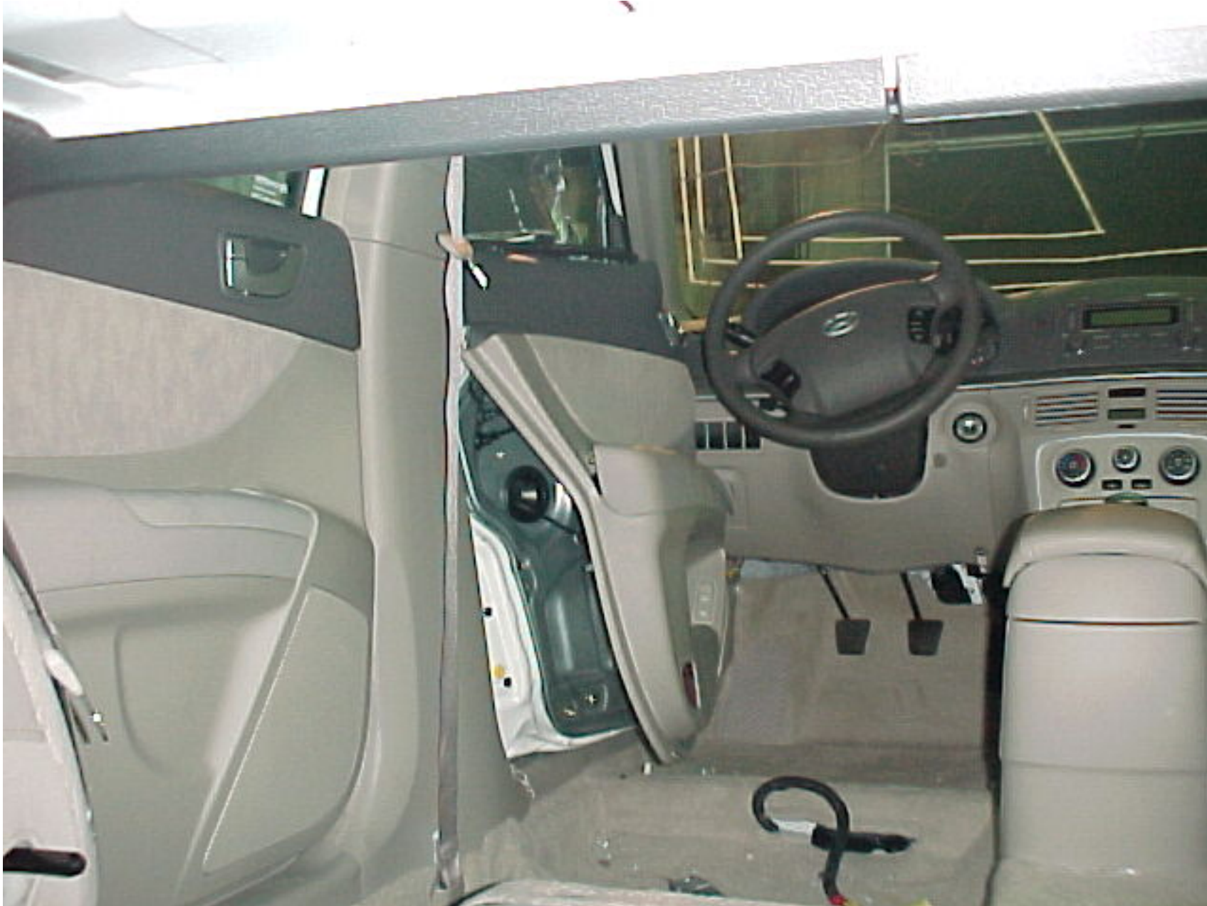
2006 HYUNDAI SONATA NHTSA NO. C60501 FMVSS NO. 214S