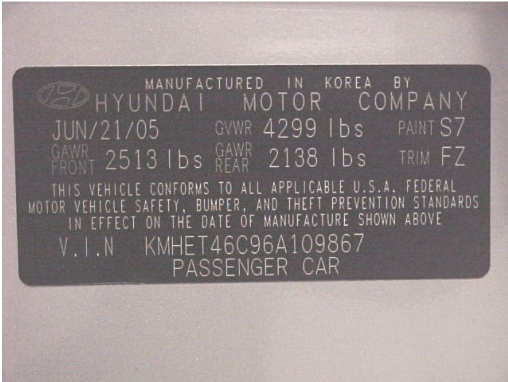
2006 HYUNDAI SONATA NHTSA NO. C60501 FMVSS NO. 214S