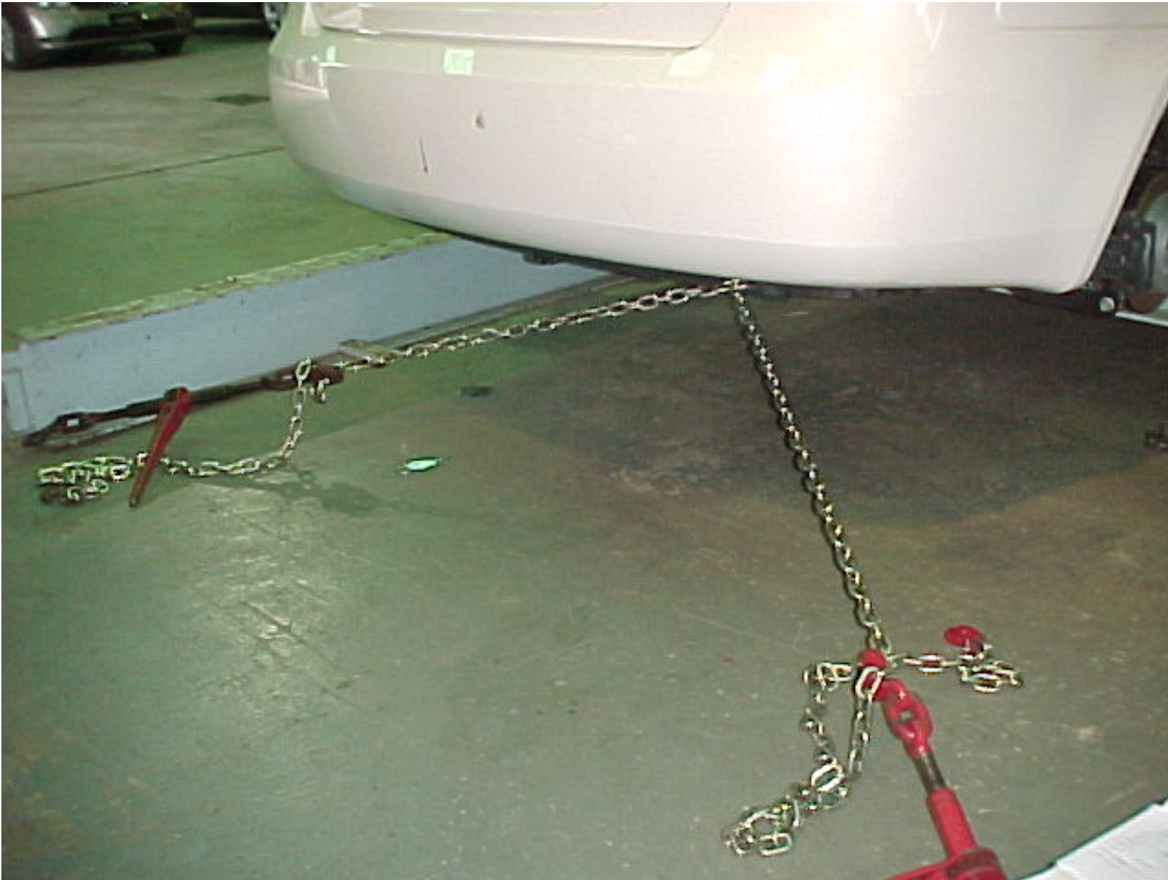
2006 HYUNDAI SONATA NHTSA NO. C60501 FMVSS NO. 214S