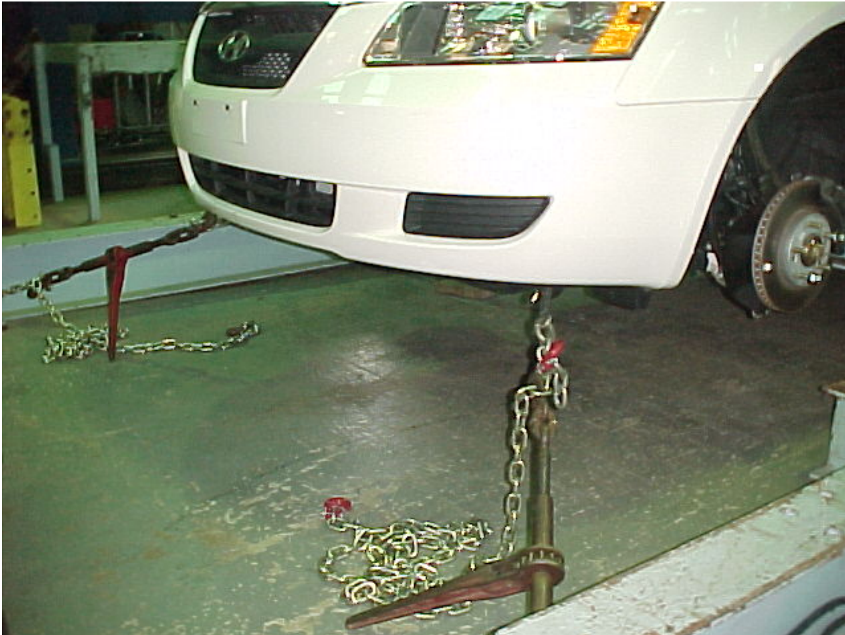
2006 HYUNDAI SONATA NHTSA NO. C60501 FMVSS NO. 214S