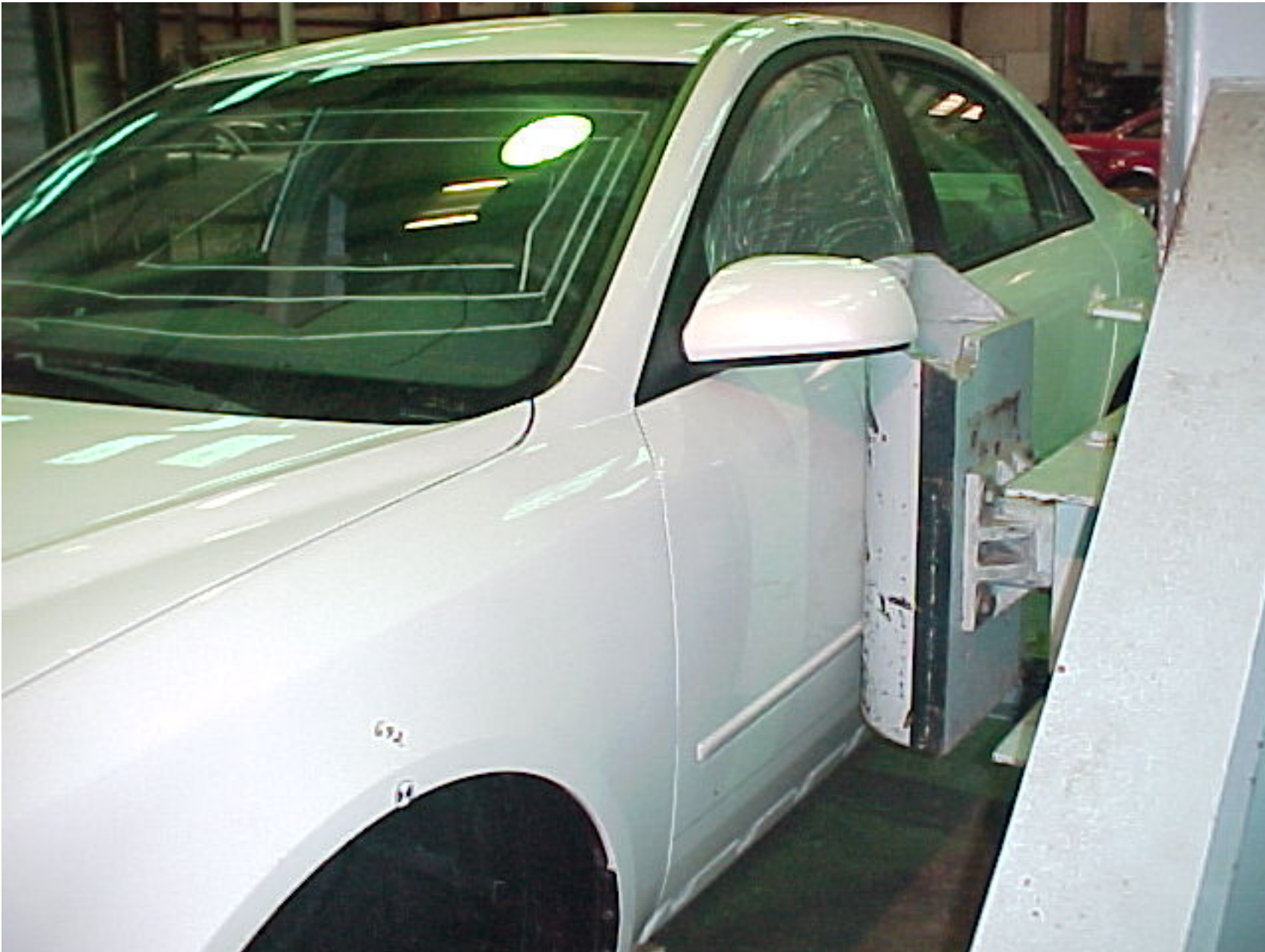
2006 HYUNDAI SONATA NHTSA NO. C60501 FMVSS NO. 214S