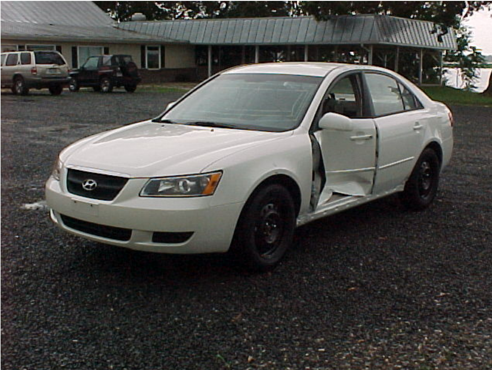
2006 HYUNDAI SONATA NHTSA NO. C60501 FMVSS NO. 214S