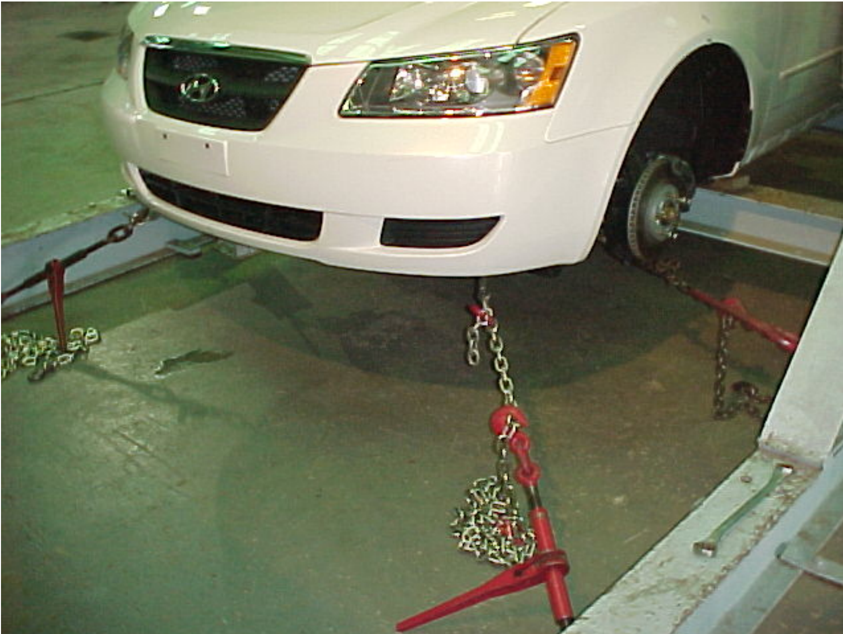
2006 HYUNDAI SONATA NHTSA NO. C60501 FMVSS NO. 214S