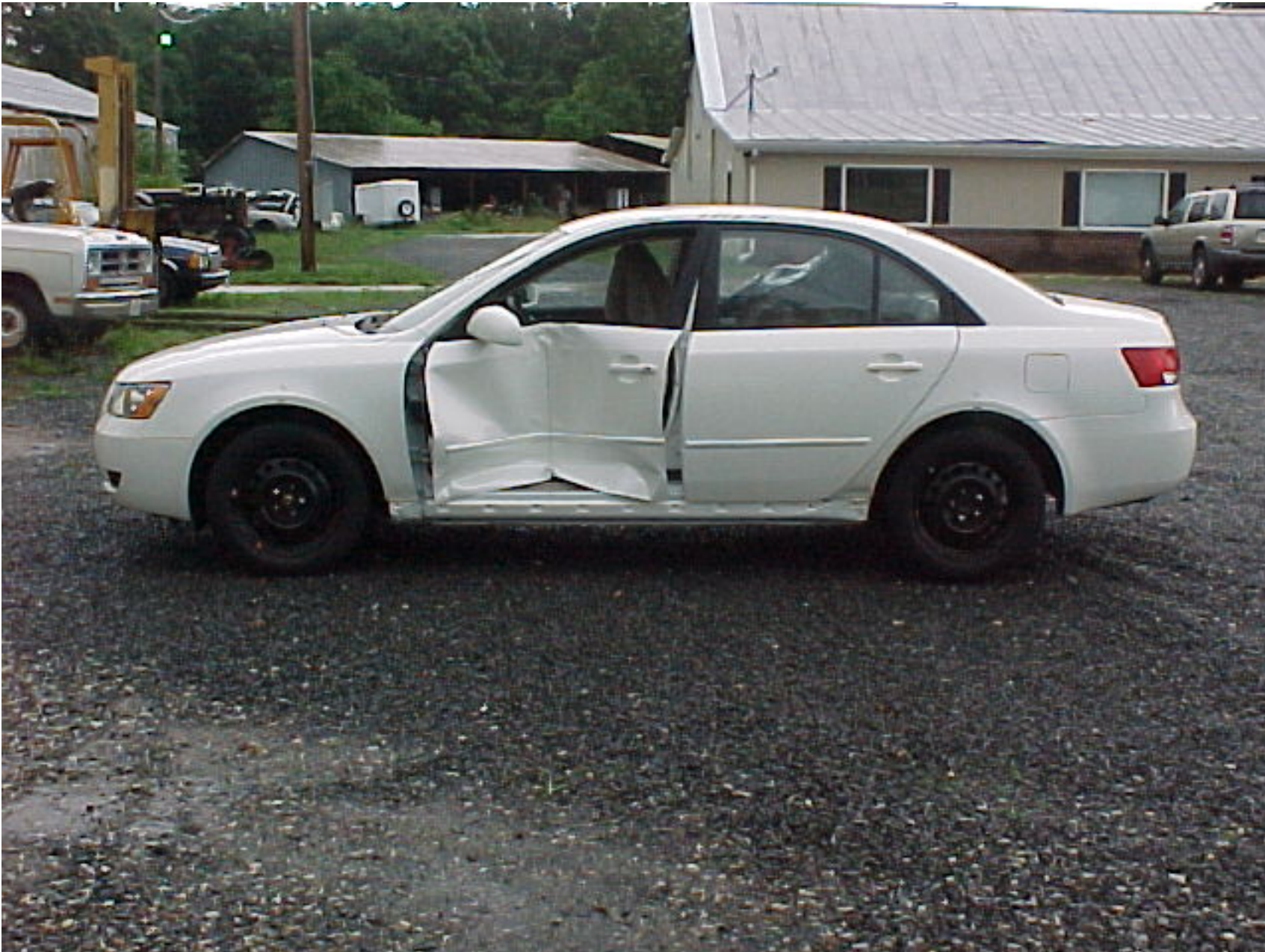
2006 HYUNDAI SONATA NHTSA NO. C60501 FMVSS NO. 214S