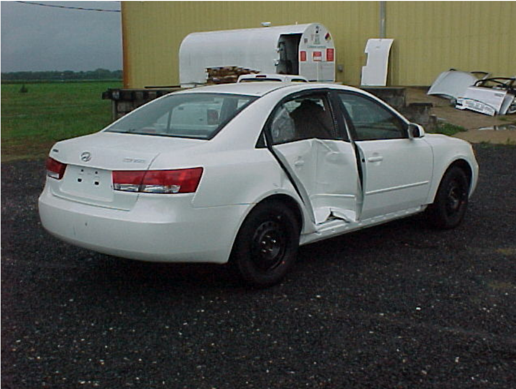
2006 HYUNDAI SONATA NHTSA NO. C60501 FMVSS NO. 214S