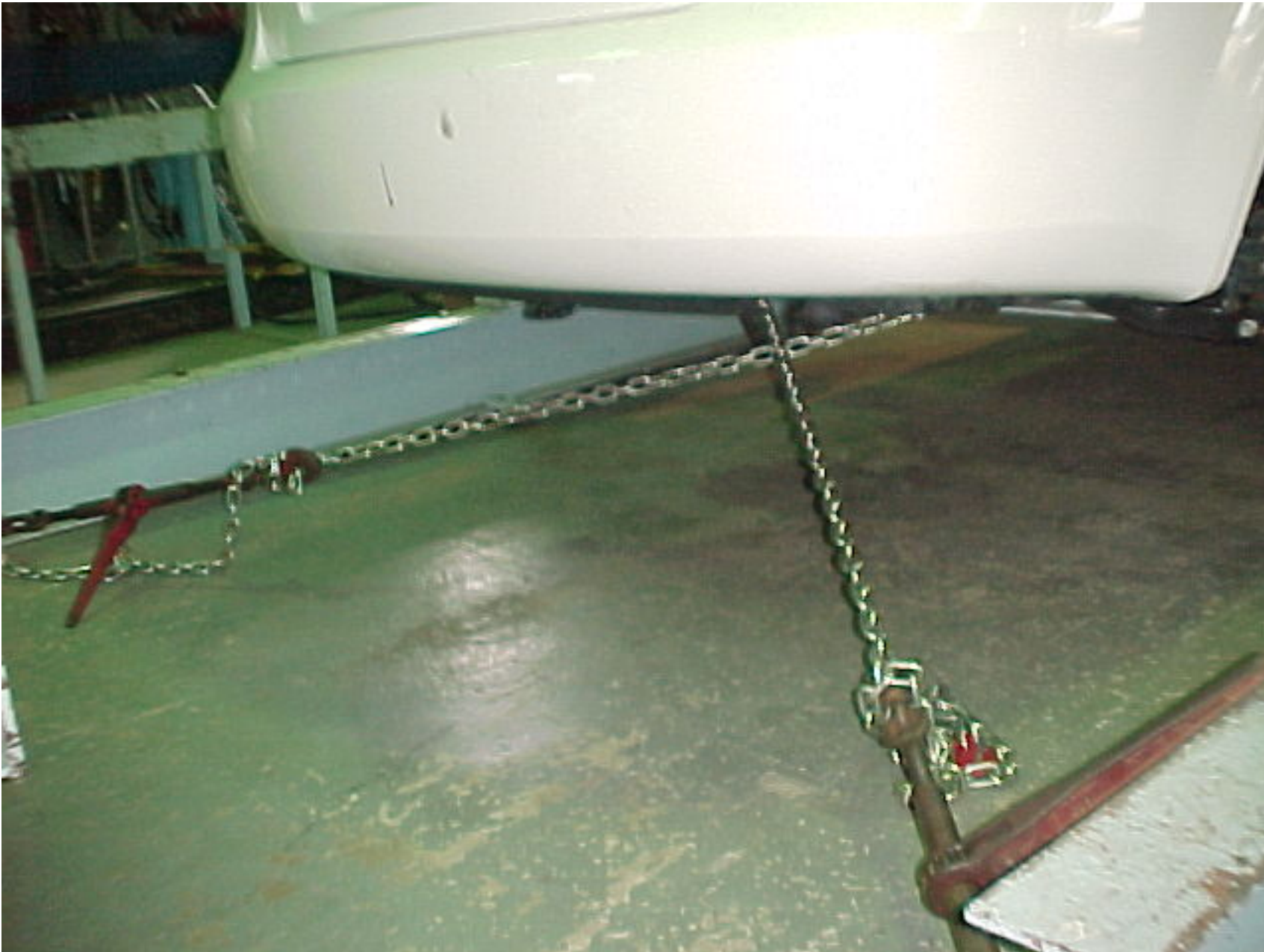
2006 HYUNDAI SONATA NHTSA NO. C60501 FMVSS NO. 214S