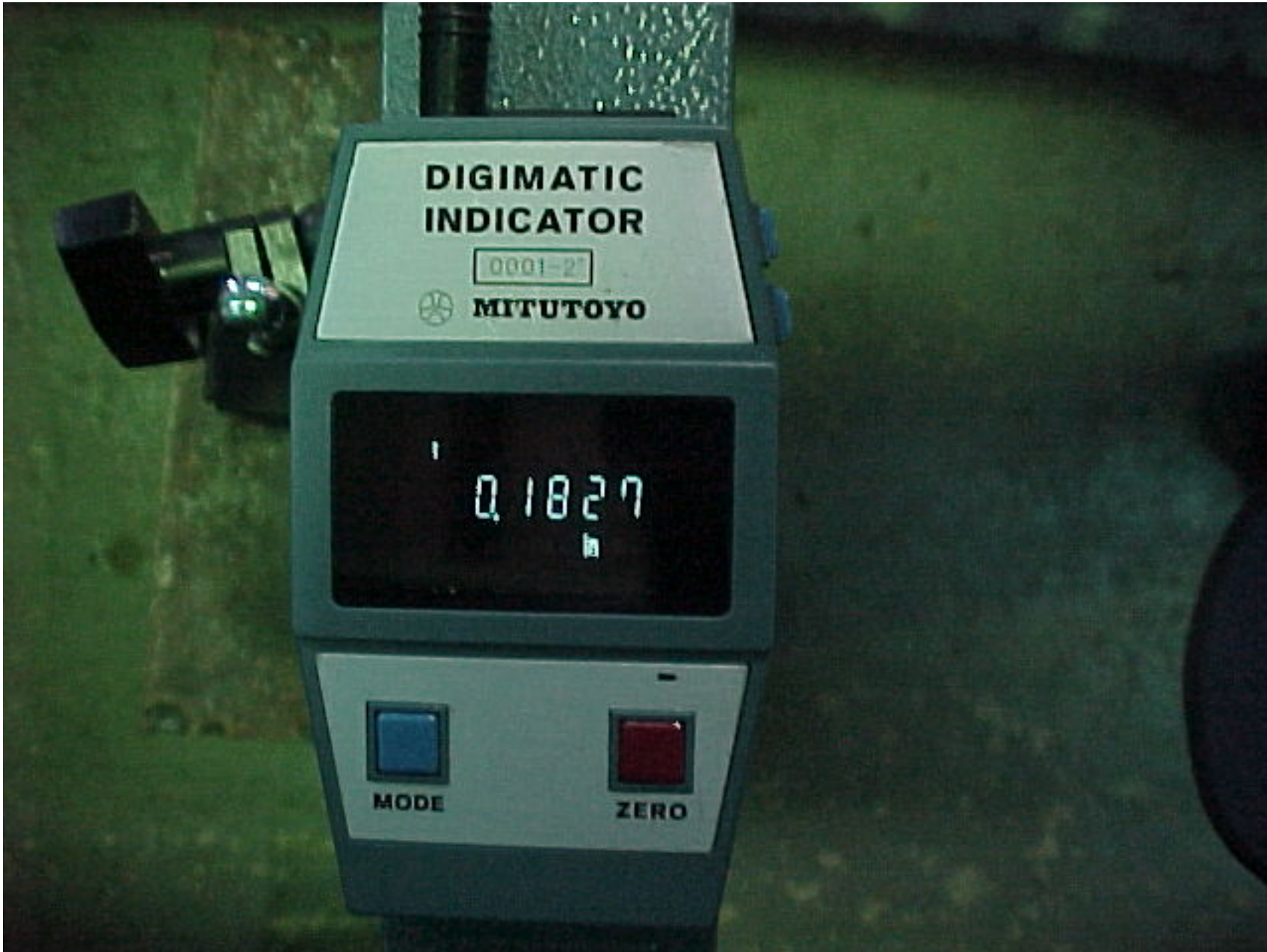
2006 HYUNDAI SONATA NHTSA NO. C60501 FMVSS NO. 214S