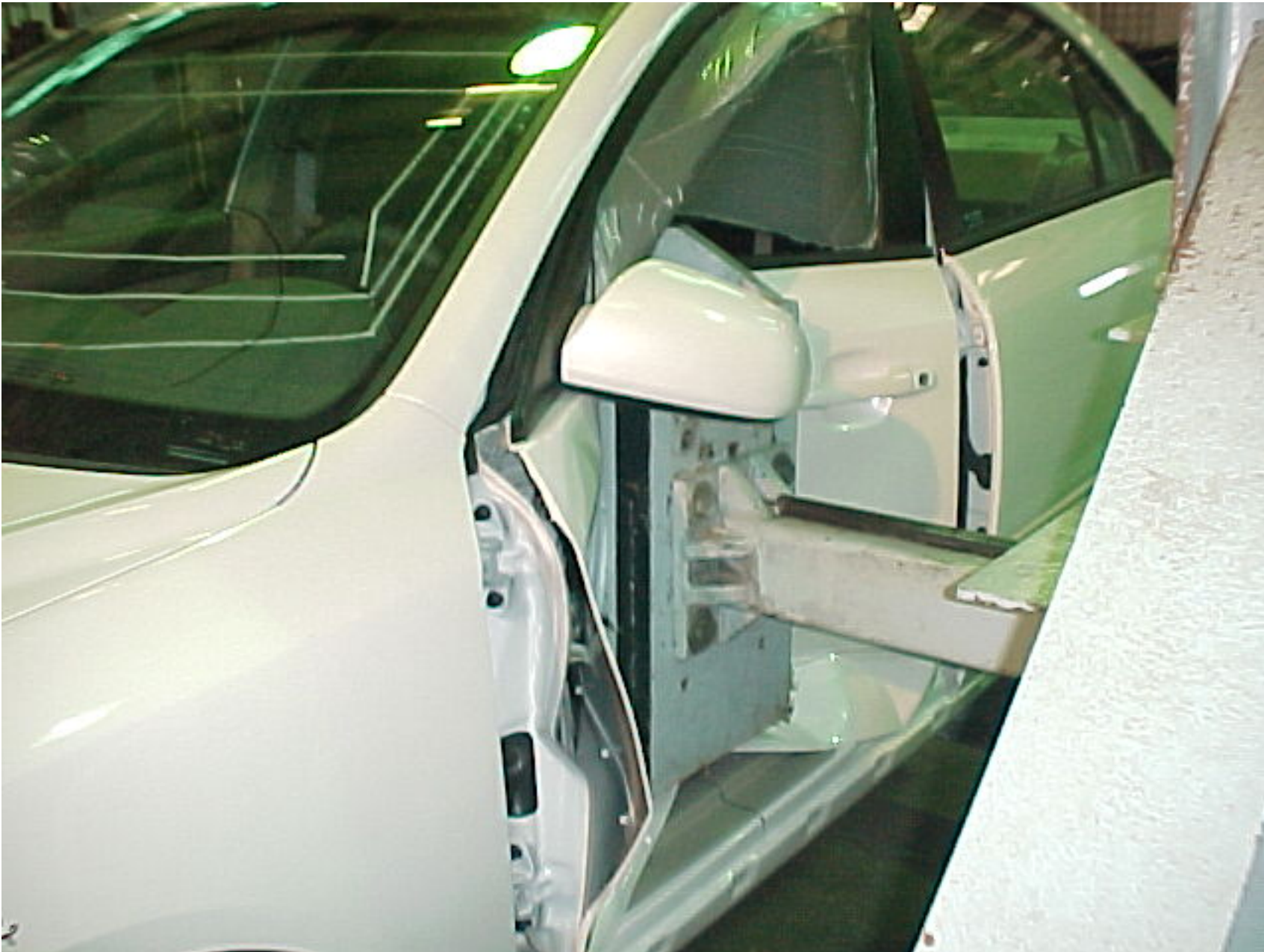
2006 HYUNDAI SONATA NHTSA NO. C60501 FMVSS NO. 214S