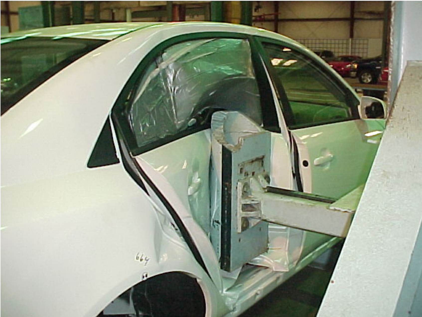
2006 HYUNDAI SONATA NHTSA NO. C60501 FMVSS NO. 214S