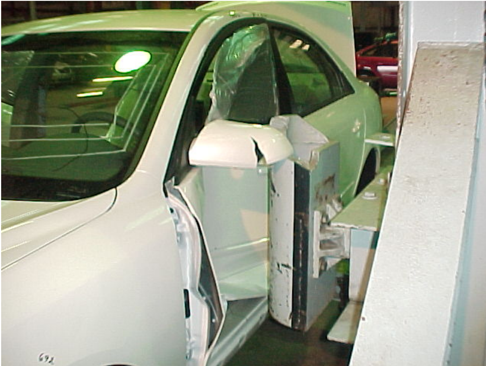
692 2006 HYUNDAI SONATA NHTSA NO. C60501 FMVSS NO. 214S