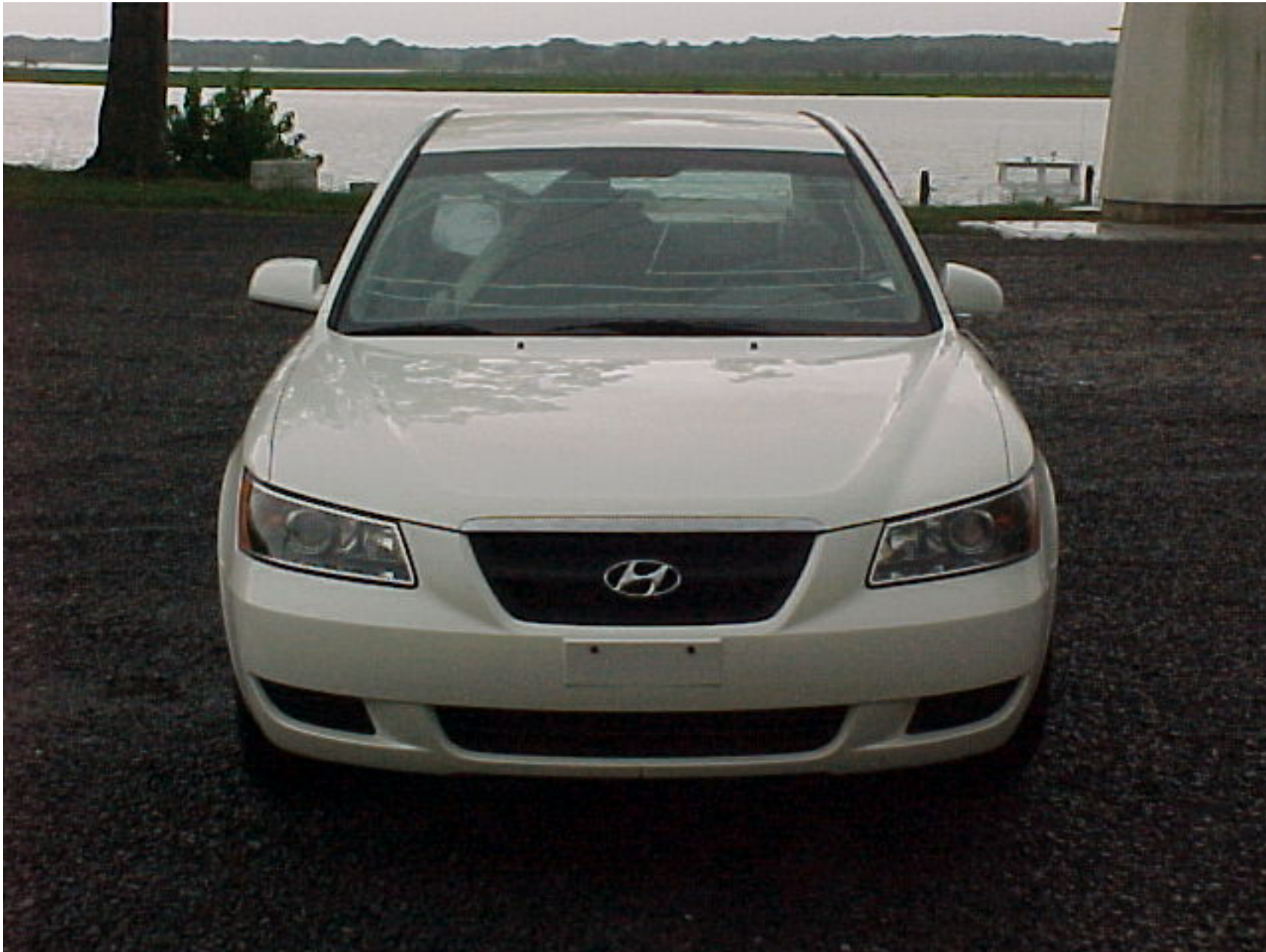
2006 HYUNDAI SONATA NHTSA NO. C60501 FMVSS NO. 214S