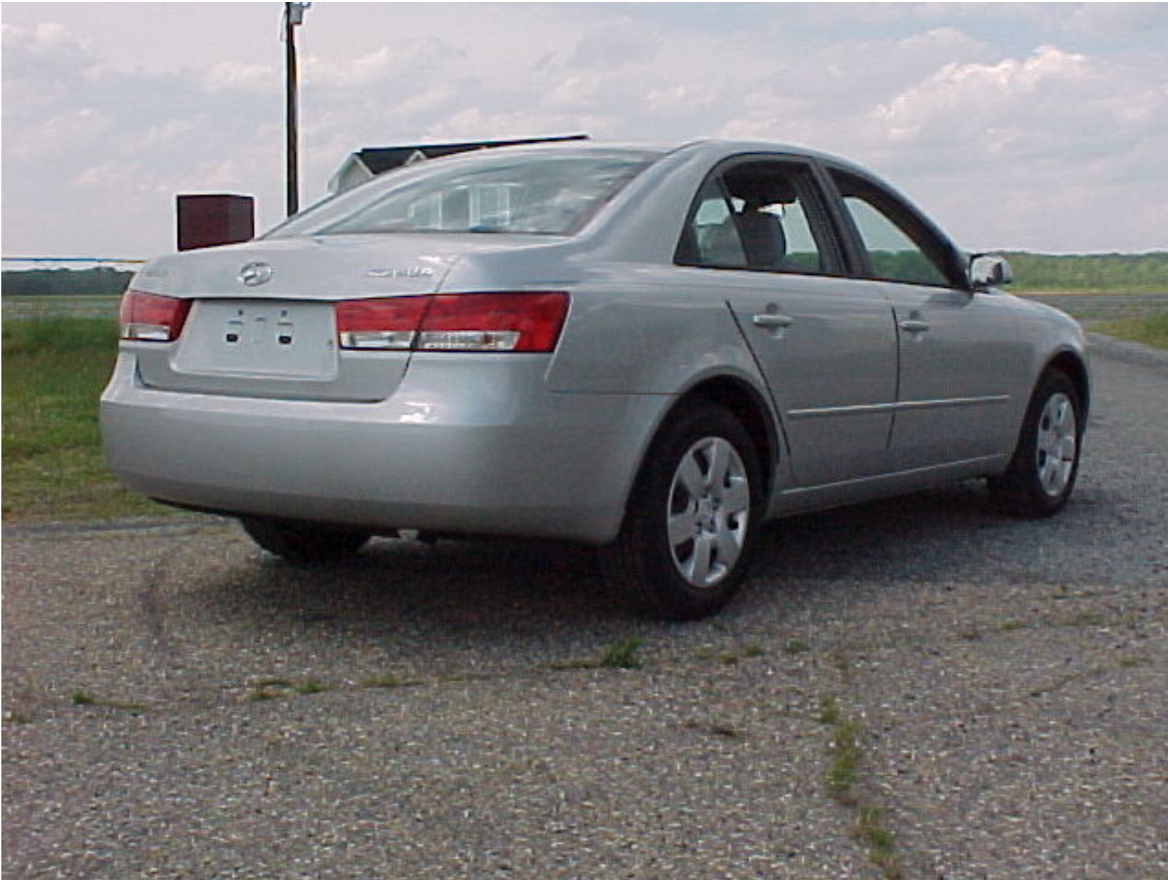
2006 HYUNDAI SONATA NHTSA NO. C60501 FMVSS NO. 214S