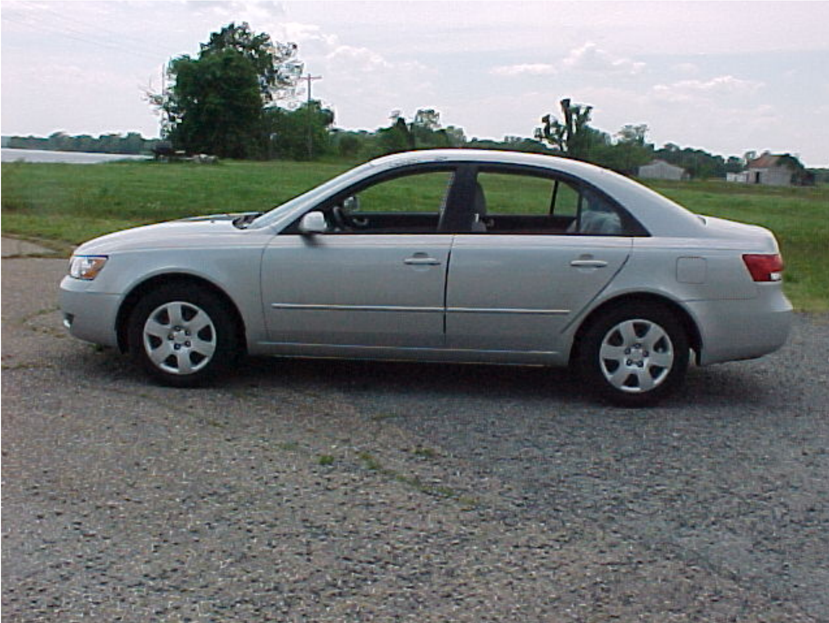
2006 HYUNDAI SONATA NHTSA NO. C60501 FMVSS NO. 214S