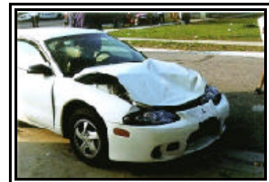
Figure 5. Frontal damage to Mitsubishi Eclipse