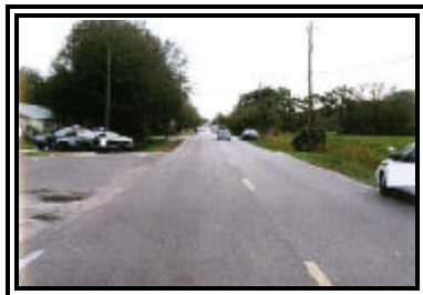
Figure 1. Direction of travel for the Dodge pickup truck

The 25-year-old female driver of the 1998 Mitsubishi Eclipse was operating the vehicle northbound on approach to the 3-leg intersection at a police-reported speed of 48 km/h (30 mph). The 27-year-old male driver of the Dodge Ram pickup truck was operating the vehicle southbound at a police-reported speed of 24 km/h (15 mph) on approach to the 3-leg (T) intersection ( Figure 1 ). He initiated a left turn at the intersection and failed to recognize the close proximity of the approaching 1998 Mitsubishi Eclipse traveling in the opposite direction in the northbound lane. The driver of the Eclipse, realizing the impending harmful event, steered right and braked with sufficient force to lock the front wheels of the vehicle. The investigating officer documented 15 m (48') of skid marks from the right front tire and 8 m (27') of skid marks from the left front tire of the Eclipse ( Figure 2 ). The driver's steering input redirected the Mitsubishi across the southeast quadrant of the intersection and onto the intersecting roadway where the impact occurred.