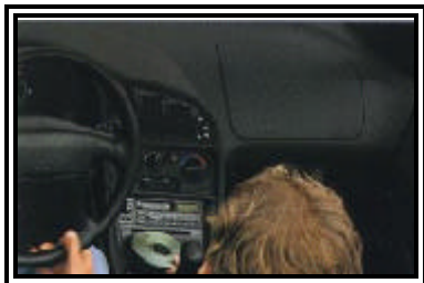
Figure 10. Photo from 1998 Mitsubishi Eclipse brochure showing the front right passenger air bag cover flap

The front right passenger’s air bag deployed from the right mid-instrument panel area with a single cover flap design hinged at the top aspect (Figure 10). The cover flap was rectangular in shape. A large tissue transfer was noted on the upper left portion of the air bag module cover flap, indicating the front right child passenger was possibly positioned above the cover flap when it deployed (Figure 11). Black (probably vinyl) transfers were noted on the left, top, and bottom aspects of the air bag surface indicating an impeded deployment (Figure 12). Contact evidence, possibly a clothing transfer, was noted on the left aspect of the air bag.