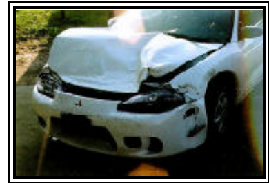
Figure 4. View of frontal and left side damage for Mitsubishi Eclipse

The 1998 Mitsubishi Eclipse sustained moderate frontal damage as a result of the impact with the Dodge Ram pickup truck ( Figure 4 ). The direct contact damage began at the front left bumper corner and extended laterally approximately 130 cm (51") across the bumper fascia. Direct contact damage was also noted at the level above the bumper from the under ride with the Dodge pickup truck, which caused the front edge of the hood to crush rearward. The left headlight was displaced rearward, and slight buckling was noted on the left aspect of the bumper fascia and left front fender ( Figure 5 ). A scuff mark from the right rear wheel of the Dodge was also identified on the left front fender above the wheel, which resulted from the pocketing and rotation prior to disengagement. The Collision Deformation Classification (CDC) for this impact to the Mitsubishi Eclipse was 11-FDEW-1. Six crush measurements were estimated along the frontal plane above the bumper as were as follows: C1 = 10 cm (4"), C2 = 8 cm (3"), C3 = 7 cm (3"), C4 = 7 cm (3"), C5 = 7 cm (3"), C6 = 5 cm (2").