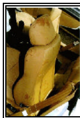
Figure 7. Rear aspect of front left seat back