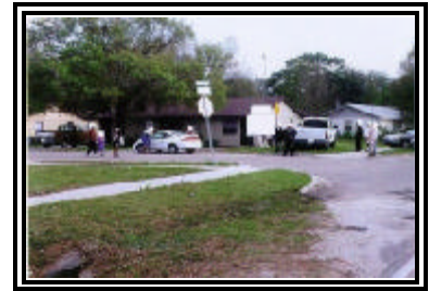
Figure 3. Final rest positions of both vehicles