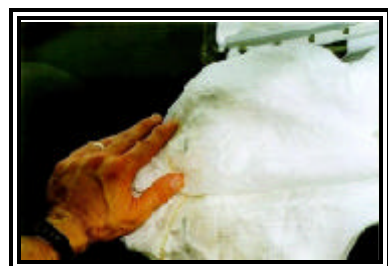
Figure 12. Front right passenger’s air bag showing black vinyl transfers