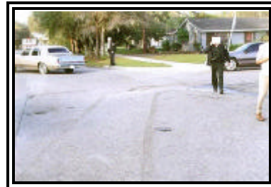
Figure 2. Point of impact and pre-impact skid marks from the Mitsubishi Eclipse