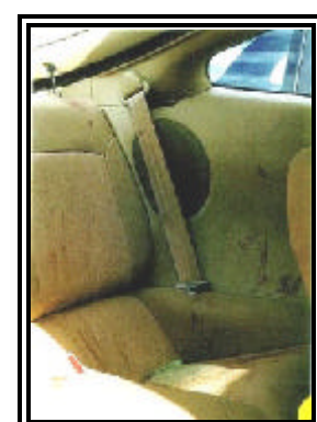
Figure 8. Rear left seat