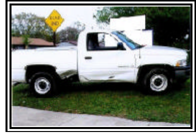
Figure 9. Damage to 1997 Dodge Ram pickup truck

The 1997 Dodge Ram pickup truck sustained moderate damage as a result of the impact with the Mitsubishi Eclipse (Figure 9). The direct damage was concentrated below the side body line, and extended longitudinally from the front of the right door to the right rear wheel. Pocketing of the sheet metal was noted forward of the right rear wheel from the engagement and rotation of the vehicles. The CDC for the impact to the Dodge Ram pickup truck was 02-RZLW-3.