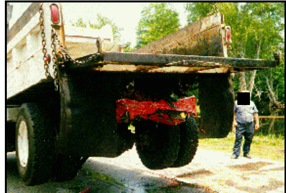
Figure 8: Vehicle #2 after removal of the case vehicle; Note: case vehicle's hood jammed under dump bed (case photo #9)

Vehicle #2's driver (39-year-old male, black, unknown if Hispanic, unknown height and weight) was wearing his available, active, three-point, lap and shoulder safety belt system. He was the sole occupant