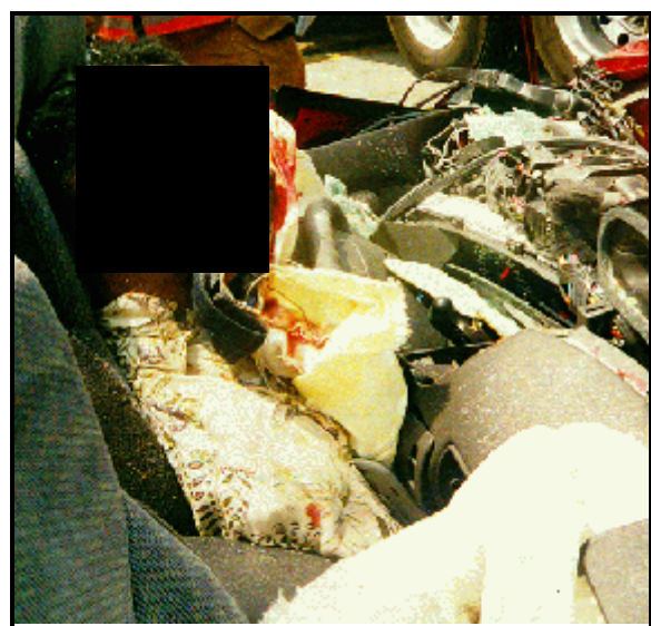
Figure 7: Case vehicle driver's post-impact position; Note: location of steering column/wheel and instrument panel (case photo #16)

The impact with worker #3 probably did not caused any significant movement by the driver and there is no evidence that any avoidance actions were attempted. Thus, pre-impact body movements by the case vehicle's driver are not likely. As the case vehicle impacted the back of vehicle #2's dump bed and undercarriage, the driver continued forward and began to load his three-point safety belt and deploying air bag. Intrusion by the instrument panel and steering assembly forced him back into his seat. The Police Crash Report indicates that the major autopsy findings laceration of the aorta with bilateral were: hemothoraces and laceration of the pulmonary artery, probably caused by his contact with the steering wheel hub and spokes. In addition, he sustained lacerations of the liver with hemoperitoneum, probably caused by contact with the lower steering wheel rim. A small laceration is visible on his forehead. It seems likely that he sustained other significant injuries as well.