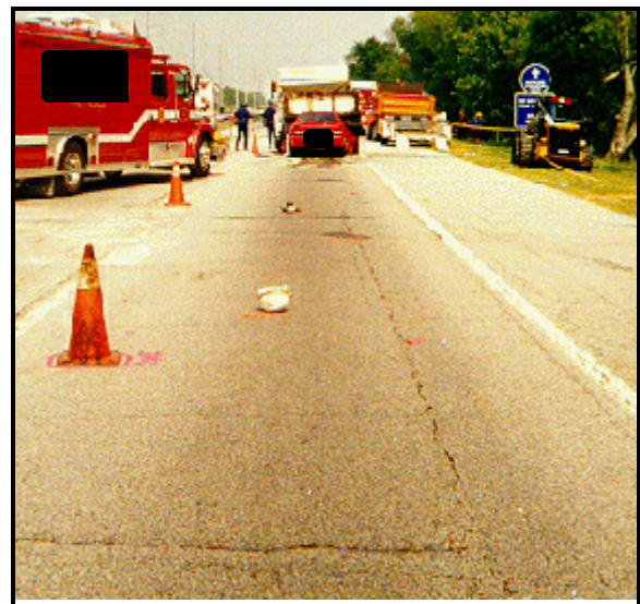
Figure 2: Case vehicle driver's westbound approach view; Note: highway worker's hard hat and shoe on pavement (case photo #02)