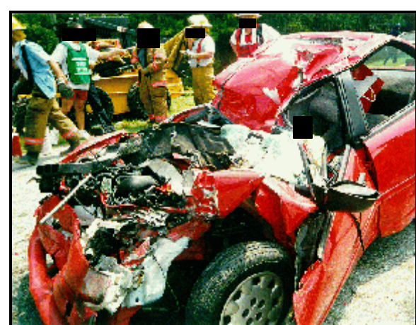
Figure 6: Case vehicle's front damage as viewed from the front left corner; Note: location of the front roof header (case photo #10)

Based on police photographs, the CDC for the case vehicle-to-dump truck collision (event #4) is estimated as: 12-FDAA-9 , with a principal direction of force of 0 degrees. This crash is out-of-scope for the WinSMASH reconstruction program. The crash severity for the case vehicle was high [greater than 40 km.p.h. (25 m.p.h.)].