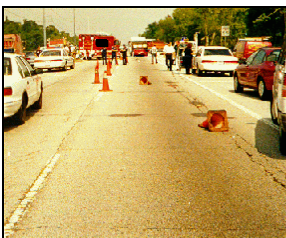
Figure 1: Westbound approach view for the case vehicle; Note: overturned safety cones and distance case vehicle traveled prior to impact with vehicle #2 (case photo #01)

A state road crew was using a road grinder to remove bumps on the pavement surface. They had completed removing bumps on the inside westbound lane and had moved their equipment to the outside westbound lane and closed it to traffic with safety cones. Crew member #1 was standing near the area that blocked the outside westbound lane to traffic. He heard what he believed to be a vehicle traveling at a high rate of speed, looked up, and saw the case