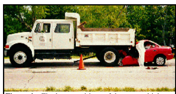
Figure 4: Final rest positions of the case vehicle and vehicle #2; Note: depth of underride by the case vehicle (case photo #05)