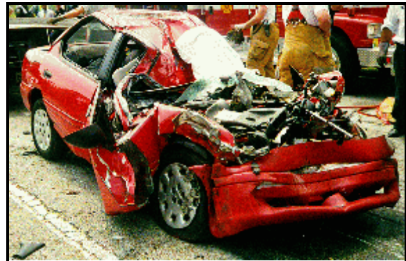
Figure 5: Case vehicle's frontal damage as viewed from the front right corner; Note: direct contact to roof rearward of the B-pillar (case photo #15)

The case vehicle sustained direct contact across the entire width of its front end. The front bumper and fascia were shoved rearward and torqued at an angle, with the top further rearward than the bottom. Missing was the front grille and both headlamp assemblies. Both front fenders were displaced rearward, with the rear portions of the fenders buckling outward and forward, and the mounting plates to the lower A-pillars pulled forward with the front door seams still partially attached. The front engine compartment brackets were shoved rearward (Figures 5 and 6). When the case vehicle was pulled from under vehicle #2, the case vehicle's hood was jammed under the dump bed and atop its right rear dual tires. Engine components atop the block were scraped rearward. The top of the cowling was pushed rearward and caused the instrument panel to be compressed against the driver. Both A-pillars were displaced rearward and buckled as the forward roof header was deflected downward, almost to the top of the instrument panel. The bottom of vehicle #2's dump bed contacted the case vehicle's roof to the halfway mark of the rear passenger doors. The windshield was splintered, folded, and mostly laying atop the back of the engine compartment. All four door glazings were shattered (kernelized), but the doors remained shut. Both B-pillars were bent rearward. Both roof side rails were bent downward.