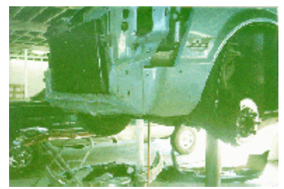
Figure 8 - View of the damage from the left side of the vehicle

The transmission oil pan showed signs of oil residue along the bottom surface. The appearance of the oil appeared somewhat fresh, however, the front and right gasket surfaces appeared dry. The engine oil pan appeared to be intact and exhibited oil residue which was judged to have been a precrash residue.