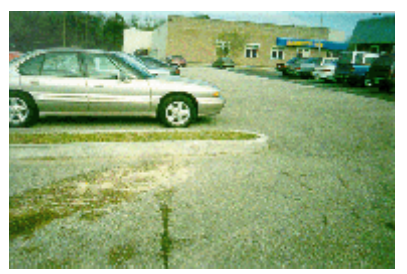
Figure 4 - View of the Plymouth's trajectory showing a faint right front skid mark

The center engine mounting bracket of the Plymouth as well as the lower radiator support bracket contacted the curb during the impact sequence as noted in Figure 5 . Although the rearward deformation of the lower radiator support appeared to be minor (2.5 cm - 5.0 cm), the contact sequence to the stiffer engine mounting bracket apparently resulted in a sufficient delta V to have triggered the supplemental restraint system (SRS) deployment sequence.