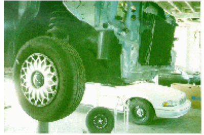
Figure 7 - View of the frontal damage from the right side