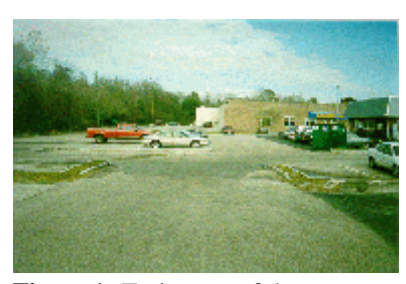
Figure 1 - Trajectory of the Plymouth approaching the concrete barrier curb parking lot divider

Prior to the crash, the 1994 Plymouth Grand Voyager was traveling north on a local roadway within a public parking lot which was designed to provide access between several businesses within a shopping area. The roadway appeared to have provided two way travel with an implied travel lane in each direction ( refer to Figure 1 ). The straight, level, wet asphalt roadway was designed with a jog to the right (northbound) as it appeared