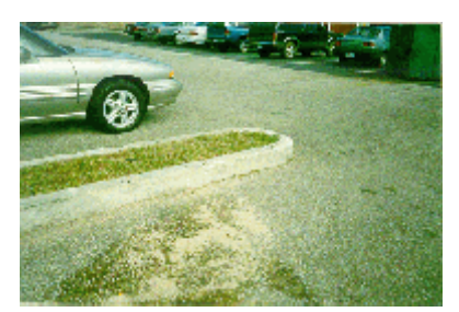
Figure 3 - View of the curb showing impact evidence with the lower frontal area of the Plymouth

Leading up to the curb, there appeared to be a faint tire skid mark which was associated with the right front tire. It appeared to be at least 1.5 m (5.0') in length ( refer to Figure 4 ) with an overall length not known due to the limited scope of the photographs provided by the attorney. The vehicle came to the final rest position (FRP) with the front wheels against the curb face and the vehicle's heading angle perpendicular to the curb.