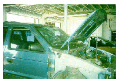
Figure 6 - View of the damaged windshield glazing from contact with the expanding front right air bag

The 1994 Plymouth Grand Voyager was equipped with a dual front Supplemental Restraint System (SRS) which deployed as the result of the impact with the concrete barrier curbed parking lot divider. Exterior damage to the vehicle involved the center engine mounting bracket as well as the lower radiator support bracket. The right front fender was removed, but its condition was not known. The windshield was cracked with a concentrated fracture pattern located in the right upper third. This was associated with contact from the expanding front right air bag ( refer to Figure 6 ). The attorney indicated that the front bumper was not damaged and was reused after the front damage had been repaired.