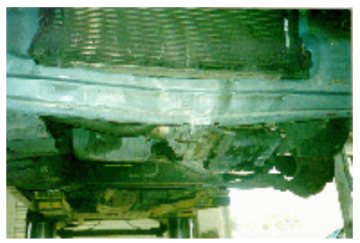
Figure 5 - Close-up view of the contact damage to lower radiator support and center engine mount bracket

The center engine mounting bracket of the Plymouth as well as the lower radiator support bracket contacted the curb during the impact sequence as noted in Figure 5 . Although the rearward deformation of the lower radiator support appeared to be minor (2.5 cm - 5.0 cm), the contact sequence to the stiffer engine mounting bracket apparently resulted in a sufficient delta V to have triggered the supplemental restraint system (SRS) deployment sequence.