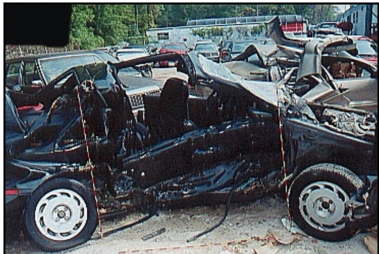
Figure 3. Exterior, Nissan Pulsar

After impact with the Camaro, the Pulsar began a counterclockwise rotation of approximately 270°, while moving northwest approximately 24 m (80 ft), and the left rear corner impacted a small dirt embankment immediately adjacent to the west edge of the roadway. At impact with the embankment it appears that the left rear occupant of the Pulsar was ejected through the back window/hatchback.