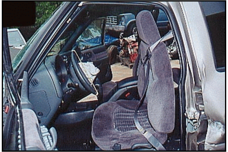
Figure 9. Interior, Vehicle 1. Driver position.

The left rear occupant was an 11 year old male of unknown height or weight. Police investigators reported that he sustained "possible" injuries of an unknown nature or severity. He was not entrapped. He was transported, method not reported, to a regional children's trauma center for an unknown course of treatment. The right rear occupant of the vehicle was a 4 year old female of unknown height or weight. Police investigators reported that she sustained non-incapacitating injuries of an unknown nature or severity. She was not entrapped. She was transported, by air, to a regional children's trauma center for an unknown course of treatment.