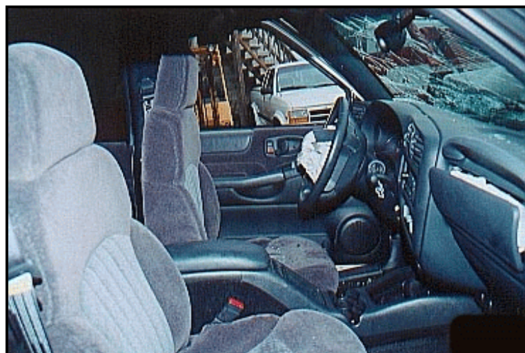
Figure 7. Interior, case vehicle.