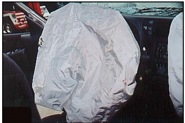
Figure 11. Driver side front air bag.