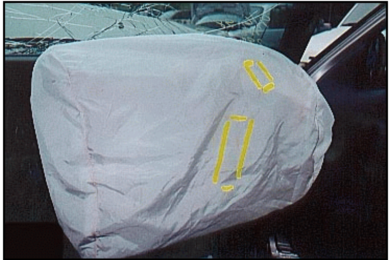
Figure 12. Passenger front air bag.

Upon impact with the Pulsar, the Blazer's occupants were projected forward, and approximately 10E left, in response to the 12 o'clock (350E) direction of impact forces. The forces involved in this crash exceeded the manufacture's SRS threshold in the case vehicle, and the driver's and right front passenger's depowered air bags deployed. All four occupants of the case vehicle loaded their respective lap/shoulder restraints, and the front seat occupants loaded the deployed depowered air bags. There was no evidence of occupant contact on the driver's air bag, but there were abrasions/fabric transfers on the face of the passenger's air bag that were likely due to the chest contact.