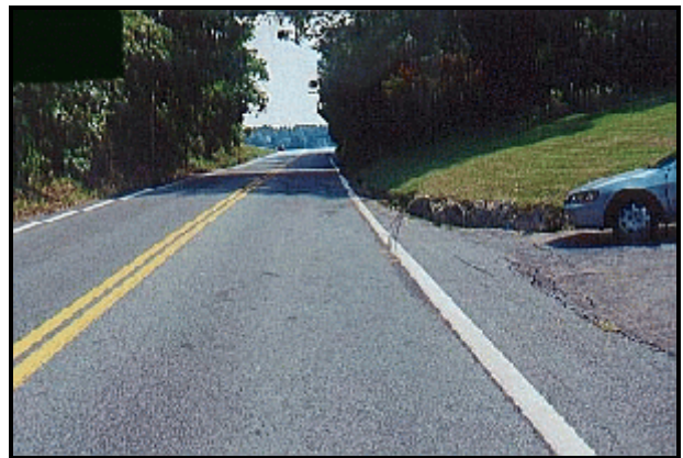
Figure 1. Path of case vehicle to area of impact.

This three vehicle crash occurred during the night hours of a weekend in September 1998. At the time of the crash it was dark and there were no street lights. The weather was clear, there was no precipitation and the road surface was dry and free of defects. The crash occurred in the southbound travel lane of a two-lane north/south rural roadway. At the crash scene, the roadway was straight with a 4% upgrade for southbound traffic. The roadway was 8 m (26 ft) in width and was edged on the east by a 0.9 m (3 ft) asphalt shoulder. The travel lanes were delineated by white fog lines and a double yellow center line. The posted speed limit for the area was 72 km/h (45 mph).