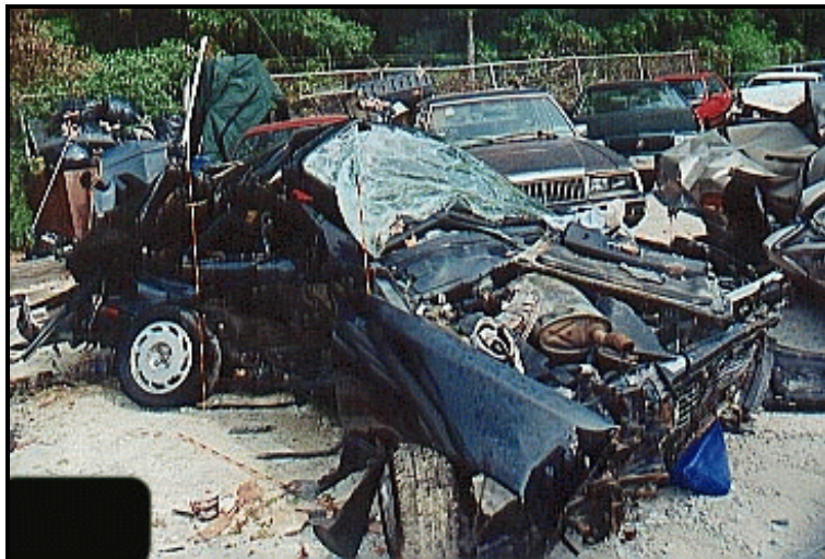
Figure 8. Exterior, Nissan Pulsar

Description: 1987 Nissan Pulsar NX SE 3-door VIN: JN1EN34S3HMxxxxxx Odometer: 181,537 km (112,805 miles) Engine: I4 1.6 L Reported Defects: None noted Cargo: None Damage Description: Extensive right side crash and extrication damage with a maximum crush depth of approximately 86 cm (34 in) at the right "B" pillar (maximum side extension) CDC: 03RPEW4 Delta V: 2 Total 58.8 (36.5 mph) Longitudinal 15.2 km/h (9.4 mph) Latitudinal -56.8 km/h (-35.3 mph)