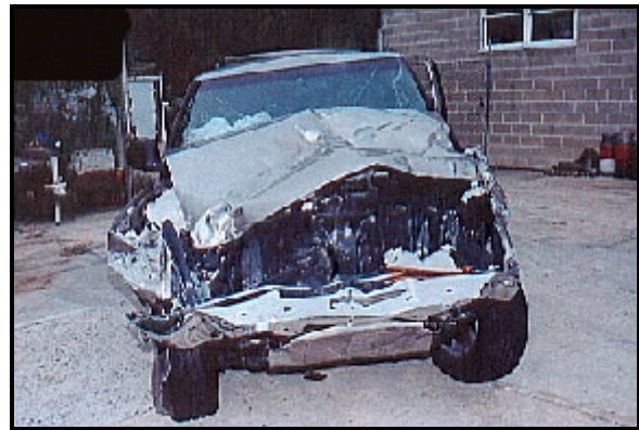
Figure 5. Exterior, case vehicle.

The driver air bag module was located in the center of the steering wheel. The "T" type cover flaps opened as designed during the deployment sequence. The symmetrical flaps measured approximately 10 cm (4 in) vertically by 7 cm (3 in) horizontally. The driver's air bag was a tethered bag, approximately 60 cm (24 in) in diameter. The two internal tether straps, sewn to the center of the bags front surface, were located at approximately the 3:00 and 9:00 o'clock positions. During inspection, the tether straps allowed the deflated bag to extend approximately 28 cm (11 in) from the module. There were two 2.5 cm (1 in) diameter vent ports located at the 1:00 and 11:00 o'clock positions on the back side of the bag. The lower half of the air bag had several drops of post-crash blood, but there was no residual evidence of occupant contact with the bag.