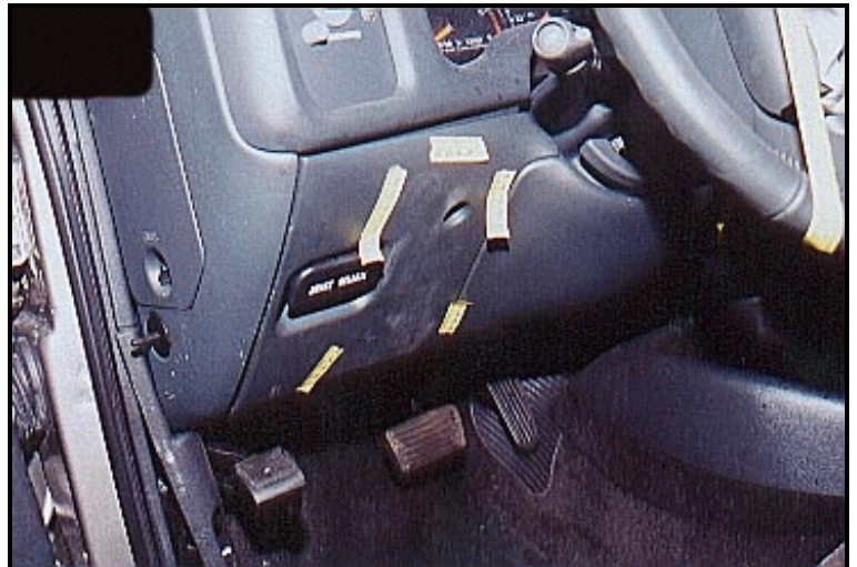
Figure 10. Interior, case vehicle. Knee contact.