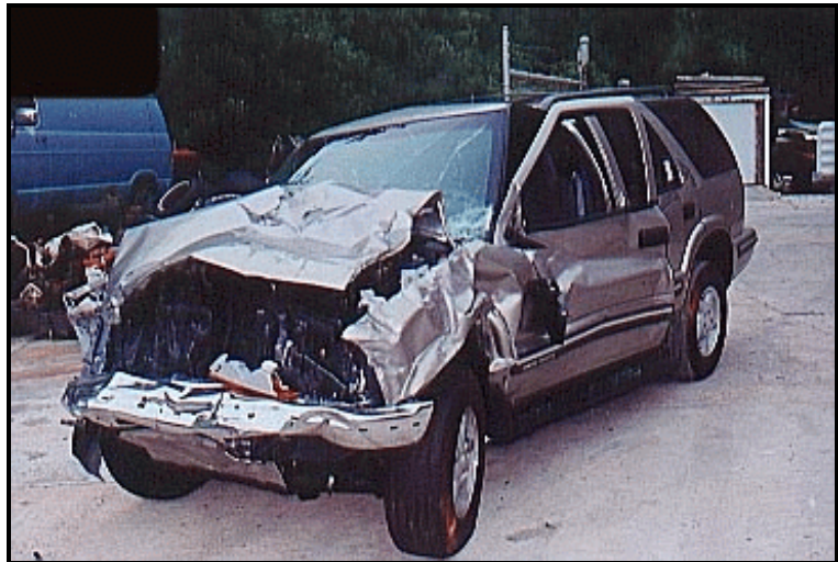
Figure 2. Exterior, case vehicle

According to the police report, and scene evidence, the crash occurred in the following manner. The first other vehicle, a 1987 Nissan Pulsar with three occupants, was being driven north, negotiating a right turning curve in the northbound travel lane, at a speed estimated to have been between 113 and 121 km/h (70 and 75 mph). The radius of the curve was 85 m (280 ft), and the computed critical speed was 89.9 km/h (55.9 mph) 1 . As Vehicle 2 exited the curve (approximately 70 m [230 ft] south of the crash scene) it was in a left yaw. It appears that the driver oversteered to the left in an attempt to control the yaw, and the vehicle yawed right as it crossed the center line into the southbound travel lane and the travel path of the second other vehicle, a 1988 Chevrolet Camaro. The second other vehicle was being driven south, in the southbound travel lane approximately 61 to 76 m (200 to 250 ft) ahead of the Vehicle 1, at an undetermined speed. The right front plane of the Pulsar impacted the left front plane of the Camaro. After impact, the Camaro appears to have been brought to a controlled stop at the west edge of the southbound travel lane approximately 11 m (35 ft) south of the point of impact (POI).