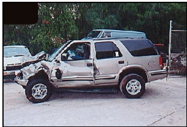
Figure 6. Exterior, case vehicle.