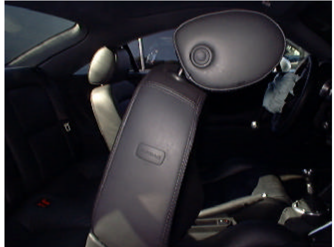
Figure 9. Interior, case vehicle. Side impact air bag system.