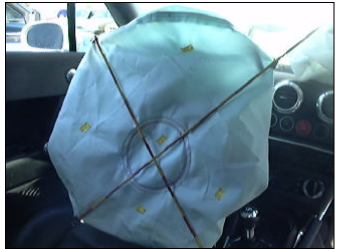
Figure 6. Interior, case vehicle. Driver's frontal air bag.

The front left air bag was housed in the steering wheel hub and was concealed by asymmetrical H-configuration cover flaps which were not damaged in the crash. The circular air bag was equipped with four tether straps and one vent port. Contact evidence consisting of blood, smudges, and scuffs was found on the front of the air bag. The bag was not damaged.