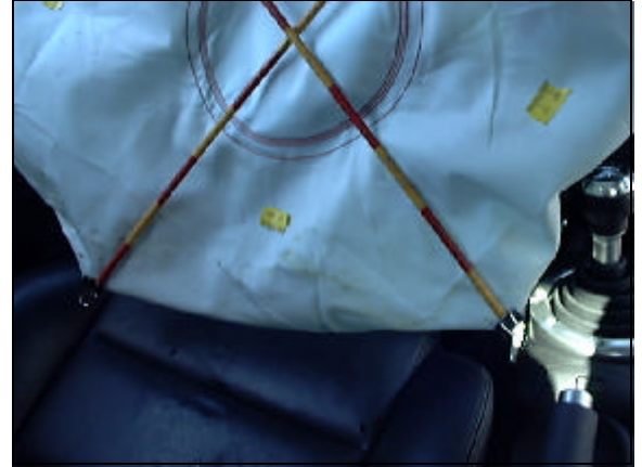
Figure 10. Interior, case vehicle. Driver's frontal air bag contact evidence.

At impact, the occupants reacted to the 0 degree principle direction of force by moving forward and loading the lap and shoulder restraints. As the restraints locked, further forward movement of the occupants was prevented. The loading of the restraints by case occupant 01 caused the chest and abdominal abrasions. As the driver's frontal air bag deployed, his right wrist was struck causing the right wrist abrasion. Case occupant 02 was not injured but reportedly was suffering from "minor lower back pain". Both occupants of Vehicle 1 were transported to a trauma center, however the front right occupant was uninjured and was not treated. The driver was treated and released.