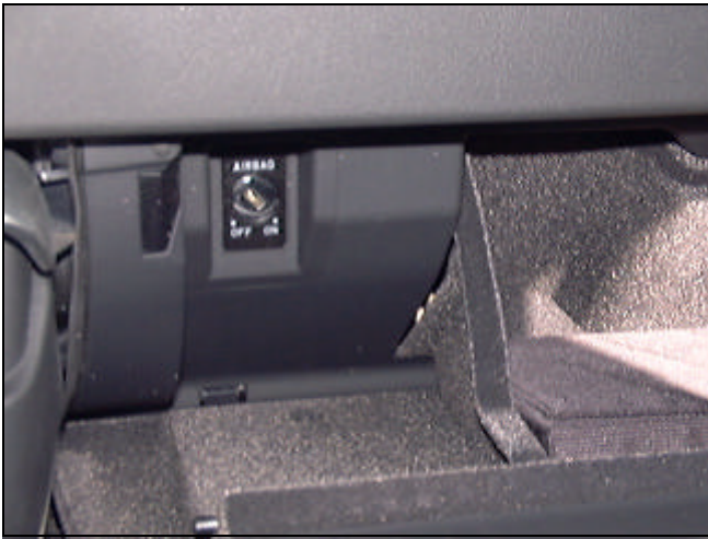
Figure 8. Interior, case vehicle. Passenger’s frontal air bag shut off switch.