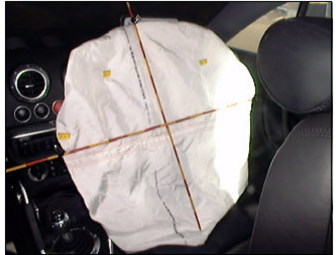
Figure 7. Interior, case vehicle. Passenger’s frontal air bag.

The Audi TT was also equipped with seat back mounted side air bags in the front left and front right seating positions which did not deploy in this frontal impact.