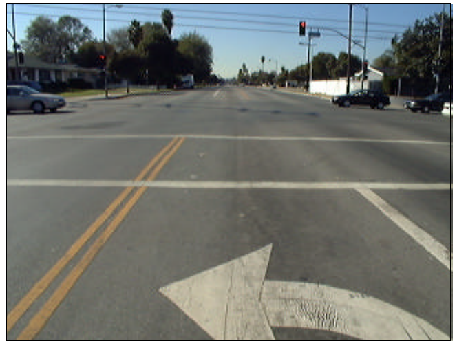
Figure 1. Crash scene. Vehicle 1 approach path.

Vehicle 1, a 2000 Audi TT 3-door hatchback (case vehicle) driven by a 26 year old male (183 cm/72 in, 84 kg/185 lbs), was traveling west in the westbound left-turn lane approaching the intersection at a police estimated speed of 106 km/h (65 mph). The driver was preparing to make a left turn at the intersection. The overhead traffic signal was in the green phase at this time. The driver was restrained by the manual lap and shoulder restraint. The front right seat was occupied by a 23 year old male (180 cm/71 in, 77 kg/170 lbs) who was also restrained by the available manual lap and shoulder restraint.