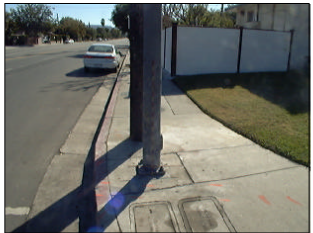
Figure 2. Crash scene. Point of impact with utility pole.