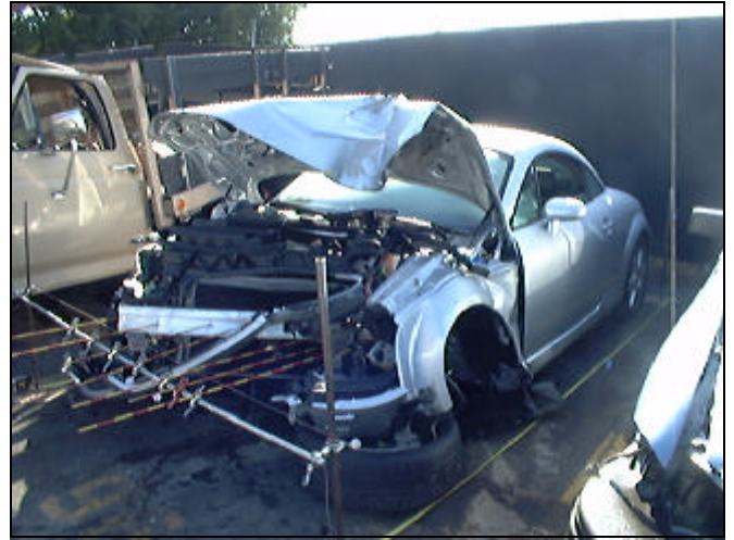
Figure 3. Exterior, Vehicle 1 (Audi TT)

As a result of the frontal pole impact, the supplemental restraint system (driver's and passenger's frontal redesigned air bags) of the case vehicle deployed. The center instrument panel mounted passenger's frontal air bag shut off switch was turned to the "on" position at the time of the crash.