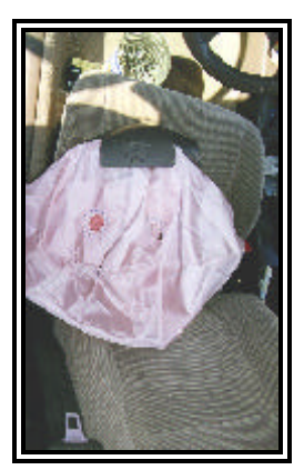
Figure 10. Cover flap and vent ports of the driver air bag.

The front left air bag was removed from the steering wheel by the body shop prior to this on-site investigation. The air bag membrane was constructed of a woven nylon-type fabric and measured 67.9 cm (26.5") in diameter in its deflated state. The bag was tethered internally by four tethers that were stitched to the face of the bag with a 19.7 cm (7.75") tether reinforcement. The bag was vented by two vent ports that measured 3.2 cm (1.25") in diameter and were located 15.9 cm (6.25") apart ( Figure 10 ).