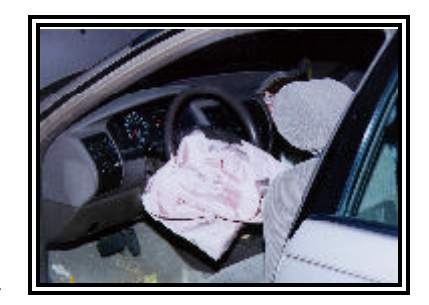
Figure 8. On-scene image of the deployed frontal air bag system

The 1996 Toyota Corolla was equipped with front air bags for the driver and right passenger positions that deployed during the crash sequence ( Figure 8 ). The front left driver air bag was mounted in a typical configuration within the four-spoke steering wheel with H-configuration module cover flaps. The cover flaps opened at the designated tear points. The upper flap measured 7.6 cm (3.0") vertically while the lower flap measured 7.0 cm (2.75"). The width of the flaps measured 15.2 cm (6.0") at the horizontal tear seam. There were no apparent occupant contact points or damage to the cover flaps.