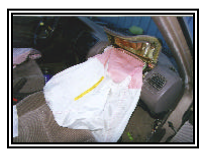
Figure 12. Deformed module cover flap.

The front right air bag was non-tethered and was vented by two 6.0 \, \mathrm{cm} \, (2.375") diameter vent ports on both the inboard and outboard side surfaces of the bag. These ports were located 32.4 \, \mathrm{cm} \, (12.75") below the inflated horizontal top plane of the air bag. The air bag material was a white color nylon and constructed of a fine fabric weave. There was a reddish nylon overwrap panel located at the inflator unit which measured 21.6 \, \mathrm{cm} \, (8.5") laterally at the top and 25.4 \, \mathrm{cm} \, (10.0") laterally at the bottom. The bottom edge of the panel was frayed due to the designed separation of the panel during air bag expansion. There was no discernable occupant contact on this panel.