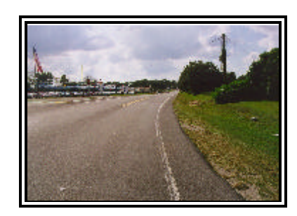
Figure 2. Crash site in the area of impact.

The crash occurred on a two lane, north/south state route near a three-leg T intersection ( Figure 2 ). In the vicinity of the crash site, the asphalt road surface was level and curved to the right, with respect to the involved vehicle's direction of travel. The radius of curvature was calculated at 136.2 m (446.8'). The travel lanes were 3.8 m (12.5') and 3.6 m (11.8') in width for the south and northbound lanes respectively. The travel lanes were bordered by asphalt shoulders that were 1.2 m (3.9') in width with grass bordering both shoulders. At the