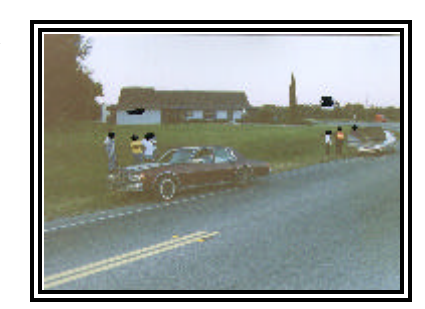
Figure 4. Final rest of the involved vehicles.

while the Chevrolet Impala experienced a 11.5 km/h (7.1 mph). The longitudinal components were -21.3 km/h (-13.2 mph) and 11.5 km/h (7.1 mph) respectively. The delta V values were consistent with the crush profiles of both vehicles. The Impala was displaced forward and came to rest approximately 15 m (49') south of the point of impact, straddling the right asphalt shoulder and the adjacent grassy area( Figure 4 ). The position of the Impala indicated that the driver may have steered to the right after the impact, or had the wheels turned to the right prior to impact. The Toyota Corolla continued approximately 3 m (10') forward before coming to rest straddling the west (right) edgeline.