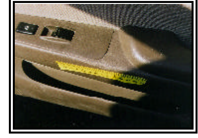
Figure 7. Tissue transfer to the right door armrest.

There was a circular pattern of air bag generant residue on the left side of the windshield that resulted from the exhaust gases from the front left