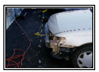
Figure 6. Profile view documenting the extent of frontal crush.