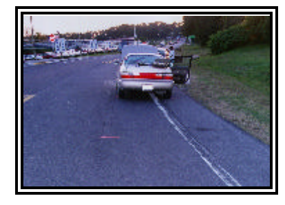
Figure 3. Pre-crash skid marks of the Toyota.

The driver of the Toyota Corolla steered to the right, while applying full brakes in an attempt to avoid the crash. The Toyota skidded 8 m (26') in a tracking mode ( Figure 3 ) on the dry asphalt road surface to impact with the rear of the Chevrolet. It should be noted that the crash occurred to the right of the southbound travel lane, therefore it was unknown if the driver of the Chevrolet attempted to steer right to avoid the impending crash or if she was driving to the right of the travel lane. The crash schematic is attached as Figure 15 , Page 13.