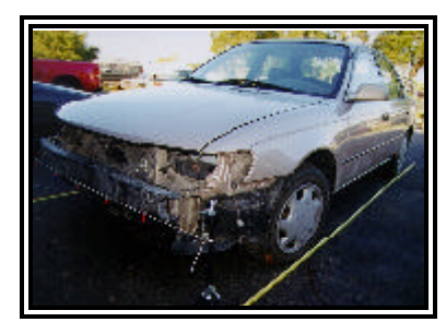
Figure 5. Front left view of the exterior damage to the Toyota.

The Collision Deformation Classification (CDC) for the frontal damage to the 1996 Toyota Corolla was 12-FDEW-1. Figures 5 and 6 are exterior views of the Toyota Corolla.