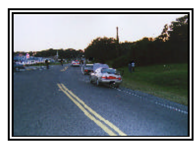
Figure 1. On-scene view of the involved vehicles at final rest.

This on-site investigation focused on the injury mechanisms that resulted in serious injury to a 6 year old female front right passenger of a 1996 Toyota Corolla. The Toyota was equipped with frontal air bags for the driver and front right passenger that deployed as a result of a moderate severity front-to-rear crash sequence with a 1978 Chevrolet Impala. Figure 1 is an on-scene view of the crash site. The improperly restrained child passenger of the Toyota was displaced forward by pre-crash braking, into the path of the deploying front right air bag. The child's involvement with the deploying air bag membrane resulted in a closed head injury with brief loss of consciousness, cervical strain, abrasions of the scalp, face, chin, anterior neck, and a right brachial