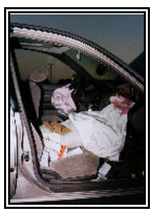
Figure 11. Deployed front right air bag.