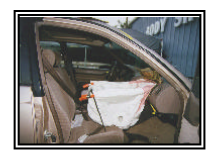
Figure 14. Excursion of the front right air bag.

The right front seat was adjusted to a mid track position. In this position, the front right seat back rest measured 76.2 cm (30.0") rearward from the leading edge of the front right air bag module cover flap at a height of 38.1 cm (15.0") above the junction with the seat cushion. The leading edge of the seat cushion measured 27.9 cm (11.0") above the floor and 17.8 cm (7.0") rearward from the projected vertical plane of the instrument panel. The seat cushion was inclined 13 degrees while the seat back support was 28 degrees rearward from vertical.