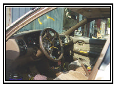
Figure 9. Driver position with air bag generant on windshield.