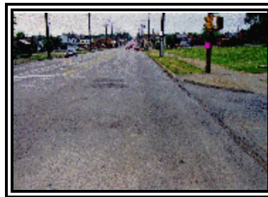
Figure 2: Northbound view of the area of impact.