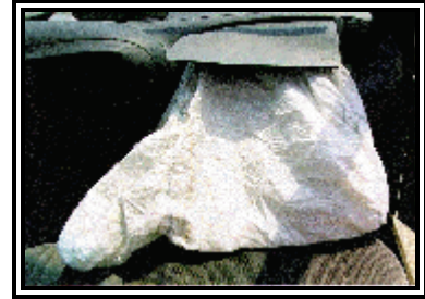
Figure 11: View of the front passenger air bag.

overall dimensions of the face of the deflated bag were 81 cm x 61 cm (32 in x 24 in), width by height. The air bag extended rearward approximately 46 cm (18 in), measured from the lower edge of the cover flap.