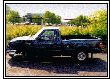
Figure 5: Left side view of the Ford Ranger.

The Ford Ranger sustained 127.5 cm (49.5 in) of direct contact damage to the forward portion of the left side plane ( Figure 5 ). The direct contact damage began 221 cm (87 in) forward of the left rear axle and continued to the left front bumper corner. The impact was approximately centered on the left front suspension and displaced the tire and rim from the axle. The measured crush profile at the trim elevation was as follows: C1=0, C2=12.7 cm (5.0 in), C3=22.9 cm (9.0 in), C4=20.9 cm (8.2 in), C5=17.5 cm (6.9 in), C6=5.1 cm (2.0 in). The Ranger's entire front structure was displaced laterally (slightly) to the right restricting the operation of the right door. The CDC of the Ranger was 09-LFEW-03.