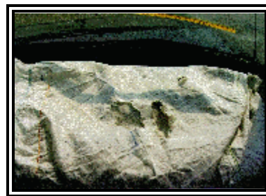
Figure 13: View of holes in the bottom surface of the PAB.