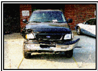
Figure 3: Front view of the Ford F150.

The Ford F150 sustained 114.3 cm (45.0 in) of direct contact damage to the center and right portions of the front plane ( Figures 3 and 4 ). The direct contact began 24.1 cm (9.5 in) left of center and continued to the front right bumper corner. The measured crush profile at the elevation of the front bumper, across the 114.3 cm (45.0 in) field L, was as follows: C1=10.2 cm (4.0 in), C2=19.8 cm (7.8 in), C3=10.2 cm (4.0 in), C4=5.1 cm (2.0 in), C5=3.8 cm (1.5 in), C6=7.6 cm (3.0 in). The right front fender was buckled restricting the operation of the right door. There was no measurable change in the wheelbase dimensions. The Ford sustained disabling damage and was towed to the police impound post-crash. However, the vehicle was still operational, as it was started and driven out of the garage bay at the SCI inspection. The Collision Deformation Classification (CDC) of the vehicle was 12-FZEW-01. The barrier equivalent delta V calculated by the WINSMASH model was 16.1 km/h (10.0 mph)