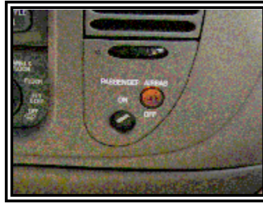
Figure 9: View of the air bag cut-off switch in the OFF position.

The driver air bag module was located in the typical manner in the center hub of the tilt steering wheel. The steering wheel was adjusted to the full down position. There was no steering wheel rim deformation or movement of the steering column's shear capsules. The H-configuration air bag module flaps opened as designed at the designated tear points during the deployment sequence. The height of the upper flap measured 16.5 cm (6.5 in). The width of the upper flap measured 19.3 cm (7.6 in) at the center seam and tapered to 14.0 cm (5.5 in) at the hinge. The date 6/11/97 was stamped on the interior surface of the upper flap. The width of the lower flap measured 19.3 cm (7.6 in) and tapered to 14.0 cm (5.5 in) over its height of 6.4 cm (2.5 in).