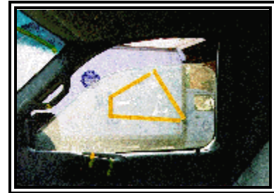
Figure 7: View of the right side interior contacts.

Figure 7 is a view of 4 specific contacts to the right side interior of the F150. The right hand grip attached to the A-pillar was scuffed and abraded along its outer surface. The right door pull was scuffed on its lower center aspect. A 30 cm x 18 cm (12 in x 7 in) width by height area of vinyl transfers was identified on the right window glazing and the center aspect of the upper window frame was impacted. All these contacts were linked to an interaction with the fractured carrier handle of the child seat. The carrier handle was fractured by the deployment of the air bag.