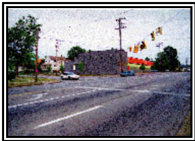
Figure 1: Overall southeasterly view of the intersection.

This two-vehicle crash occurred in the afternoon hours of May, 1998. At the time of the crash, it was daylight and the weather was not a factor. The crash occurred at the urban intersection of a north/south five lane local roadway and an east/west two lane roadway. The north/south roadway was configured for two travel lanes in each direction, with a center left turn lane. The east/west roadway was configured for a single travel lane in each direction, with a center left turn lane. The intersection was controlled by standard (red/amber/green) traffic signals. The speed limit in the area of the crash was 40 km/h (25 mph). Figure 1 is an overall southeasterly view of the intersection. Figure 2 is a northbound view of the area of impact.