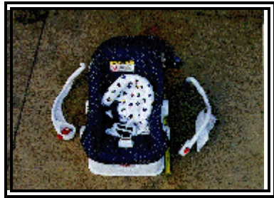
Figure 14: View of the Evenflo rear facing child seat.

of the car seat's seat back was also fractured in the deployment ( Figure 15 ). The location of the seat back fractured corresponded to the location of the child's head injury.