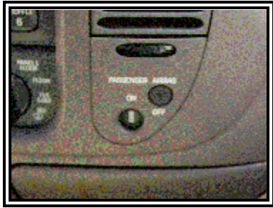
Figure 8: View of the air bag cut-off switch in the ON position.