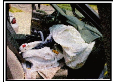
Figure 16: View of the reconstructed at-crash position of the child seat.

During the course of the SCI inspection, the approximate position of the restraint within the vehicle at the time of the crash was reconstructed. The position of the vehicle's seat and the rear facing restraint was determined through the use of the on-scene police photographs. The horizontal distance between the back of the car seat and the lower edge of the front passenger air bag module measured 30 cm (12 in). Figure 16 is a view of the car seat with the front passenger air bag extended rearward.