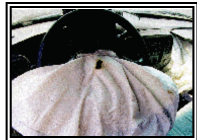
Figure 10: View of a hole in the driver air bag 12 o'clock sector.

The back side of the driver's air bag was scuffed in all four quadrants indicative of an impeded deployment due to the forward position of the unrestrained driver. The shape of the scuff marks matched to the configuration of the flaps. A 3.8 cm (1.5 in) diameter burn hole was noted in the 12 o'clock sector on the back side of the bag, Figure 10 . This hole was caused due to post-crash contact between the hot inflator and the deflating air bag membrane.