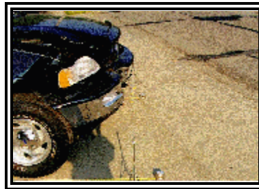
Figure 4: Right lateral view across the front plane.