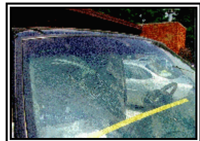
Figure 6: View of the windshield fracture and air bag fabric transfers.

A fracture of the right aspect of the windshield was located 16.5 cm (6.5 in) left of the A pillar and 28 cm (11 in) below the header ( Figure 6 ). Surrounding the fracture site was an area of air bag fabric transfers that measured approximately 48 cm x 38 cm (19 in x 15 in), width by height. The windshield fracture resulted from the altered deployment path of the front passenger air bag due to the placement of the rear facing child seat in the front right of the vehicle.