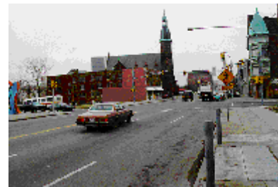
Figure 1. Overview of the crash scene.

This crash occurred during the early afternoon hours in an urban four-leg intersection which was controlled by an overhead signal. The posted speed limit was 48 km/h (30 mph) for north and southbound travel lanes and the asphalt roadway was dry with a three percent grade, negative to the south. Traffic flow at the time of the crash was moderate to heavy. Figure 1 identifies an overall view of the crash scene.