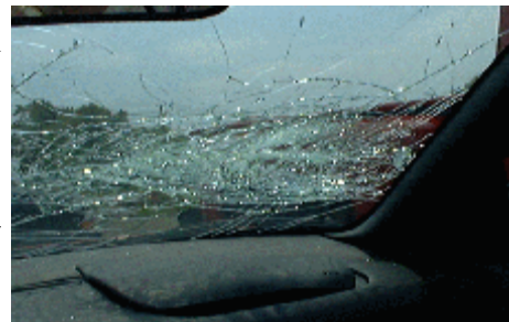
Figure 6. Right side windshield fracture and front right air bag module cover flap.

A fracture was evident on the right side of the windshield which resulted from contact with the front right air bag module cover flap as it opened to deploy the air bag. The center of the fracture was located 34.0 cm (13.4 in) right of the vehicle's center and 86.0 cm (33.9 in) above the floor of the Sunfire. The fracture had a measured width of 52 cm (20.5 in) and height of 24 cm (9.4 in). Figure 6 identifies the fractured windshield and the front right air bag module cover flap.