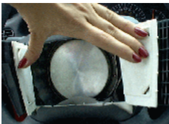
Figure 8. Front driver air bag module.

The horn touch pads were reinforced by a white plastic module encasement which was identified by Part No. 1657337, Lot # 26271A1. Figure 8 identifies the air bag module. The front driver air bag was not available for inspection and insurance photographs which captured the air bag were not useful for identification purposes.