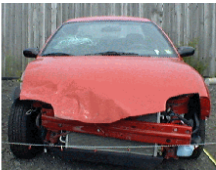
Figure 3. Damage to the frontal plane of the Sunfire

The Pontiac Sunfire sustained moderate damage to its frontal plane resultant of its initial impact with the Taurus. Direct contact damage began at the front right bumper corner and extended 93.3 cm (36.7 in) to the left. The bumper fascia was separated from the vehicle's reinforcement bar and direct damage was located vertically from the lower bumper fascia to the right aspect of the hood face. Maximum crush was measured at 37 cm (14.6 in) at the bumper reinforcement bar and was located 10.5 cm (4.1 in) right of the vehicle's center. The damage resulted in a 12 o'clock direction of force with a Collision Deformation Classification (CDC) of 12-FZEW-2. The minor secondary impact sequence resulted in direct contact damage that began at the front left bumper corner and extended right approximately 30.0 cm (11.8 in). The damage resulted in an 11 o'clock direction of force with a CDC of 11-FLLW-1. Figures 3 and 4 identify the damage sustained to the frontal plane of the Sunfire.