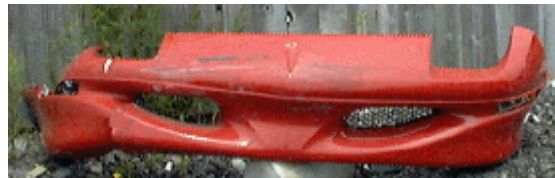
Figure 4. Sunfire's bumper fascia direct contact damage.

The Ford Taurus sustained moderate damage to its right side plane resultant of impact with the Sunfire. The initial impact to the right fender and right front door generated direct contact damage which consisted of red paint transfers and began 102 cm (40 in) forward of the right rear axle and extended 243 cm (96 in) forward. Maximum crush was measured at 14.5 cm (5.7 in) and was located 247.8 cm (97.6 in)