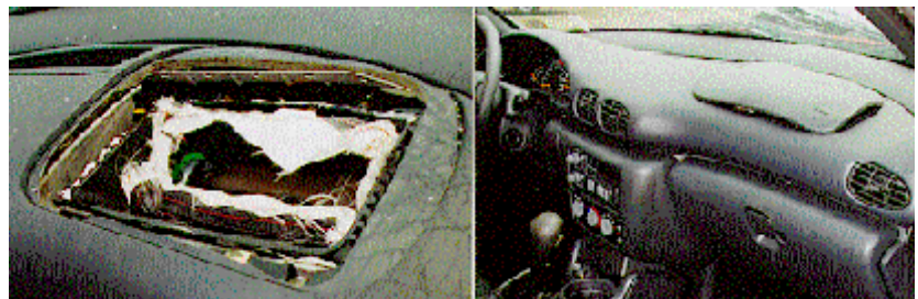
Figure 9. Front right air bag module and its cover flap of the Sunfire.

The front right air bag deployed from a top mounted module assembly that was incorporated within the upper right instrument panel. The single flap was hinged at the forward edge and opened in an upward direction toward the windshield. The flap had a measured maximum width of 33 cm (13 in) and maximum height of 27 cm (10.6 in) and it was identified by 22603255 05 97. The leading edge of the cover flap sustained abrasions resultant of windshield contact as it opened to deploy the air bag. The front right air bag was not available for inspection and insurance photographs which captured the air bag were not useful for identification purposes. Figure 9 identifies the front right air bag module and its cover flap.