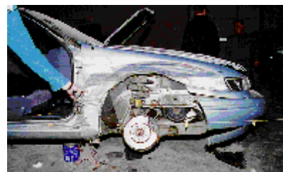
Figure 5. Right fender damage sustained by the ACN equipped Ford Taurus.

The Ford Taurus sustained moderate damage to its right side plane resultant of impact with the Sunfire. The initial impact to the right fender and right front door generated direct contact damage which consisted of red paint transfers and began 102 cm (40 in) forward of the right rear axle and extended 243 cm (96 in) forward. Maximum crush was measured at 14.5 cm (5.7 in) and was located 247.8 cm (97.6 in)