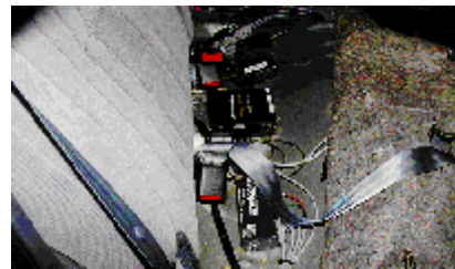
Figure 2. View of the installed position of the ACN unit's IVM, backup battery, and cellular phone transceiver.