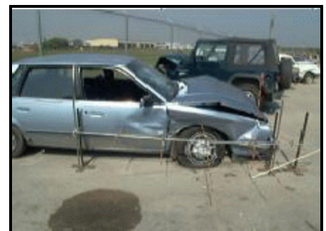
Figure 4. View showing right fender damage to Vehicle 1 (Impact #1)