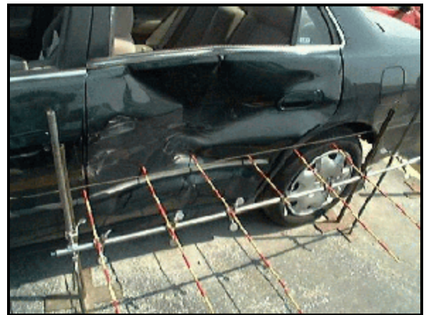
Figure 6. Secondary sideslap damage to the left rear door of Vehicle 2