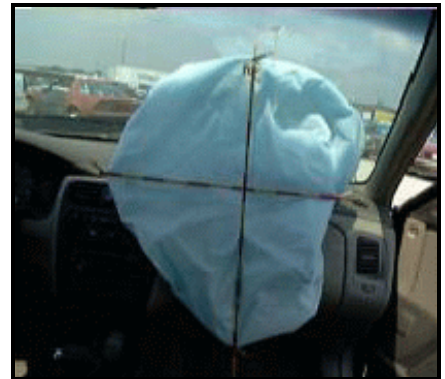
Figure 11. Deployed passenger air bag