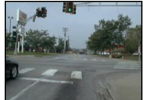
Figure 2. Pre-impact trajectory of Vehicle 2 and area of impact