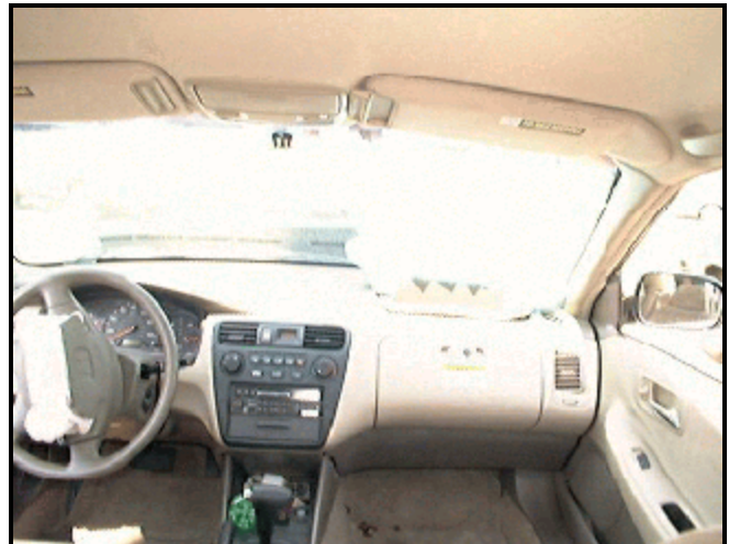
Figure 13. Passenger's seated position