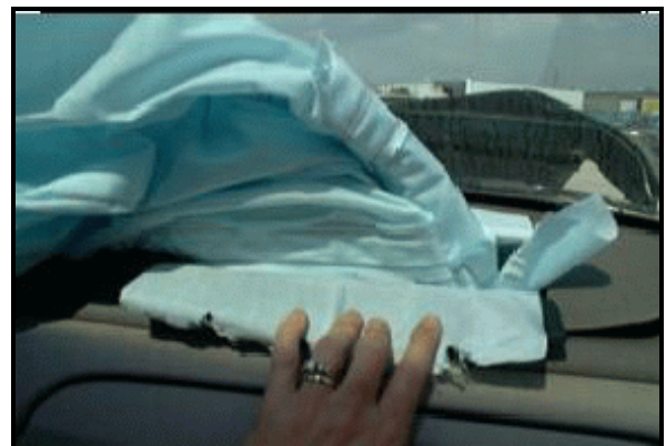
Figure 11. Close-up view showing folds in passenger air bag that did not fill with air bag gases