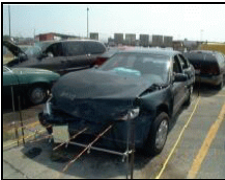
Figure 7. View showing frontal deformation to Vehicle 2 (1998 Honda Accord)