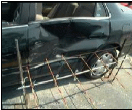
Figure 8. View showing sideslap damage to Vehicle 2's left rear door