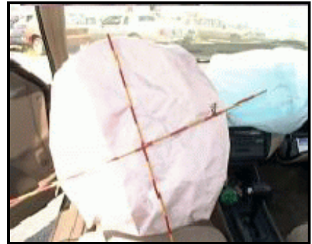
Figure 9. Deployed driver's air bag

The front, right passenger air bag is located on the instrument panel (top mount). The module deployment door is rectangular in shape and is equipped with double horizontal cover flaps that are symmetrical in design (23 cm wide x 4.7cm in height). Upon deployment, the encased, folded air bag did not fully deploy. Some of the folds located in the right upper quadrant of the module remained folded. Approximately 3/4 of the air bag capacity was filled upon deployment. The non-tethered air bag was undamaged and was equipped with two vent port holes which are at the 10 and 2 o'clock positions.