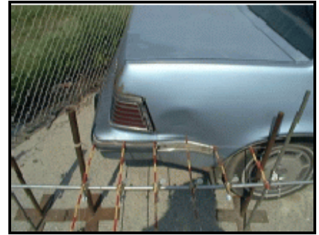
Figure 5. Secondary Sideslap damage to right quarter panel of Vehicle 1 (1982 Pontiac 6000)

The driver and passenger of Vehicle 1 exited their vehicle and fled the scene on foot. One of the young males was reportedly bleeding from facial injuries. It is unknown if the driver of Vehicle 3 was injured in the crash.