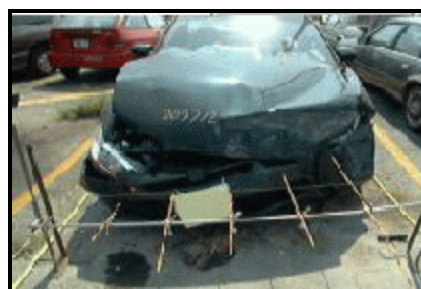
Figure 3. Front view of Vehicle 2 (Honda)