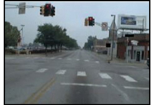
Figure 1. Pre-impact trajectory of Vehicle 1 showing point of impact in foreground

Vehicle 3 was driven by a 41 year-old-male and it is unknown whether he was restrained.