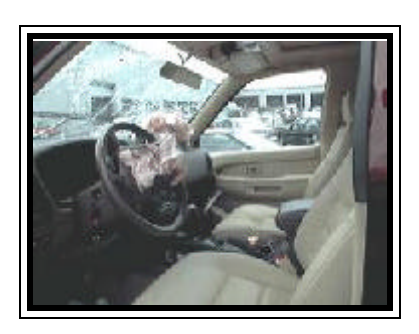
Figure 4. Interior view.

Interior damage to the Nissan identified through the NASS vehicle inspection was minimal and was attributed to occupant contact ( Figure 4 ). A small indentation and scuff marks were documented to the driver knee bolster (rigid plastic type). The turn signal arm affixed to the steering column was deformed. Blood spattering was noted on the face of the driver air bag along with spattering to the lower left quadrant of the passenger air bag. Two small spider-web type fractures were identified at the left windshield area. The glove compartment door was found open and deformed along with a