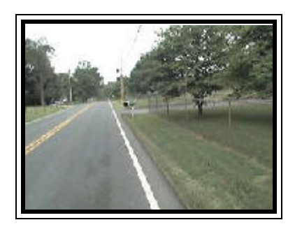
Figure 1. Westbound approach for the 1998 Nissan Pathfinder.

The 38 year old female driver of the 1998 Nissan Pathfinder was operating the vehicle westbound ( Figure 1 ) when she apparently lost consciousness due to low blood sugar (confirmed by EMS at the scene post-crash) and allowed the vehicle to drift off the right (north) pavement edge. Upon recognition of the impending harmful event, the 11 year old male front right passenger attempted to reach over and revive the driver, but to no avail.