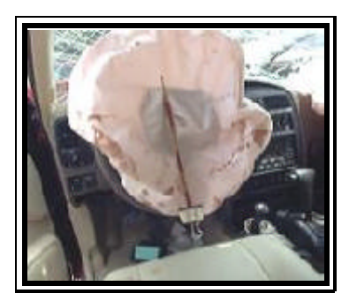
Figure 5. 1998 Nissan Pathfinder redesigned driver air bag.

The 1998 Nissan Pathfinder was equipped with redesigned frontal air bags for the driver and front right passenger positions. The air bags had deployed as a result of the crash. The driver air bag was housed in the center of the steering wheel with a horizontally oriented flap tear seam (H-configuration). The flaps were asymmetrical in shape as the upper flap measured 14.0 cm (5.5 in) in width and 10.0 cm (3.9 in) in height while the lower flap measured 14.0 cm (5.5 in) in width and 8.0 cm (3.1 in) in height. Although no contact evidence was identified on the exterior surface of the module cover flaps, blood spattering was noted on the upper and lower sections the air bag which was attributed to the driver's hand injury. The NASS