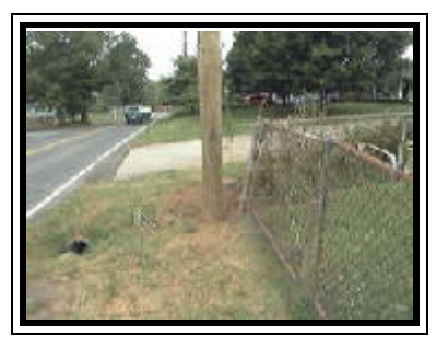
Figure 2. Utility pole impact location (pole replaced).