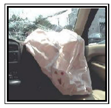
Figure 6. 1998 Nissan Pathfinder redesigned passenger air bag.

upper flap measured 28.0 cm (11.0 in) in width and 7.0 cm (2.8 in) in height while the lower flap measured 28.0 cm (11.0 in) in width and 5.0 cm (2.0 in) in height. Although no contact evidence was identified on the exterior surface of the module cover flaps, blood spattering was noted to the lower left quadrant of the air bag which could be attributed to the driver's right hand injury or an unreported bloody nose sustained by the passenger. The NASS researcher measured the passenger air bag at 70.0 cm (27.6 in) in width and 58.0 cm (22.8 in) in height in its deflated state ( Figure 6 ). No internal tether straps were present. The bag was vented by two ports located at the 10 o'clock and 2 o'clock sectors on the side aspect of the air bag. No cutoff switch was reported for the front right air bag.