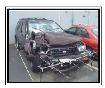
Figure 3. Frontal damage to the 1998 Nissan Pathfinder.

The Nissan Pathfinder sustained moderate (overlapping) frontal damage as a result of the impact with the utility pole ( Figure 3 ). The direct contact damage began at the front right bumper corner and extended 35.0 cm (13.8 in) inboard. The impact deformed the full frontal width resulting in a combined direct and induced damage length (Field L) of 130.0 cm (51.2 in). Six crush measurements were documented at the level of the bumper: C1= 0 cm, C2= 0 cm, C3= 9.0 cm (3.5 in), C4= 21.0 cm (8.3 in), C5= 37.0 cm (14.6