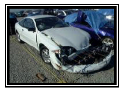
Figure 3. Frontal damage to the 1998 Chevrolet Cavalier.

laterally to the right which restricted the right front wheel/tire (not deflated). The windshield was fractured from the (interior) front right air bag module cover flap.