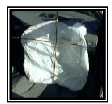
Figure 6. 1998 Chevrolet Cavalier redesigned passenger air bag.

The front right passenger air bag deployed from a top mount module in the right instrument panel with a single cover flap design hinged at the forward aspect. There was no contact evidence on the air bag or exterior surface of the module cover flap which opened in an upward direction towards the windshield. The cover flap was asymmetrical in shape and measured 32.0 cm (12.6 in) in width and 27.0 cm (10.6 in) in height along the left edge of the flap and 19.0 cm (7.5 in) along the right edge. The NASS researcher measured the passenger air bag at 50.0 cm (19.7 in) in width and 58.0 cm (22.8 in) in height in its deflated state ( Figure 6 ). No tether straps or vent ports were present. No cutoff switch was reported for the front right air bag.