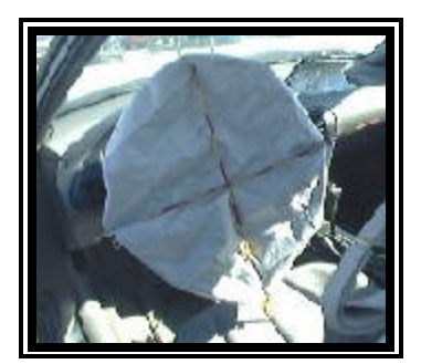
Figure 5. 1998 Chevrolet Cavalier redesigned driver air bag.

The 1998 Chevrolet Cavalier was equipped with redesigned frontal air bags for the driver and front right passenger positions. The air bags had deployed as a result of the crash. The driver air bag was housed in the center of the steering wheel with a vertically oriented flap tear seam (I-configuration). The flaps were symmetrical in shape and measured 11.0 cm (4.3 in) in width and 10.0 cm (3.9 in) in height. No contact evidence was identified on the air bag or exterior surface of the module cover flaps. The NASS researcher measured the diameter of the driver air bag at 60.0 cm (23.6 in) in its deflated state ( Figure 5 ). No internal straps were present. The bag was vented by two ports located at the 3 o'clock and 9 o'clock sectors on the rear aspect of the air bag.