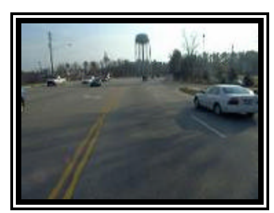
Figure 2. Southbound approach for the 1998 Ford Explorer.