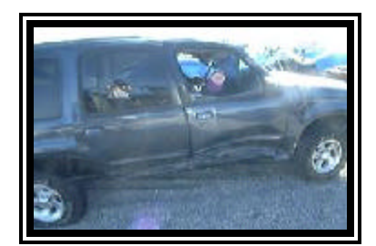
Figure 4. Right side damage to the 1998 Ford Explorer.

The Ford Explorer sustained moderate right side damage as a result of the impact with the Chevrolet Cavalier ( Figure 4 ). The direct contact damage began 64.0 cm (25.2 in) aft of the right front axle and extended 172.0 cm (67.7 in) rearward. The impact resulted in a combined direct and induced damage length (Field L) of 172.0 cm (67.7.0 in). The direct contact damage was concentrated between the A and C-pillars at the level of the frame. Induced damage was noted to the upper window frame of the right rear door with no resulting integrity loss. Direct contact damage was documented to the top plane (from the rollover) which extended down the entire length of the vehicle. A maximum crush value of 24.0 cm (9.4 in)