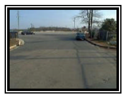
Figure 1. Eastbound approach for the 1998 Chevrolet Cavalier.

within the vehicle's trajectory indicative of driver avoidance maneuvers. The Ford was also occupied by a 37 year old female in the front right position along with a 12 year old female in the rear left position and 14 year old male in the rear right position.