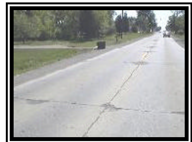
Figure 1. Southbound approach for the 1998 Cadillac Deville.

The 71 year old female driver of the 1998 Cadillac Deville was operating the vehicle southbound at a (driver reported) speed of 72 km/h (45 mph) when for unknown reasons, she allowed the vehicle to depart the left (east) pavement edge in a forward tracking mode ( Figure 1 ). There were no brake marks documented within the vehicle's trajectory indicative of driver avoidance maneuvers.