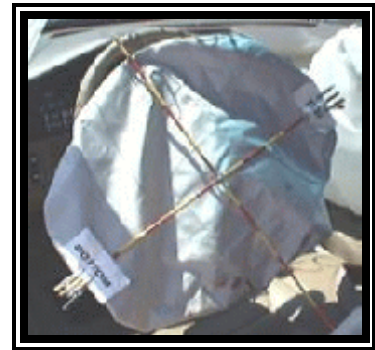
Figure 5. 1998 Cadillac Deville redesigned driver air bag.

The 1998 Cadillac Deville was equipped with redesigned frontal air bags for the driver and front right passenger positions. The air bags had deployed as a result of the crash. The driver air bag was housed in the center of the steering wheel with a vertically oriented flap tear seam (I-configuration) which followed the contour of the Cadillac emblem on the center of the hub. The flaps were symmetrical in shape and measured 10.0 cm (3.9 in) in width and 11.0 cm (4.3 in) in height. Although no contact evidence was identified on the exterior surface of the module cover flaps, lipstick transfers were documented to the upper right quadrant along with blood spattering to the lower right quadrant of the air bag. The NASS researcher measured the diameter of the driver air bag at 60.0 cm (23.6 in) in its deflated state ( Figure 5 ). No internal tether straps were present. The bag was vented by two ports located at the 3 o'clock and 9 o'clock sectors on the rear aspect of the air bag.