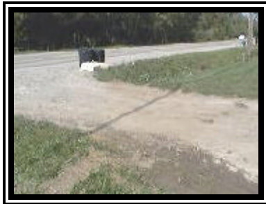
Figure 3. Northwest lookback view showing depth of ditch and trajectory to final rest.