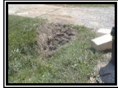
Figure 2. Southeast view of impacted ditch.

As the Cadillac exited the east pavement edge of the rural two lane roadway, it traveled 3.0 meters (9.8 feet) to impact with the ditch. The front left area pitched slightly downward as it struck the ditch at the leading edge of a private driveway ( Figures 2&3 ), resulting in moderate damage. The impact induced deceleration was sufficient to deploy the Cadillac's redesigned frontal air bag system. Although the impact was classified as out of scope (yielding object), the damage algorithm of the WinSMASH program computed a (barrier equivalent) velocity change of 18.9 km/h (11.7 mph). The specific longitudinal component was -18.6 km/h (-11.6 mph) with a lateral component of 3.3 km/h (2.1 mph). The Collision Deformation Classification (CDC) for this impact to the Cadillac Deville was 12-FYEW-2. The vehicle continued in a southeasterly direction approximately 12.0 meters (39.3 feet) and came to rest in a private yard facing southeast.