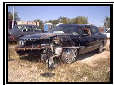
Figure 4. Frontal damage to the 1998 Cadillac Deville.

The 1998 Cadillac Deville sustained moderate frontal damage as a result of the impact with the ditch ( Figure 4 ). The direct contact damage began at the front left bumper corner and extended 75.0 cm (29.5 in) inboard. The impact deformed the full frontal width resulting in a combined direct and induced damage length (Field L) of 153.0 cm (60.2 in). Six crush measurements were documented at the level of the bumper: C1= 30.0 cm (11.8 in), C2= 19.0 cm (7.5