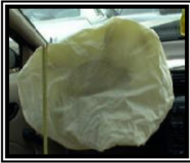
Figure 5. 1998 Saturn SC1 redesigned driver air bag.