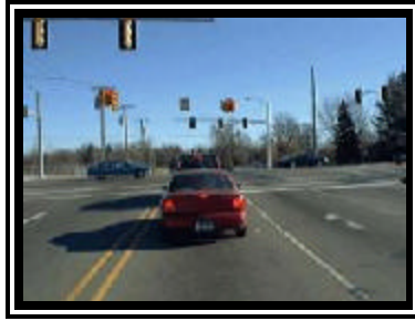
Figure 1. Eastbound approach for the 1995 Oldsmobile Achieva.