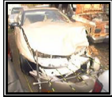
Figure 3. Frontal damage to the 1998 Saturn SC1 2-door coupe.

The 1998 Saturn SC1 2-door coupe sustained moderate frontal damage as a result of the impact with the Oldsmobile Achieva ( Figure 3 ). The direct contact damage began at the front left bumper corner and extended 63.0 cm (24.8 in) inboard. The impact deformed the full frontal width resulting in a combined direct and induced damage length (Field L) of 101.0 cm (39.8 in). Six crush measurements were documented at the level of the reinforcement bar ( bumper fascia separation ): C1= 16.0 cm (6.3 in), C2= 37.0 cm (14.6 in), C3= 28.0 cm (11.0 in), C4= 19.0 cm (7.5 in), C5= 8.0 cm (3.1 in), C6= 0 cm. The ( revised ) Collision Deformation Classification (CDC) for this impact to the Saturn was 12-FYEW-2 with a principal direction of force of (-)10 degrees. The left fender/hood area was displaced rearward from the impact force. Reduction in the left side wheelbase measured 8.0 cm (3.1 in). All glazing remained intact.