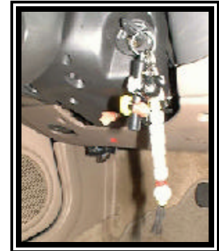
Figure 4. Scuff marks to the knee bolster and steering column.

Damage to the interior surfaces of the Saturn SC1 were minimal and attributed to occupant contact ( Figure 4 ). Scuff marks were identified on the left side of the knee bolster (rigid plastic type) and right side of the steering column. No intrusions were found in the vehicle.