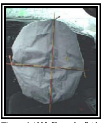
Figure 6. 1998 Chevrolet S-10 Blazer redesigned driver air