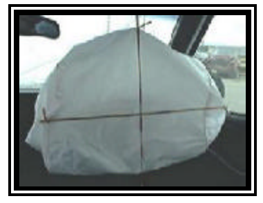
Figure 8. 1998 Chevrolet S-10 Blazer redesigned passenger air bag.