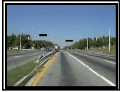
Figure 2. Northbound approach for the 1991 Ford Mustang LX.