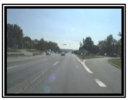
Figure 1. Southbound approach for the 1998 Chevrolet S-10 Blazer.