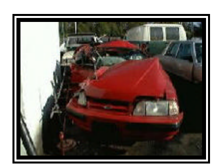
Figure 4. Right side surface damage to the 1991 Ford Mustang LX.

Direct contact damage was also identified along the left side surface attributed to the secondary (sideslap) impact. The direct contact damage began 64.0 cm (25.2 in) forward of the left rear axle and extended 240.0 cm (94.5 in) forward. The combined direct and induced damage length (Field L) began 43.0 cm (16.9 in) forward of the left rear axle and extended 262.0 cm (103.1 in) forward. Six crush measurements were documented at the level of the mid-door: C1= 1.0 cm (0.4 in), C2= 1.0 cm (0.4 in), C3= 6.0 cm (2.4 in), C4= 3.0 cm (1.2 in), C5= 0 cm, C6= 1.0 cm (0.4 in). The Collision Deformation Classification (CDC) for this second and final impact to the Chevrolet was 09-LYEW-1 with a principal direction of force of (-)90 degrees. The left front door window glazing was disintegrated by the impact force.