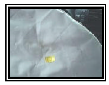
Figure 7. Smudge mark to the upper right quadrant of the driver air bag face.