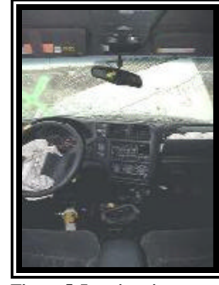
Figure 5. Interior view.

Damage to the interior surfaces of the Chevrolet Blazer were minimal and attributed to component intrusions and occupant contact. Scuff marks were identified on the left door panel, knee bolster and lower center instrument panel area. A scuff mark was also documented on the steering column with the cover panel out-of-place. The rear view mirror and floor mounted console were fractured and displaced to the right. Deformation to the upper portion of the steering wheel rim measured 1.0 cm (0.4 in). Longitudinal intrusions involved 3.0 cm (1.2 in) of front left and 7.0 cm (2.8 in) of front right toepan intrusion.