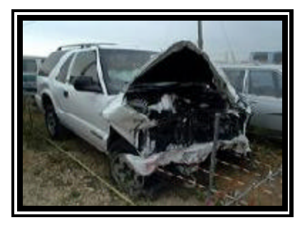
Figure 3. Frontal damage to the 1998 Chevrolet S-10 Blazer.

The 1998 Chevrolet S-10 Blazer sport utility vehicle sustained severe frontal damage as a result of the impact with the Ford Mustang ( Figure 3 ). The direct contact damage encompassed the entire frontal width resulting in a combined direct and induced damage length (Field L) of 137.0 cm (53.9 in). Six crush measurements were documented at the level of the bumper: C1= 24.0 cm (9.4 in), C2= 22.0 cm (8.7 in), C3= 35.0 cm (13.8 in), C4= 43.0 cm (16.9 in), C5= 51.0 cm (20.1 in), C6= 52.0 cm (20.5 in). The Collision Deformation Classification (CDC) for