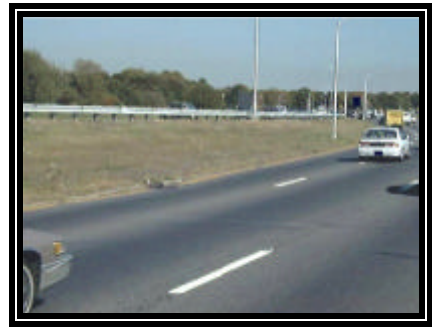
Figure 3. View of median and rollover trajectory

The front right aspect of the BMW impacted the outboard guardrail as the vehicle departed the roadway. Paint transfers were noted on the guardrail from the BMW's contact. The guardrail impact snagged the right front tire/wheel assembly which resulted in complete separation of the suspension components. The BMW was redirected by the guardrail and traveled across the three eastbound travel lanes in a CCW yaw. The BMW initiated a rollover onto the grassy median with the right side leading ( Figure 3 ). The damage to the vehicle suggested a longitudinal component in the rollover event. The vehicle appeared to have rolled a total of six quarter-turns. The right front side air bag and right side HPS deployed as a result of the rollover event. It impacted the inboard guardrail for westbound traffic on the opposite side of the median during the fifth quarter turn. The BMW struck the guardrail with the right side area on the fifth quarter turn and with the hood/top aspect on the sixth quarter turn. The unrestrained driver was fully ejected through the windshield and was thrown across the opposing travel lanes and came to rest on a grassy area adjacent to the shoulder. The BMW came to rest on the median adjacent to the opposing guardrail, upside down and facing north.