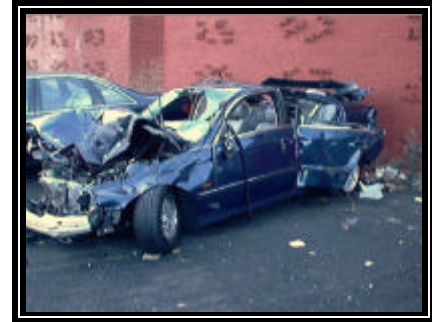
Figure 1. Damaged 1998 BMW 528i

This on-site investigation focused on the performance of the side impact occupant protection system in a 1998 BMW 528i ( Figure 1 ). The BMW was occupied by an unrestrained 26-year-old male driver and a 46-year-old male front right passenger who was restrained by the manual 3-point lap and shoulder belt. The driver of the BMW relinquished control of the vehicle on the outboard lane of a divided state highway. The vehicle departed the right roadside and struck a guardrail which resulted in the separation of the right front wheel assembly. The BMW was redirected across the travel lanes in a counterclockwise (CCW) rotation. The BMW departed the left roadside in a CCW yaw and initiated a rollover onto the grassy median with the right side leading. The BMW