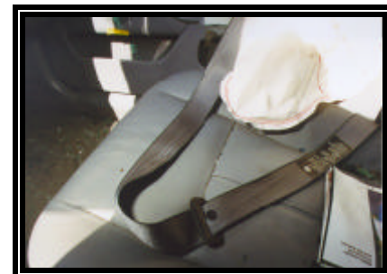
Figure 9. View of front right seat belt showing loading evidence

The front right passenger's seat belt exhibited faint routine wear marks on the latch plate suggestive of infrequent usage. Heavy load marks were present on the inside surface of the webbing (Figure 9). The latch plate stop button was located 42.5 cm (16.3") above the seat track mount. Black vinyl transfers from the latch plate were located 35.5 cm (14.0") above the stop button and extended upward 7.6 cm (3.0") along the full width of the belt webbing. The bottom side of the webbing was heavily abraded in a slight diagonal pattern with fragments of vinyl collected on the latch plate. Creases in the webbing were present 22.8 cm (9.0") above the lower anchorage and extended 20.3 cm (8.0") upward. White stress marks from occupant loading were present on the inside aspect of the webbing 20.3 cm (8.0") above the stop button, and white stretch marks were present 43.2 cm (17.0") above the stop button. There were no D-ring loading marks or transfers.