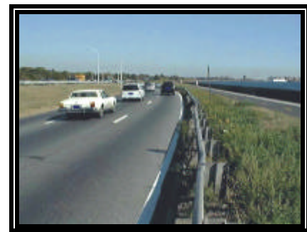
Figure 2. Eastbound approach for the BMW and area of initial guardrail impact

The 26-year-old male driver of the BMW was presumed to have been seated in an upright posture with the seat track adjusted between the mid-track and full-rear positions. The driver was operating the BMW in the outboard eastbound lane of the divided state highway. For unknown reasons, the driver relinquished control of the vehicle and failed to negotiate a left curve. The BMW departed the right side of the roadway in a tracking mode ( Figure 2 ).