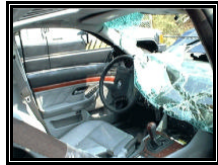
Figure 7. Interior view showing windshield integrity loss

Interior damage to the 1998 BMW 528i was severe and attributed to passenger compartment intrusion and passenger compartment integrity loss ( Figure 7 ). Integrity was lost through the windshield, roof glazing, side glazing, backlight, and the left rear door. The windshield laminate was torn along the middle and lower aspects of the right A-pillar. The laminate was split across the windshield header with the bond intact, split along the entire left A-pillar, and split 20.3 cm (8.0") along the base at the left A-pillar. The tempered glazing of the sunroof, backlight, and side doors disintegrated as a result of the crash. The left rear door opened and the trunk latch released during the crash.