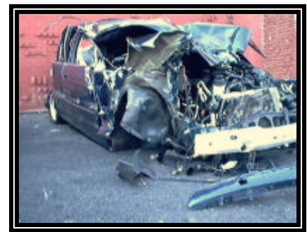
Figure 4. View of front right damage to the BMW 528i

The BMW 528i sustained moderate damage as a result of the initial guardrail impact ( Figure 4 ). The bumper fascia was completely separated from the vehicle and the upper radiator support was separated on the right side. The leading edge of the right front fender was crushed rearward and displaced upward. The right front suspension was fractured and the strut, wheel, and control arm were separated. Longitudinal abrasions were present on the rear right aspect of the hood. The right front fender and door sustained longitudinal abrasions with black and yellow transfers which began 74.9 cm (29.5") forward of the rear edge of the right front door and extended 80.0 cm (31.5") rearward. The SCI-revised Collision Deformation Classification for the initial right side guardrail impact was 12-FREE-9.