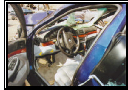
Figure 8. View of driver contacts

Contact evidence from the driver was present in the BMW (Figure 8). The rear view mirror was separated from the mounting point and exhibited body fluid (blood) on the right aspect and hair at the mirror mount. The probable driver ejection path from the vehicle resulted in the 3 cm (1") forward deformation of the upper half of the steering wheel rim, a fracture of the left turn signal arm from the column, left knee contact evidenced by scuff marks on the left aspect of the knee bolster that were located 51 cm (20") left of center and 28 cm (11") below the top aspect, a body fluid (blood) stain on the left side of the bolster, and a possible contact with the left door side impact air bag cover, which was bowed outward.