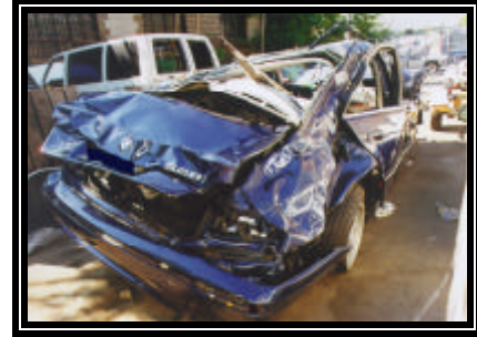
Figure 5. View of right side rollover damage

The damage associated with the impact to the median guardrail was moderate. Direct damage was noted on the right upper A-pillar which appeared to be a result of contact with the median guardrail ( Figure 6 ). The direct contact damage began 50.8 cm (20") forward of the right B-pillar and measured 23.5 cm (9.3") in length. The maximum crush on the right A-pillar measured 5.1 cm (2.0"). A second impact was located on the roof side rail. The direct damage on the right side rail began 12.7 cm (5.0") forward of the right B-pillar and measured 29.2 cm (11.5") in length. The SCI-revised CDC for the impact to the median guardrail was 00-RDAN-2.