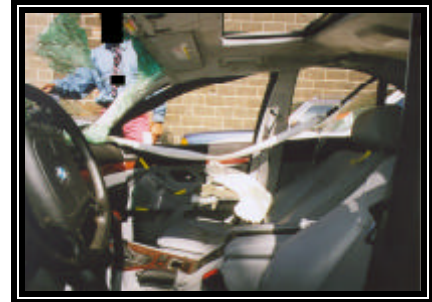
Figure 10. View of deployed front right passenger's side air bag and HPS

The right front passenger's side air bag deployed from the right front door-mounted module that was located above the right front passenger's arm rest. The leather door panel was hinged at the bottom aspect and measured 29.2 cm (11.5") in length on the top aspect, 19.1 cm (7.5") on the in length along the bottom aspect, and 14.0 cm (5.5") in height. The identification sticker on the inside aspect of the cover flap read: "BMW 8212806, >PUR+PA<2". The front right passenger's side air bag measured 44.5 cm (17.5") in width and 26.7 cm (10.5") in height. Tether stitching was present on the inboard center aspect of the air bag in a longitudinal configuration. The stitching measured 29.1 cm (11.5") long, and curled in a downward 5 cm (2") diameter semi-circle fashion on the rear aspect of the air bag face. There was no contact evidence on the surface of the air bag.