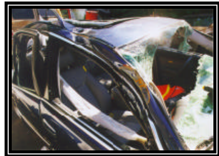
Figure 6. Damage to the right A-pillar and roof side rail

The damage associated with the impact to the median guardrail was moderate. Direct damage was noted on the right upper A-pillar which appeared to be a result of contact with the median guardrail ( Figure 6 ). The direct contact damage began 50.8 cm (20") forward of the right B-pillar and measured 23.5 cm (9.3") in length. The maximum crush on the right A-pillar measured 5.1 cm (2.0"). A second impact was located on the roof side rail. The direct damage on the right side rail began 12.7 cm (5.0") forward of the right B-pillar and measured 29.2 cm (11.5") in length. The SCI-revised CDC for the impact to the median guardrail was 00-RDAN-2.