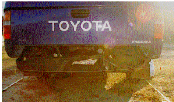
Figure 5. Damage sustained by the rear plane of the Toyota pick-up truck.

The initial impact to the Toyota Tacoma pick-up truck generated direct contact damage that began at the rear right bumper corner and extended 65 cm (26 in) left. The rear bumper was displaced under the tailgate and bed of the pick-up truck. Maximum crush value at bumper level was approximately 62.0 cm (24.4 in) located 57.2 cm (22.5 in) left of the rear right bumper corner. Rear bumper crush measurements are reported in Table 2 . The rear aspect of the right side quarter panel sustained 1.5 cm (0.6 in) of crush. The damage resulted in a 6 o'clock direction of force and a CDC of 06-BZLW-3. Damage to the Tacoma is identified in Figure 5 .