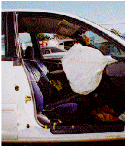
Figure 8. Right lateral view of the deployed front right air bag of the Neon and the passenger compartment.

The front right air bag module was top-mounted in the right instrument panel area. The module cover flap had a measured height of 15.0 cm (5.9 in) and width of 34.5 cm (13.6 in). The acronym SRS and the word “AIRBAG” were molded in the lower right aspect of the module cover flap. The module cover flap did not sustain crash damage, however, a right hand transfer was evident on the center right aspect of the flap. This was resultant of the adult passenger’s right hand as she attempted to brace during the pre-crash sequence. Figure 7 identifies the front right passenger compartment area of the Neon. The right front air bag was equipped with four tethers, two were located at the top seam of the air bag on the right and left aspects and two were located at the bottom seam of the air bag also attached to the right and left side. One vent port was located at the 12 o’clock position. The deflated air bag had a seam to seam measured height of 34 cm ( 13.4 in). Rearward excursion of the front right air bag was 41 cm (16 in) from the leading edge of the instrument panel. The rearward excursion point was 32.0 cm (12.6 in) from the right front seat back in the mid to full back track position. This was the position of the seat track at crash. Figure 8 identifies the right lateral view of the deployed front right air bag and passenger compartment of the Neon.