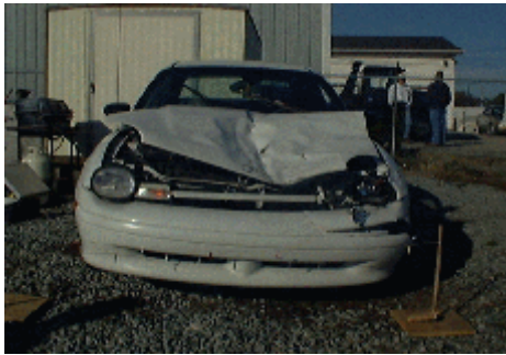
Figure 3. Frontal damage sustained by the Plymouth Neon.

The impact to the Plymouth Neon generated direct contact damage that began at the front left bumper corner and fender area and extended 120 cm (47 in) right. Underriding damage was located on the center aspect of the hood face that consisted of blue paint transfers and longitudinal abrasions. Maximum crush was located at the radiator support level with a value 13 cm (5 in) and measured 26.8 cm (10.5 in) right of the left front bumper corner. Crush Values are reported in Table 1 . The damage resulted in an 12 o'clock direction of force and a Collision Deformation Classification (CDC) of 12-FYMW-1. Damage sustained by the Neon is identified in Figures 3 and 4 .