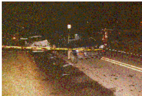
Figure 1. On-scene image of the involved vehicles' final rest position.

This on-site investigation focused on the deployment of the front left and front right air bag system of a 1996 Plymouth Neon, 4-door sedan, and the subsequent fatality of an unrestrained three year old female seated on the lap of the right front seated passenger. The front of the Neon impacted the back plane of a 1996 Toyota Tacoma, 4x2 pick-up truck, in a front-to-rear type impact configuration. This impact initiated the deployment sequence of the front left and front right air bag system of the Neon. The pick-up truck was subsequently displaced forward and impacted its right front bumper with the back plane of a 1993 Pontiac Grand Am SE, 4-door sedan.