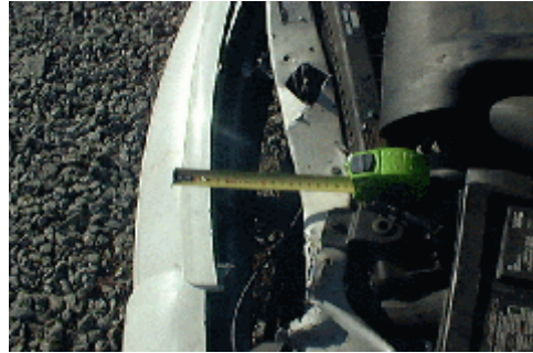
Figure 4. Identification of upper radiator support damage.