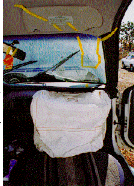
Figure 7. Overall view of the front right passenger compartment of the Neon and the fractured windshield.

A windshield glazing fracture was located 16.0 cm (6.3 in) left of the right A-pillar and 45.0 cm (17.7 in) below the windshield header. The spiderweb fracture was surrounded by an heavy skin oil transfer which extended to the windshield header. This fracture resulted from contact with the adult right front passenger's dorsal right hand and the dorsal right hand of the child female right front seated passenger. Several scattered small abrasions were noted to the lower aspect of the glove compartment door from probable contact with the lower aspect of the front right child seated passenger. Figure 7 identifies the front right passenger compartment area and the fractured windshield.