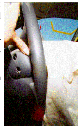
Figure 6. Dislodged plastic cover in position.

The posterior aspect of the steering wheel hub was equipped with plastic covers at the 3 and 9 o'clock positions. They were designed to house vehicle cruise control switches and some of their electronics. Although the case vehicle was not equipped with cruise control, the plastic covers were still available. The cover on an exemplar vehicle displayed the part number: 23199 223 5 4565347, and a white sticker was adhered to the cover which listed the identification: 4793490. The plastic covers were dislodged from the steering hub when the front left air bag of the Neon deployed. Figure 6 identifies the left side plastic cover which dislodged when the front left air bag deployed.