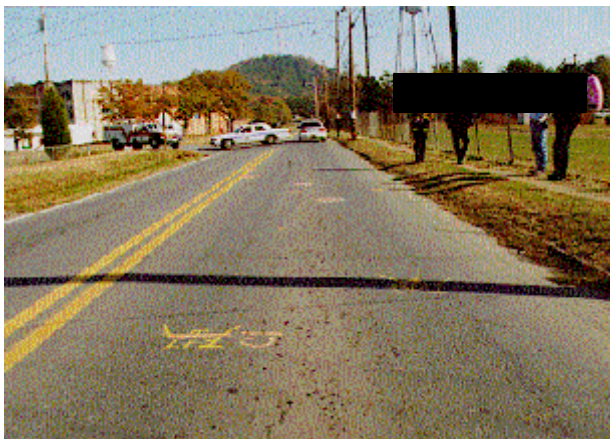
Figure 2. View of the Neon's direction of travel and the crash scene.

The crash occurred during the evening hours on a suburban east/westbound two-lane asphalt roadway with a posted speed limit of 56 km/h (35 mph). The level roadway was wet due to rainy conditions at the time of the crash and viewing conditions were reported as fair by the investigating police officer. The south shoulder of the roadway was bordered by a deteriorating concrete curb which had a maximum height of 15.2 cm (6.0 in), a grass berm, sidewalk and fence. The north shoulder of the roadway was bordered by grass and a drainage ditch. Figure 2 identifies the crash scene and the initial direction of travel for the Neon.