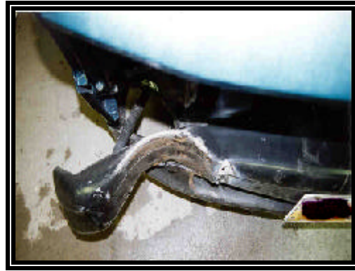
Figure 4 - Overhead view of the impact damage to the front bumper illustrating the extent of crush

The following table lists crush values obtained after setting the front bumper back in position following its removal by the repair shop. These values should be considered as minimum crush values.