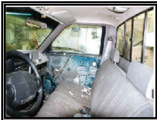
Figure 10 - lateral view of the front seat area from the left side of the vehicle

The bench seat was reportedly in the full rear adjusted position ( Figure 10 ). The continuous loop three point manual lap and shoulder belts in the outboard set positions did not exhibit any latch plate witness marks ( Figure 11 ) which was consistent with non-restraint usage in the crash. The D-rings were fixed.