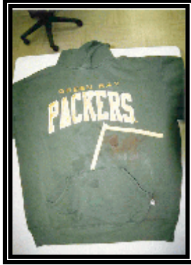
Figure 1 -View of the burn marks on the front of the driver's sweatshirt