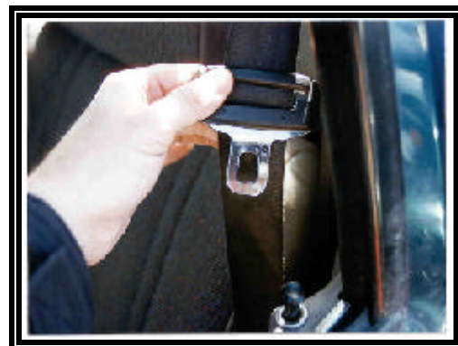
Figure 11 - View of the front left restraint belt latch plate showing the lack of usage related witness marks

The vehicle was equipped with a five-speed manual transmission. There was no damage noted to the floor mounted shift lever.