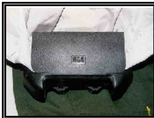
Figure 13 - View of the lower air bag module cover flap