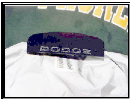
Figure 12 - View of the upper air bag module cover flap

The air bag module cover opened in an "H" configuration with the vertical dimension of the upper flap measuring 6.4 cm (2.5") and the lower flap measuring 7.0 cm (2.75") vertically. The common lateral seam line width measured 16.5 cm (6.5"). The supple vinyl flap thickness measured 6.4 mm (0.25"). There was no driver related contact evidence noted on the surfaces of the flaps ( Figures 12 & 13 ).