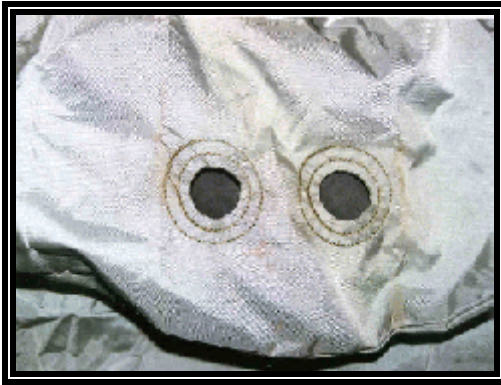
Figure 14 - View of the air bag vent ports illustrating the brown discoloration

The inflator unit was manufactured by Morton International with an identification label located on the back side of the inflator which read: CBE E8A 3Z CQF ( Figure 15 ). There were no obvious defects in the inflator housing.