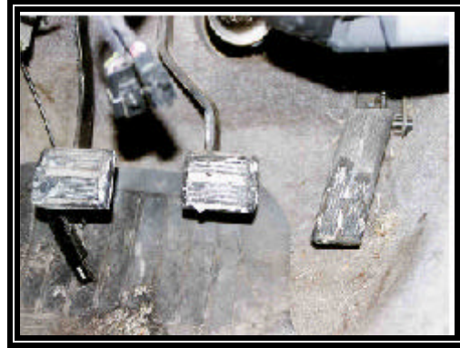
Figure 9 - View of cake like product embedded in vehicle control pedals

There was a food product (cake like substance) noted to the instrument panel and foot pedals. It appeared that this product had been on the seat and struck the instrument panel during the crash sequence. It apparently fell on the floor where the driver upon re-entering apparently stepped on the product and tracked it onto the accelerator, brake, and clutch pedals ( Figure 9 ).