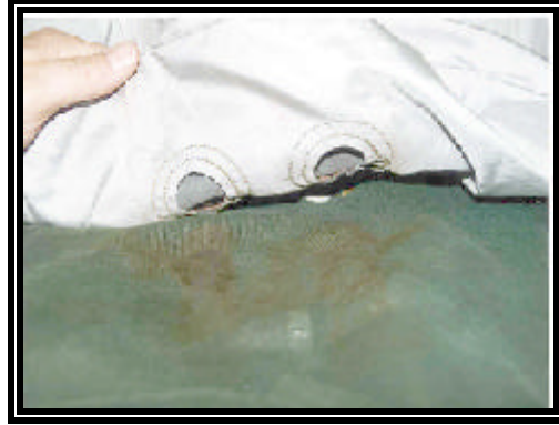
Figure 2 -View of the burn marks on the sweatshirt in correlation with the size and location of the air bag vent ports

The driver was sitting on the seat at the final rest position (FRP) with the steering wheel in his lap. He indicated that he was somewhat disoriented for a short time when he suddenly noticed the jacket he was wearing was smoldering. He exited the vehicle and was met by the front right occupant who helped him to remove the jacket and throw it on the ground.