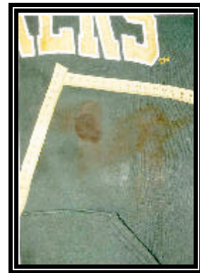
Figure 16 - View of the circular burn marks on sweatshirt which were attributed to exhaust gases from vent ports

The driver's sweatshirt (50/50 cotton polyester blend) exhibited well defined singe marks located along the left lower chest area which were attributed to contact with the air bag vent ports during the SRS actuation sequence. The prominent circular pattern noted in Figure 16 (the pattern closest to the vertical calibrated tape) measured 3.2 cm (1.25") in diameter and was located 38.7 cm (15.25") below the shoulder and 7.0 cm (2.75") left of the shirt midline. There was a 9.5 mm (0.375") diameter burn hole in the upper right which was attributed to generant debris exiting the right vent port during the air bag actuation sequence. There were several surrounding circular brown singe marks