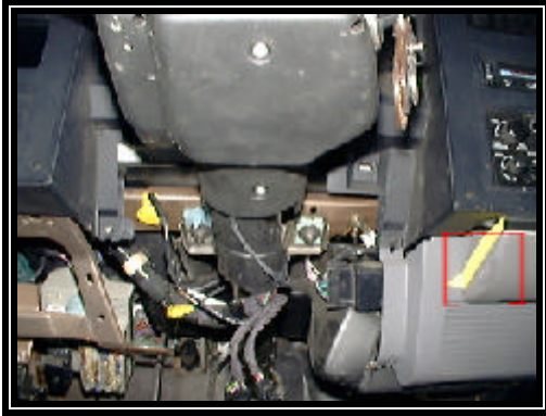
Figure 8 - Contact evidence along the left edge of the ashtray door (highlighted by a red box)