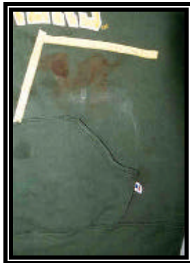
Figure 17 - View of the white transfer mark on the left front lower surface of the sweatshirt

The driver's white 100 percent cotton undershirt exhibited two distinct brown singe mark patterns which were located on the left side of the shirt and correlated with the singe marks noted on the sweatshirt ( Figure 18 ). The first pattern which was closest to the centerline of the undershirt began 33.0 cm (13.0") below the left shoulder and extended 12.7 cm (5.0") downward. The second singe pattern was located 34.3 cm (13.5") below the left shoulder and 7.6 cm (3.0") left of the first pattern (center to center). Both singe marks measured 2.9 cm (1.125") in width.