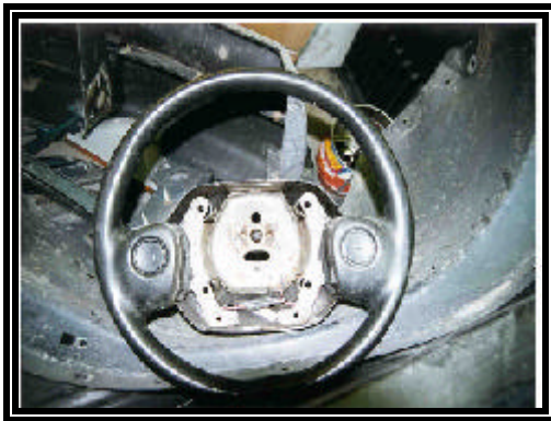
Figure 6 - Frontal view of the steering wheel rim

The steering wheel rim was not deformed as shown in Figures 6 and 7 . The air bag module was removed by the repair facility.