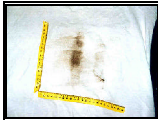
Figure 18 - View of the singe marks on the drive's undershirt which correlated with the location of the singe marks on the sweatshirt