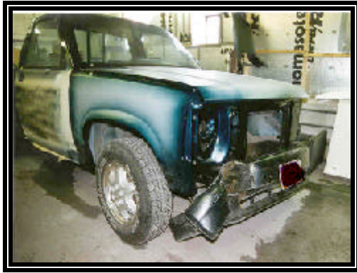
Figure 3 - Right front corner view of the Dodge Dakota showing the direct impact damage to the right front bumper area