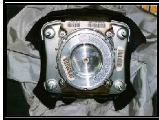
Figure 15 - View of the rear surface of the inflator unit

The driver was wearing a wool blend wool designer jacket over a pullover green sweatshirt and a white undershirt. The jacket was worn in the open mode at the time of the crash. Following the crash, the driver noticed that his jacket was smoldering and exited his vehicle. With the assistance of the front right passenger, he removed the jacket, threw it on the ground, and stepped on it to extinguish it. The driver indicated that the jacket was ruined with burn holes, so he left it at the scene. The driver claimed he was a non-smoker.